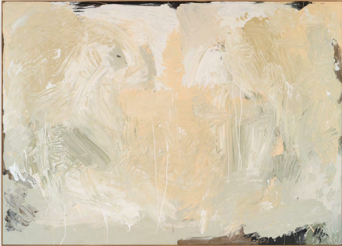
THOMAS MCDONELL Untitled (PRS, B3) , 2025 Alkyd enamel on canvas, padauk frame 66 × 92 inches USD 20,000