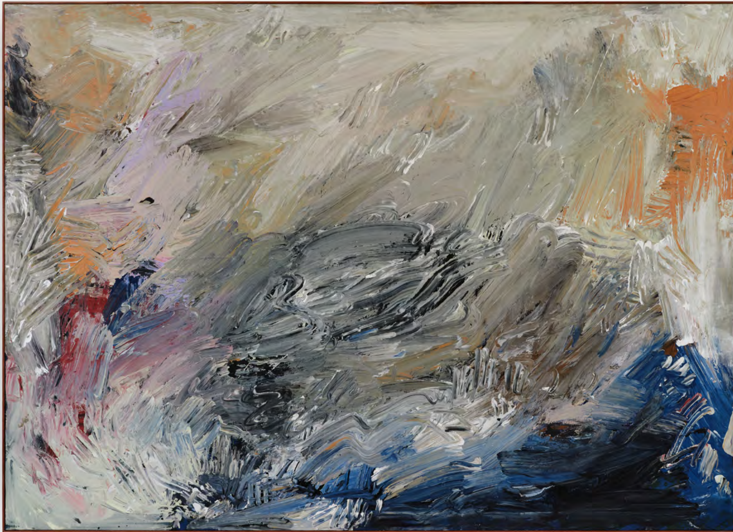
THOMAS MCDONELL Untitled (West Washington Blvd, Tempest) , 2026 Alkyd enamel on cotton and silk, padauk frame 66 x 92 inches USD 20,000