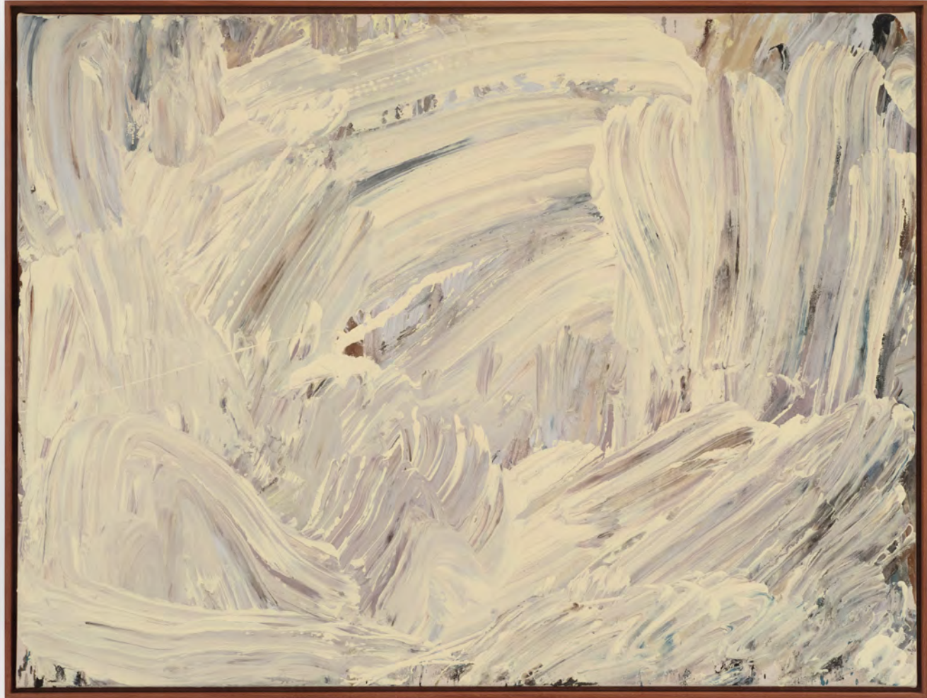
THOMAS MCDONELL Untitled (Interior Whites, Yellow Depth) , 2026 Alkyd enamel on linen, walnut frame 30 x 40 inches USD 9,000