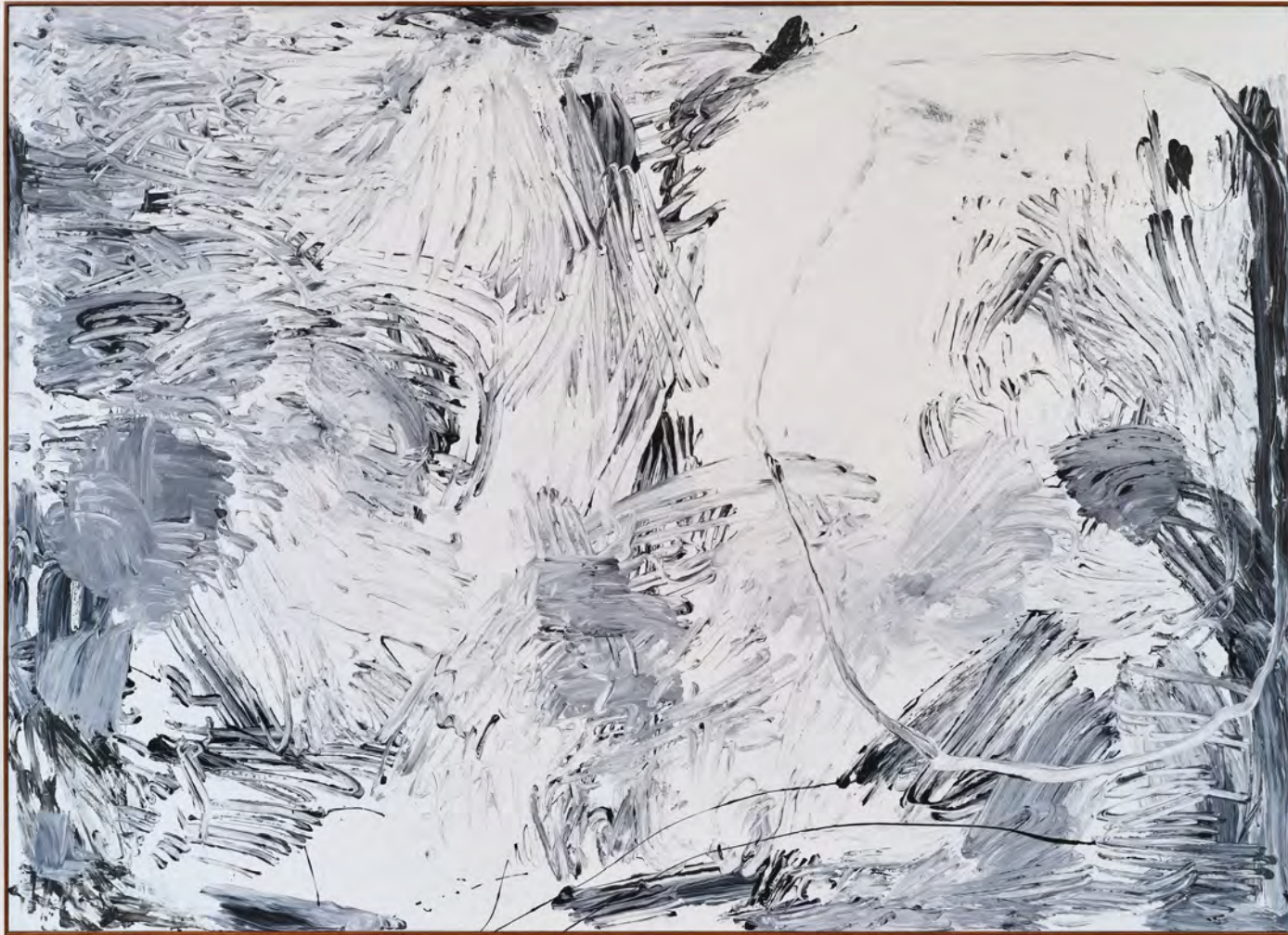
THOMAS MCDONELL Untitled (West Washington Blvd, Void Right) , 2026 Alkyd enamel on cotton, padauk frame 66 x 92 inches USD 20,000