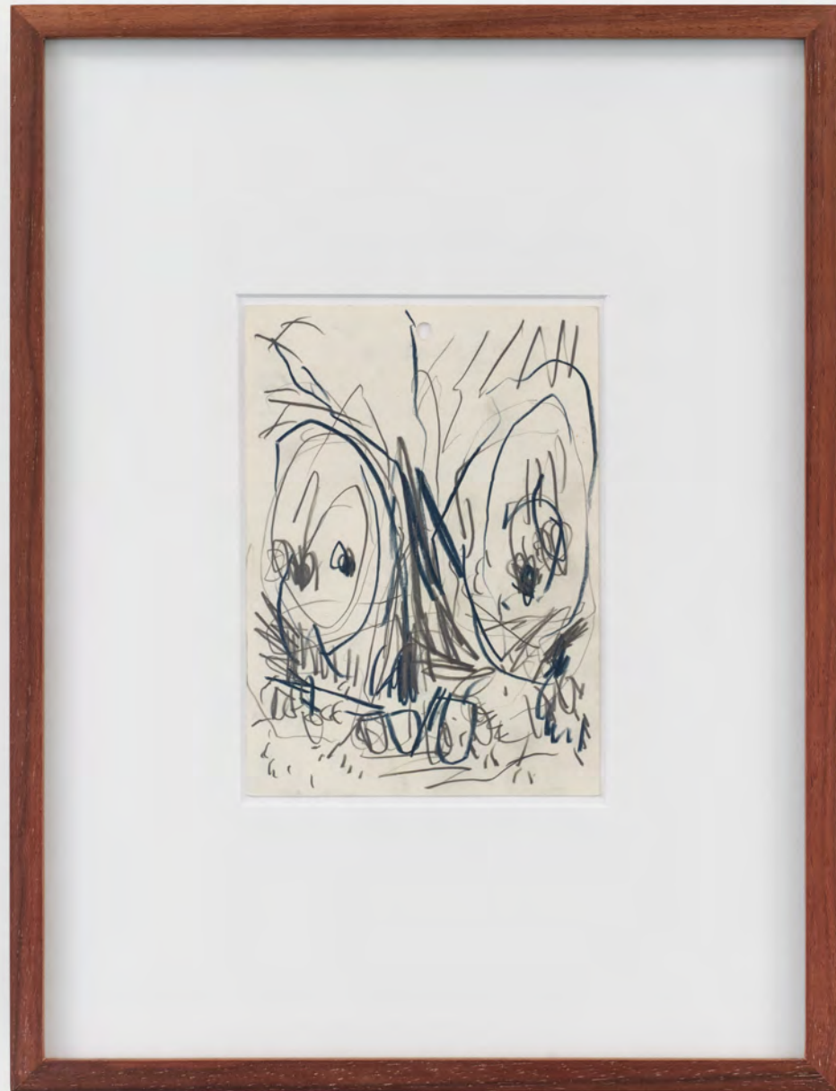
THOMAS MCDONELL progress (planing mill drawing) , 2025 pencil on card stock 7.5 x 5.375 inches USD 4,500