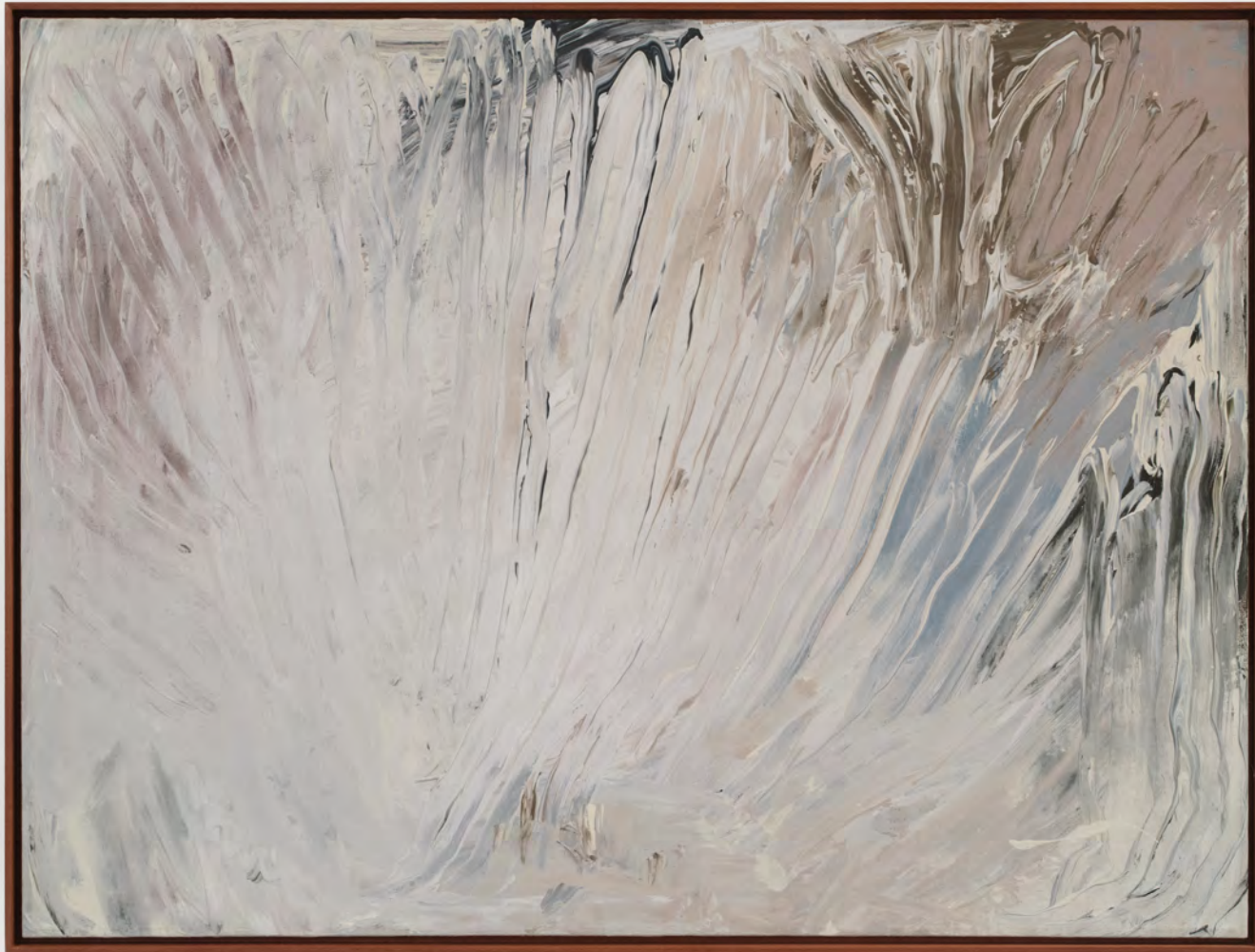
THOMAS MCDONELL Untitled (Interior Whites, Lavender Coral) , 2026 Alkyd enamel on linen, walnut frame 30 x 40 inches USD 9,000