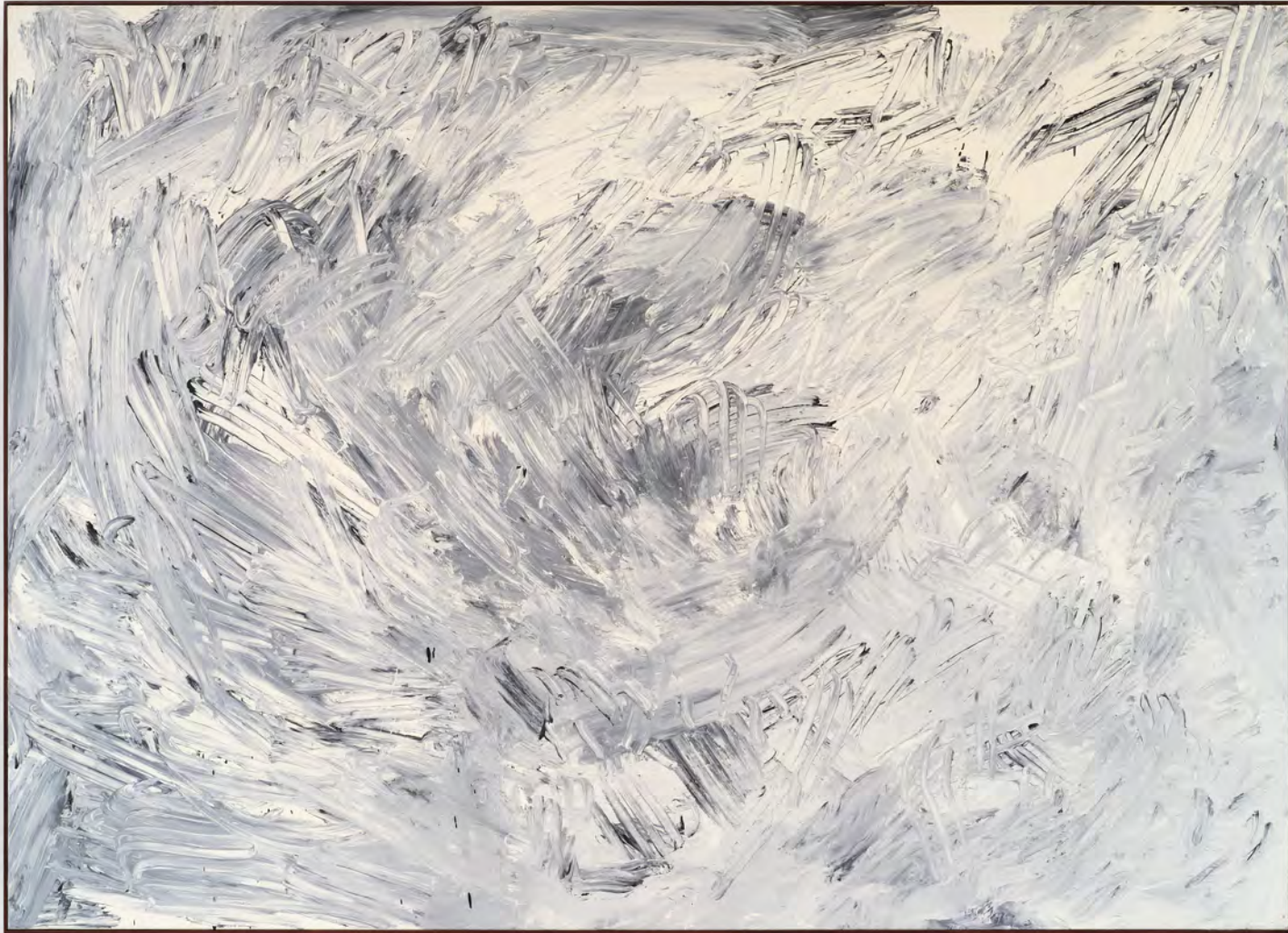
THOMAS MCDONELL Untitled (PRS, B4) , 2025 Alkyd enamel on canvas, padauk frame 66 x 92 inches USD 20,000