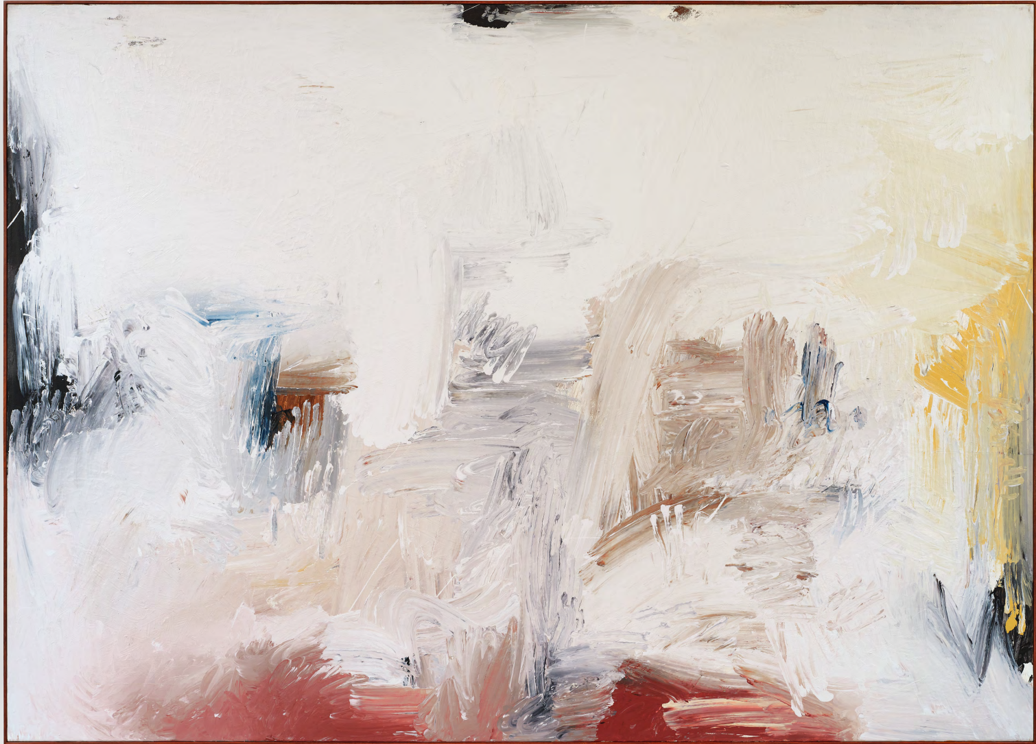
THOMAS MCDONELL Untitled (West Washington Blvd, Interior Whites Primaries) , 2026 Alkyd enamel on cotton and silk, padauk frame 66 x 92 inches USD 20,000