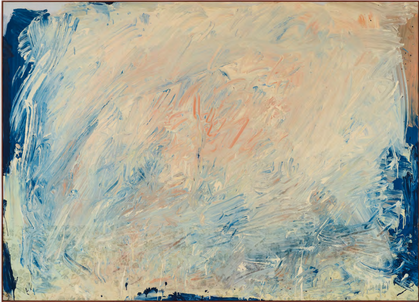
THOMAS MCDONELL Untitled (West Washington Blvd, Interior Whites Blue and Yellow Not Green) , 2026 Alkyd enamel on cotton and silk, padauk frame 66 x 92 inches USD 20,000