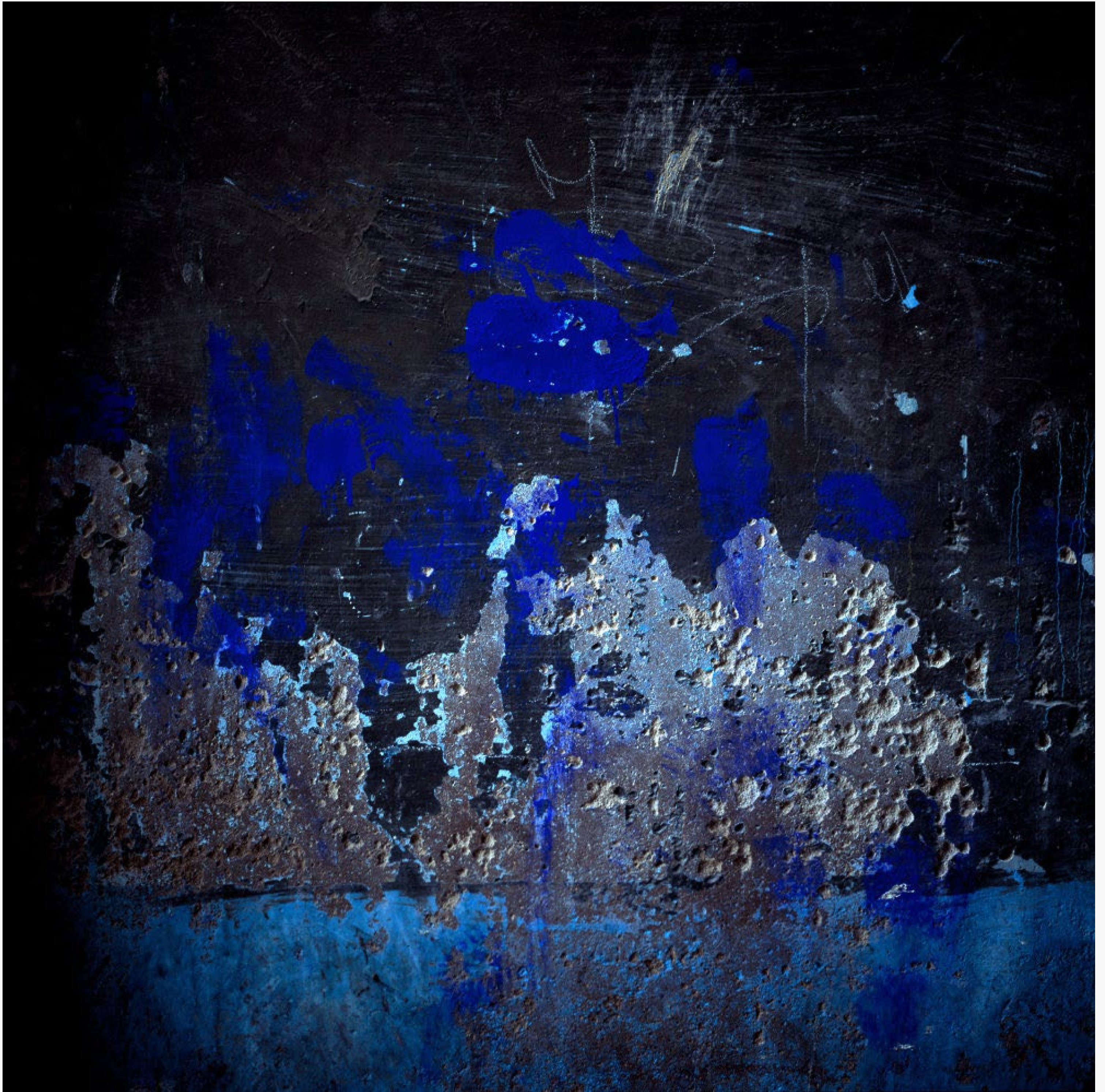
Blue Klein , 1993/2020 Inkjet printing on paper 78.8 x 78.5 cm (31 x 31 in), Edition of 7 US$ 15,000.00