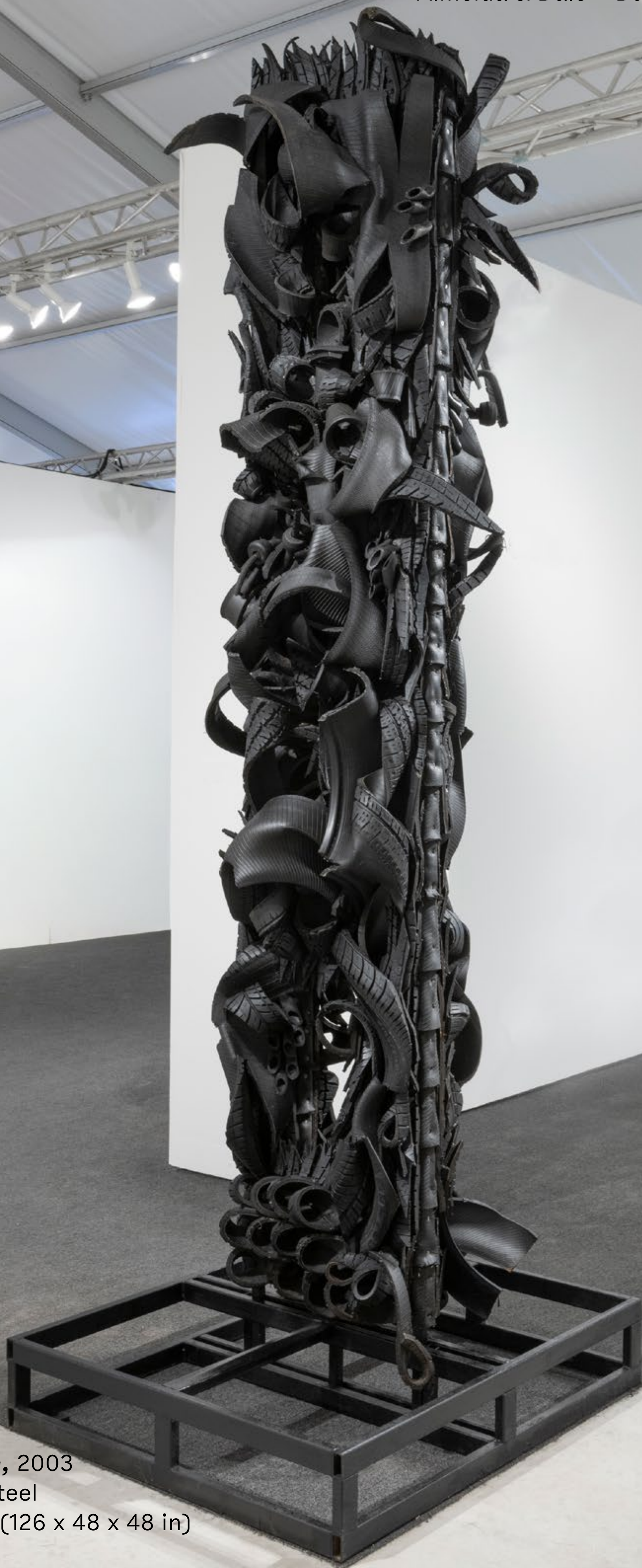
Destiny's Doorman , 2003 Rubber tires and steel 320 x 122 x 122 cm (126 x 48 x 48 in) US$ 225,000.00