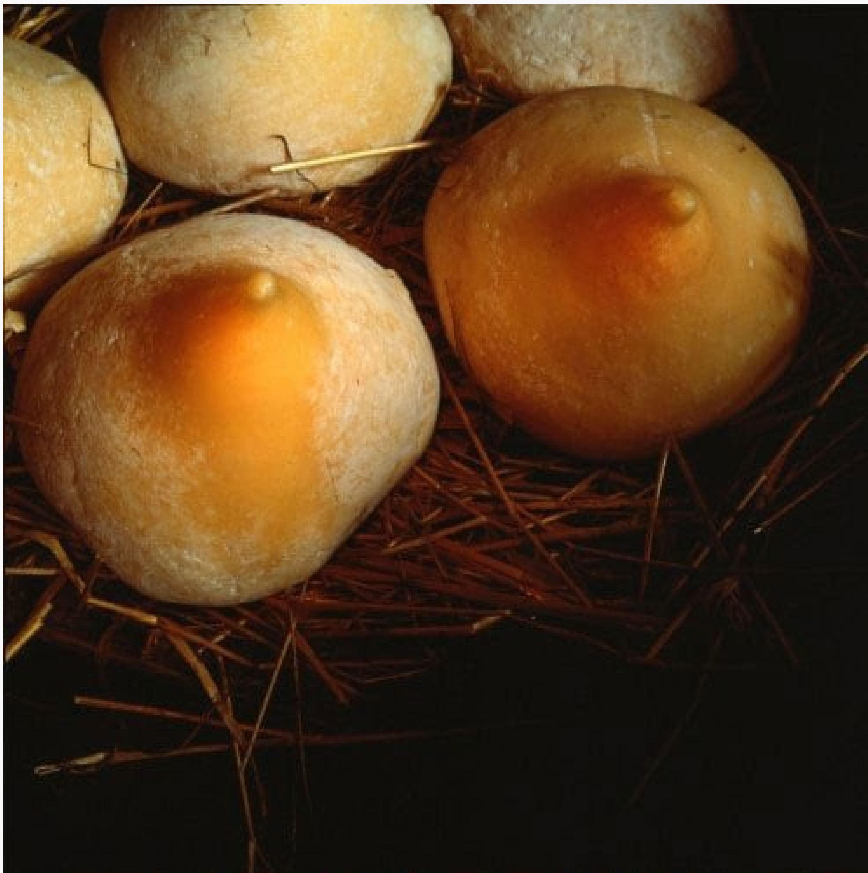
Tetas de Santiago , 1993/2012