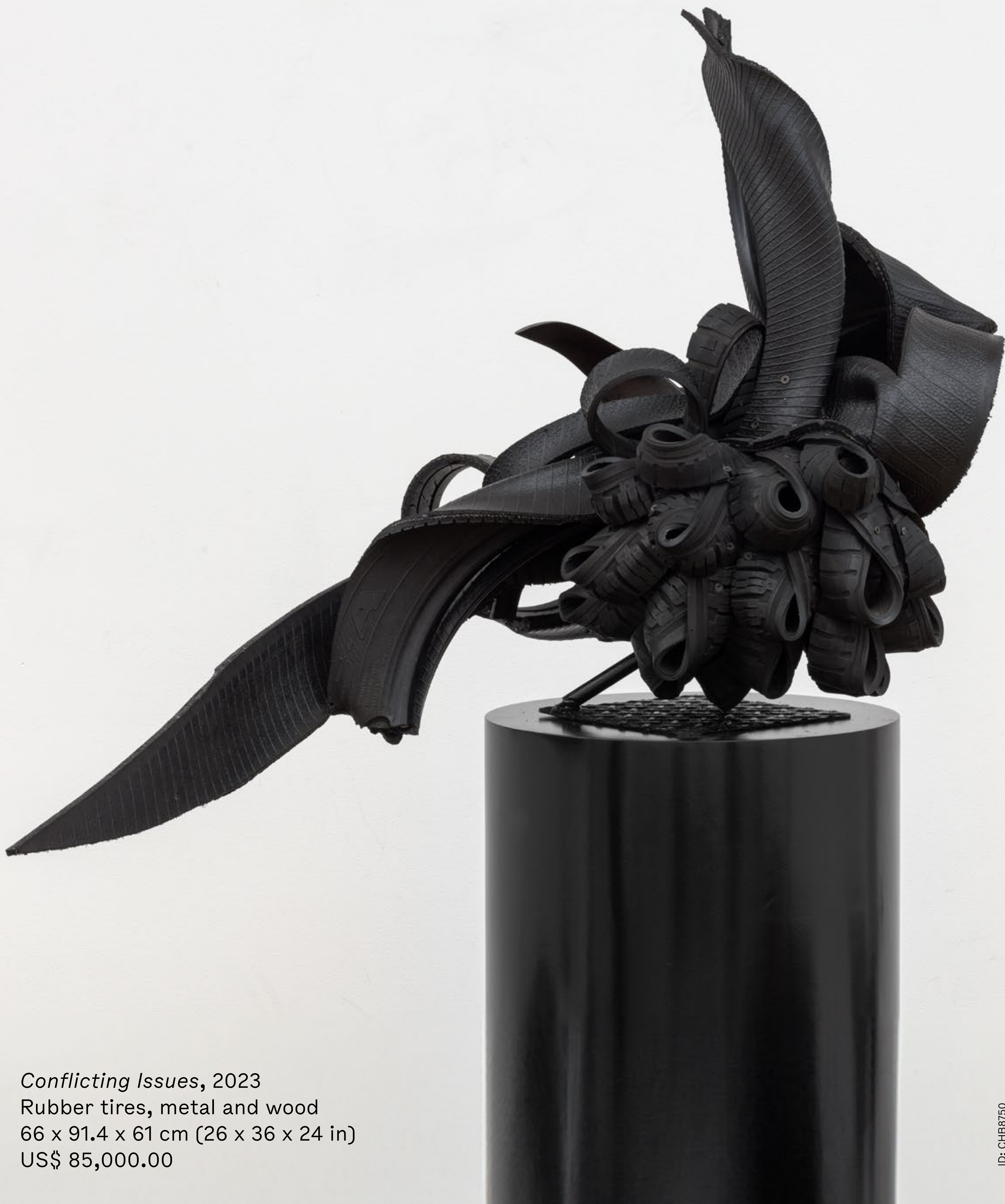
Conflicting Issues , 2023