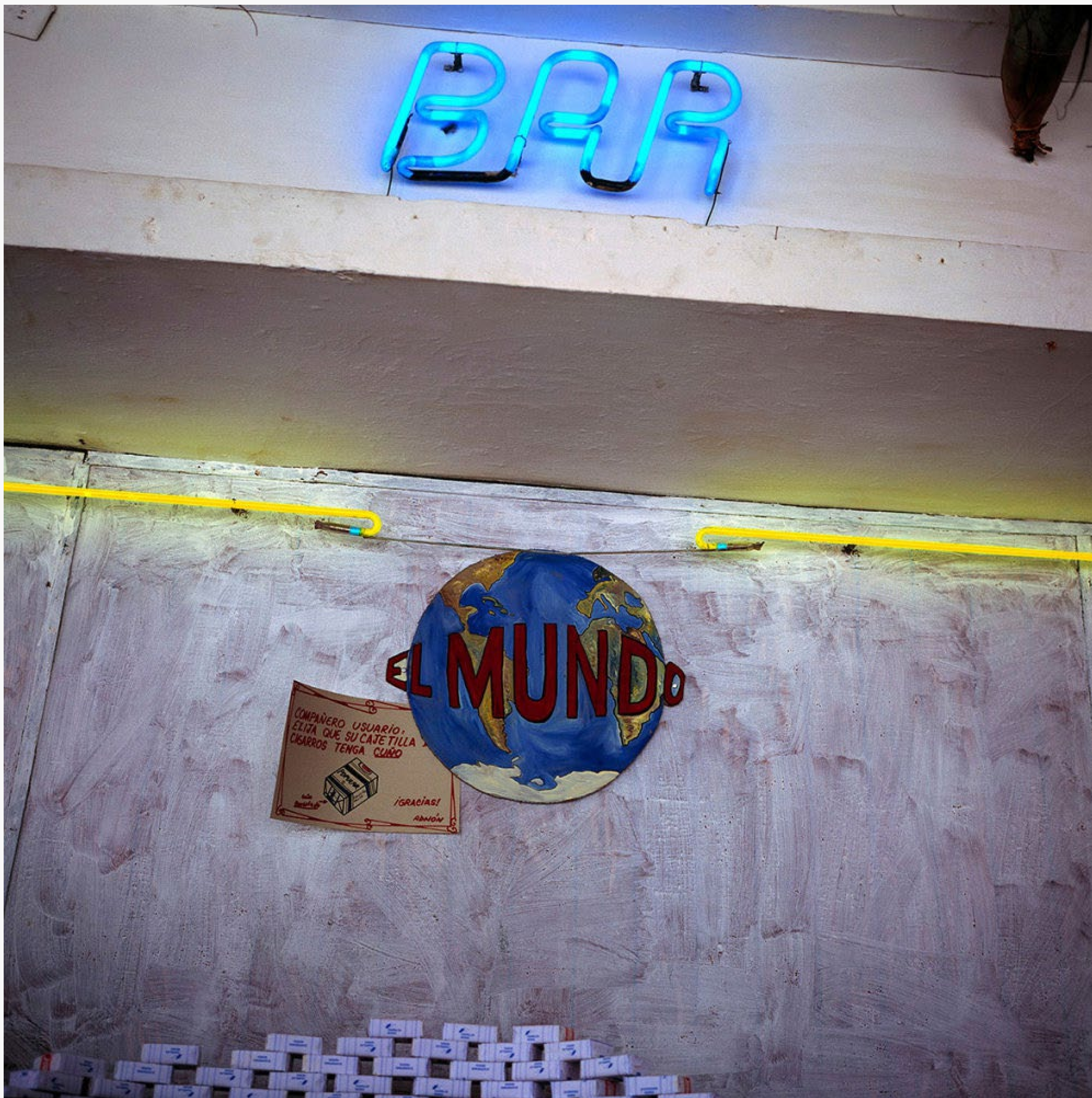
El Mundo , 2011