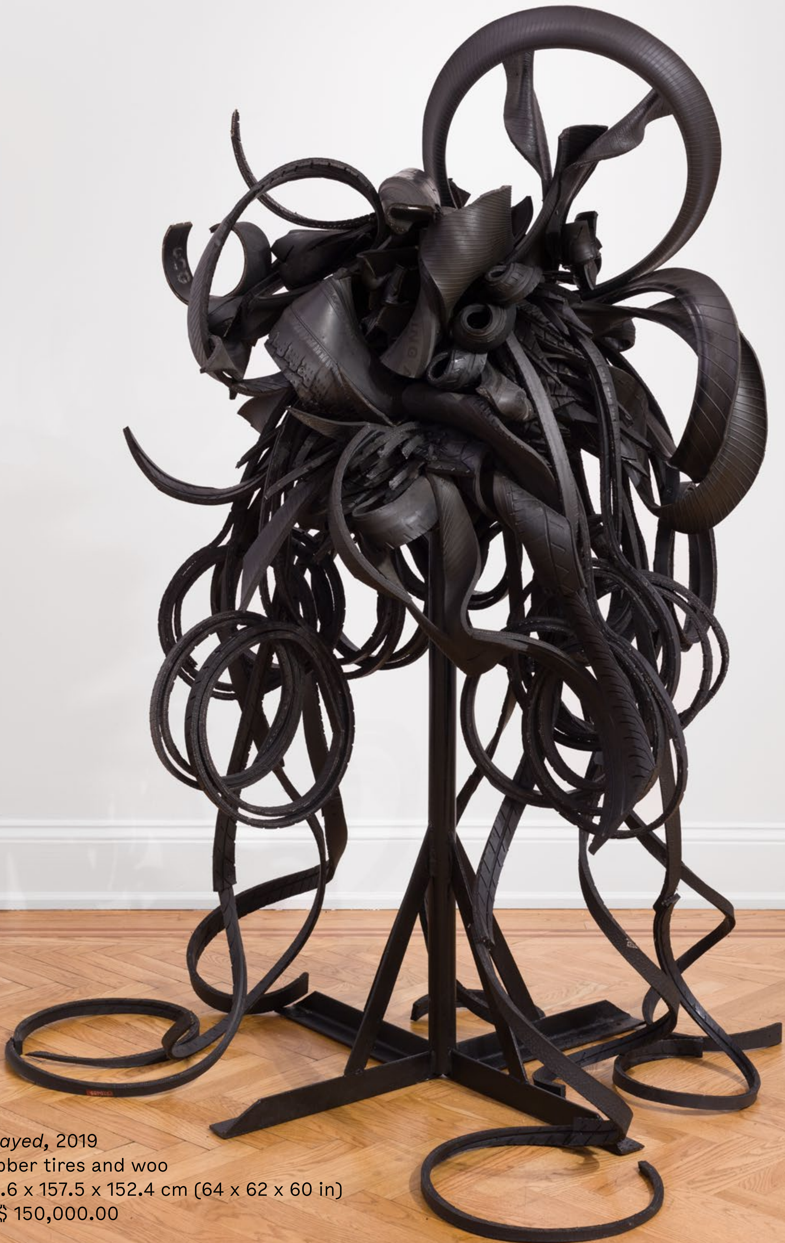
Strayed , 2019 Rubber tires and wool 162.6 x 157.5 x 152.4 cm (64 x 62 x 60 in) US$ 150,000.00