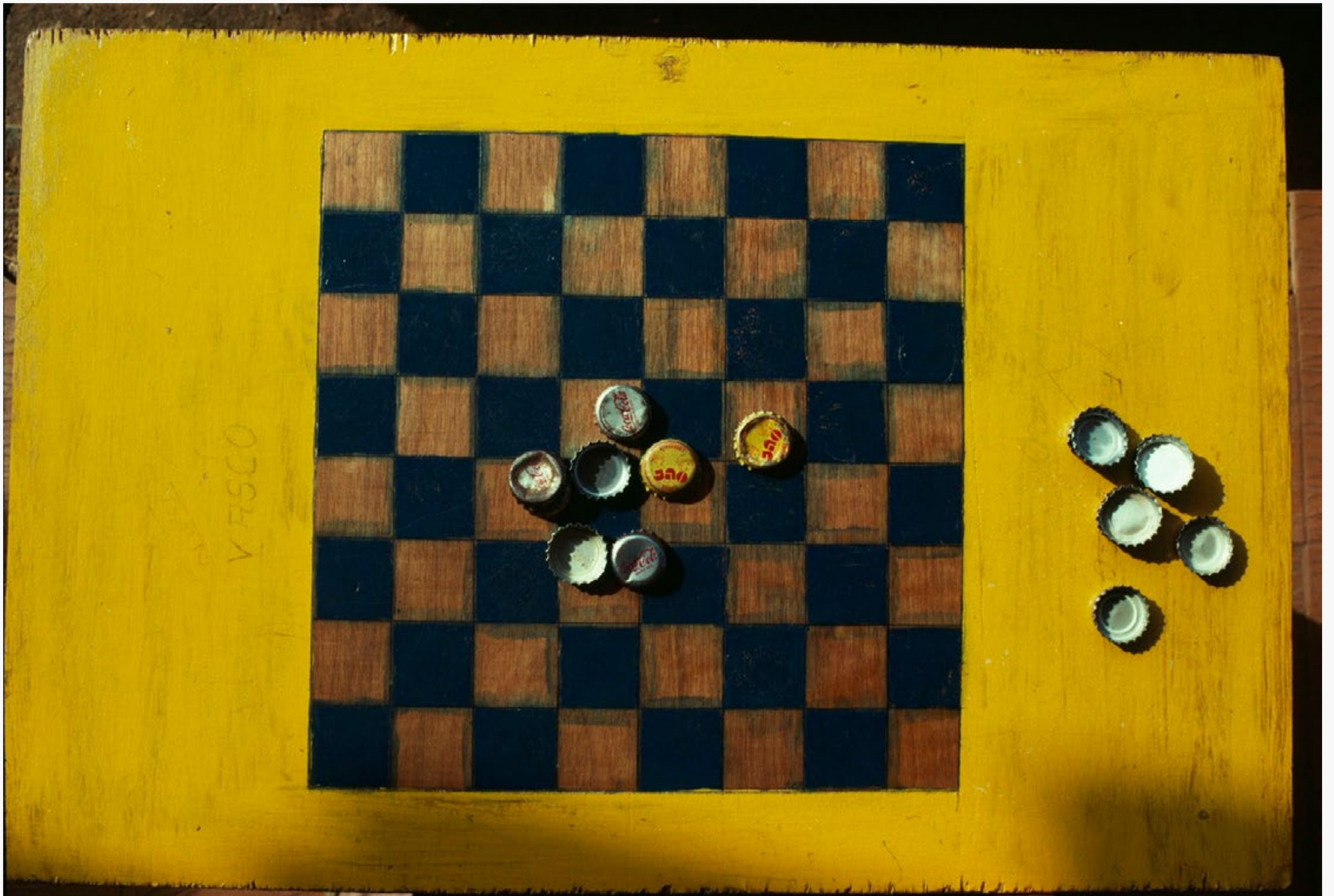
Yellow and Black Chess , 1985