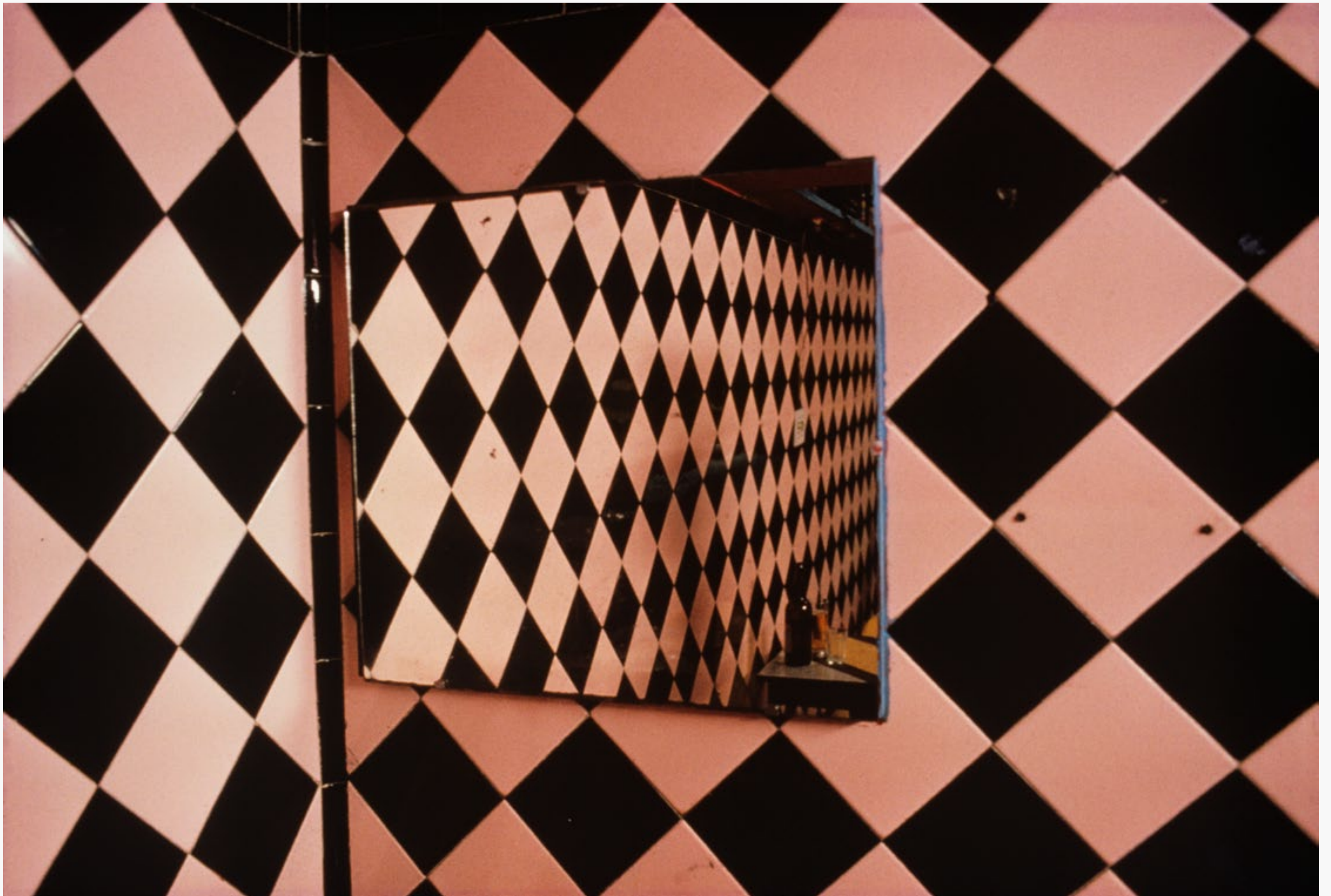
Pink and Black Chess , 1988