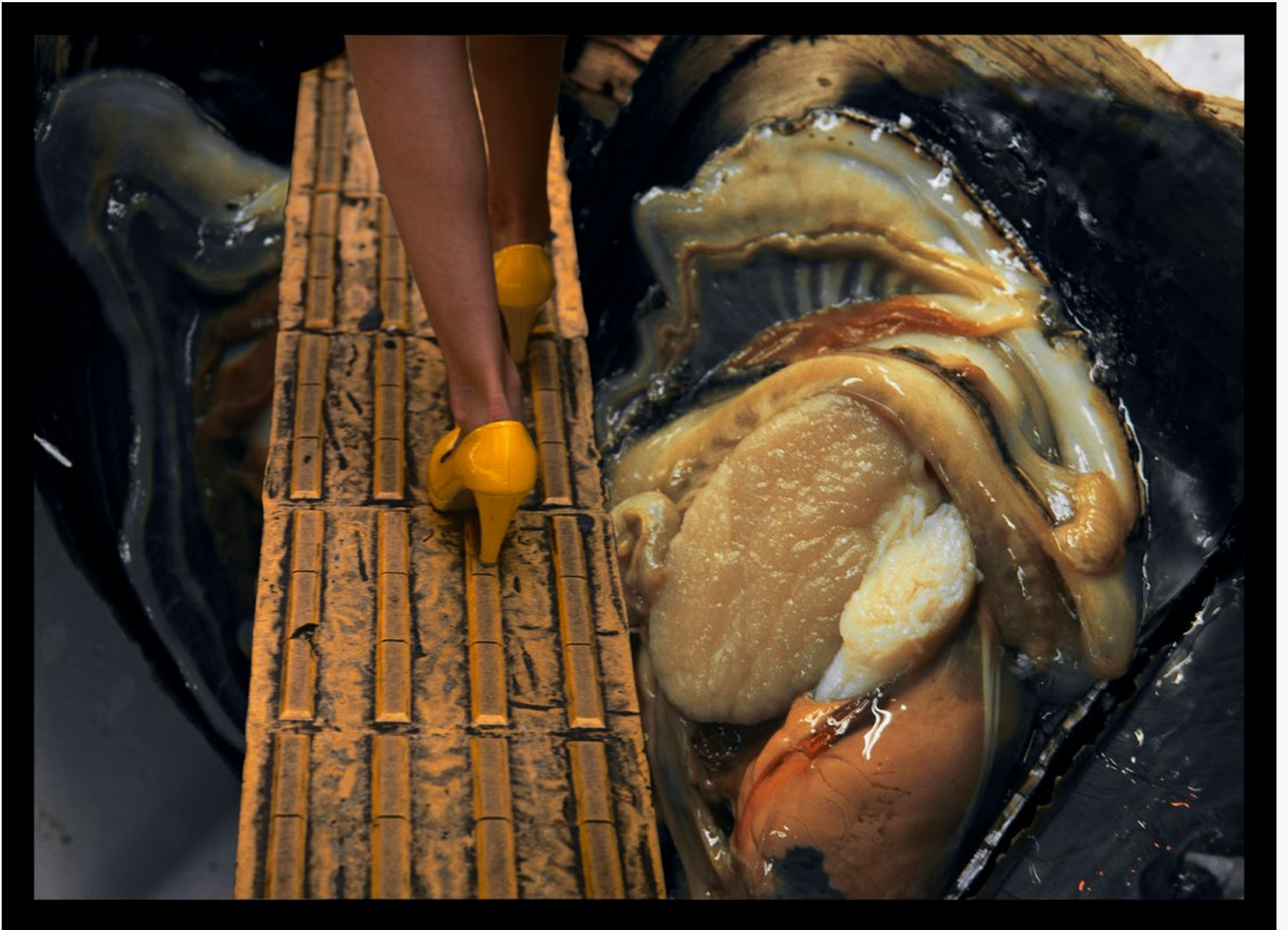
Yellow shoes thinking of Max Ernst, 2007/2014