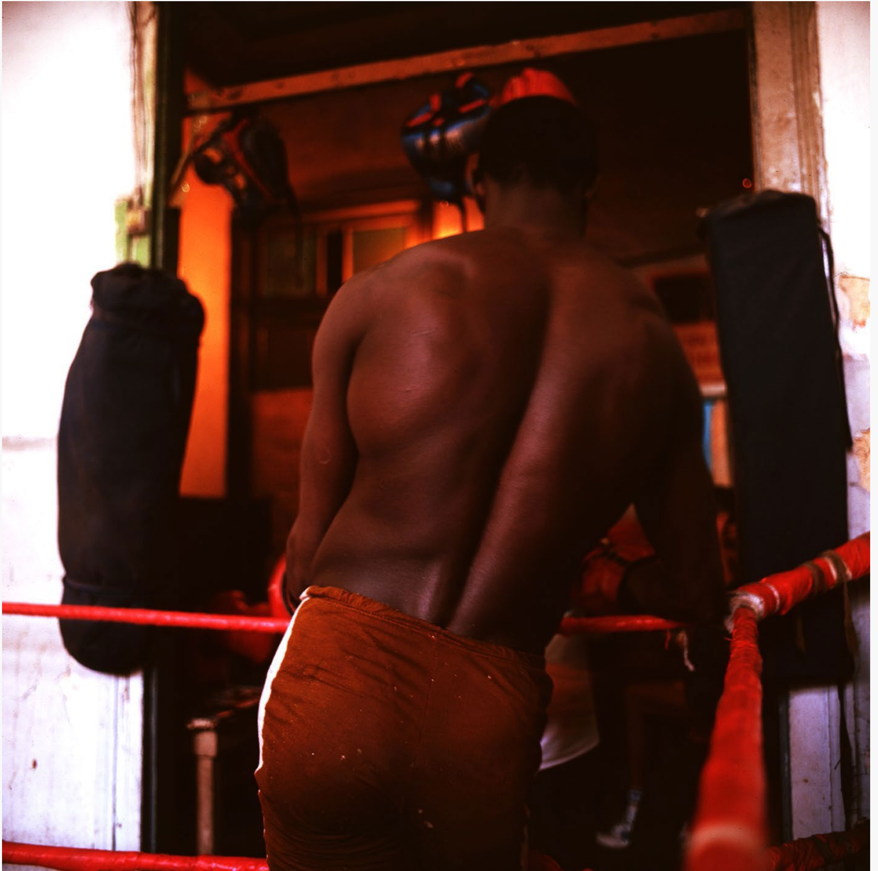
Back , 1991/2017