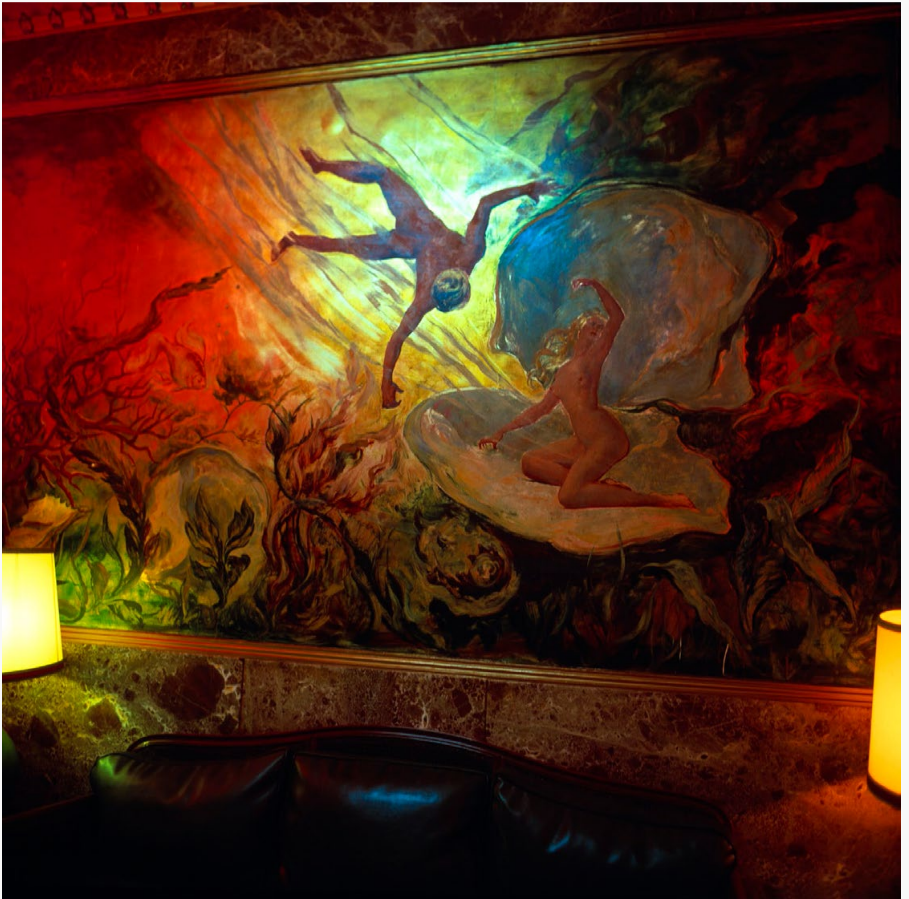
Hotel Monaco falling, n.d.