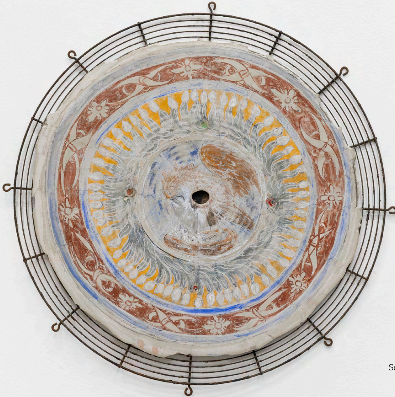
Sangre blanca , 2026 Setting of concrete, pigments and graphite on metal structure 93 x 93 cm 36 5/8 x 36 5/8 in