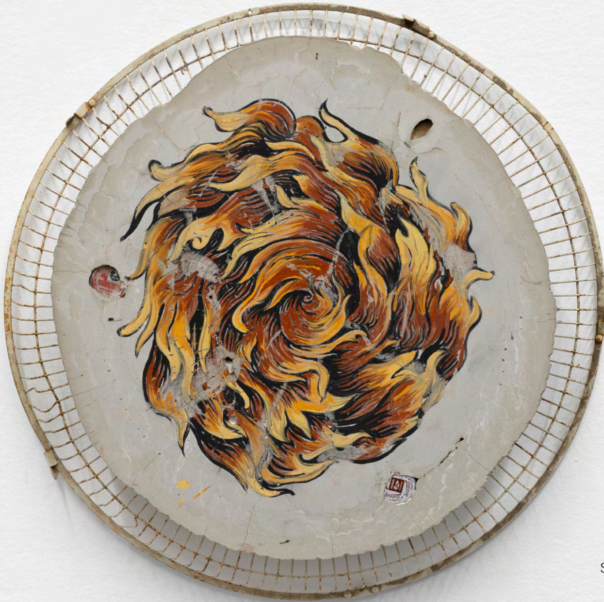
Remolino de lumbre, 2026 Setting of concrete, pigments and graphite on metal structure 42 x 42 x 7 cm 16 1/2 x 16 1/2 x 2 3/4 in $ 4,000.00 USD + VAT