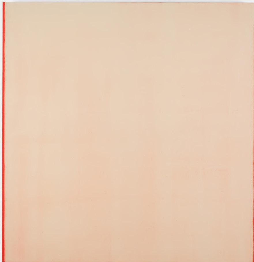
Callum Innes Untitled Cadmium Red Light, 2025 oil on canvas 160 x 156 x 4 cm / 63 x 61.4 x 1.6 in CI C 75 2025 Price: £ 110,000 (+ VAT if in EU)