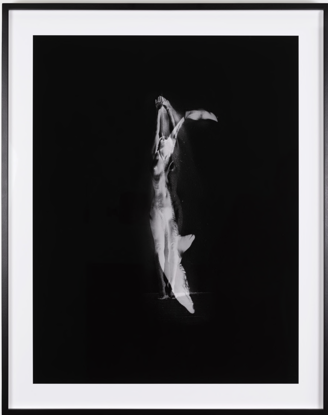
Dorothy Cross Overlap (Merge), 1991 archival pigment print on Hahnemühle Photo Rag 308 API from an edition of 4 +2AP 95 x 76 x 4.7 cm / 37.4 x 29.9 x 1.9 in framed DC39091-API Price: € 10,000 (+ VAT if in EU)