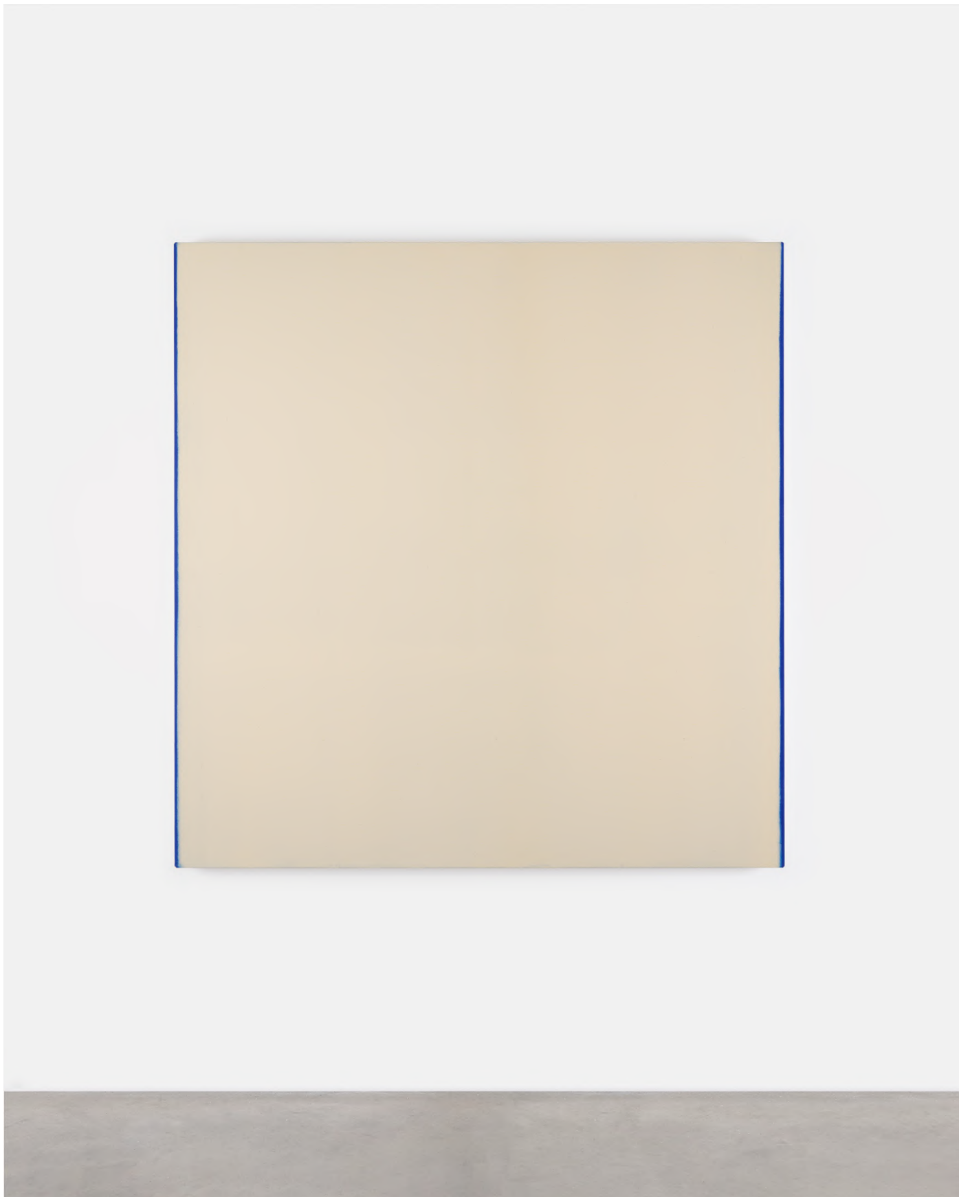
Callum Innes Untitled Cobalt Blue Light, 2025 oil on canvas 160 x 156 x 4 cm / 63 x 61.4 x 1.6 in CI C 64 2025 Price: £ 110,000 (+ VAT if in EU)