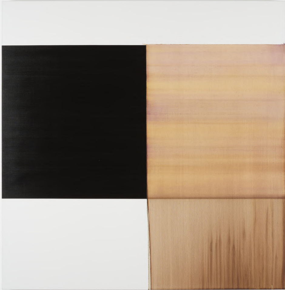
Callum Innes Exposed Painting Gold Green / Violet , 2025 oil on linen 162 x 160 x 4 cm cm / 63.8 x 63 x 1.6 in CI C 76 2025 Price: £ 110,000 (+ VAT if in EU)