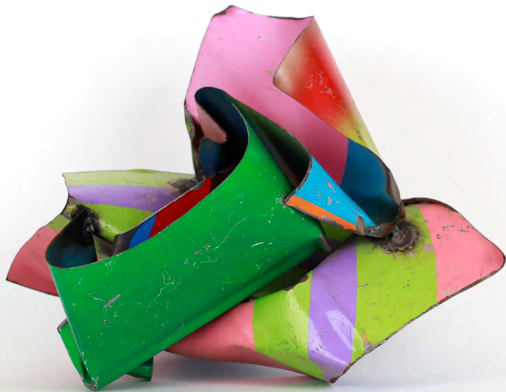
John Chamberlain 'THE KINGSCATHEDRAL' 1996 Painted and stainless steel 26.0 x 31.6 x 23.5 cm (10.25 x 12.5 x 9.25 in)