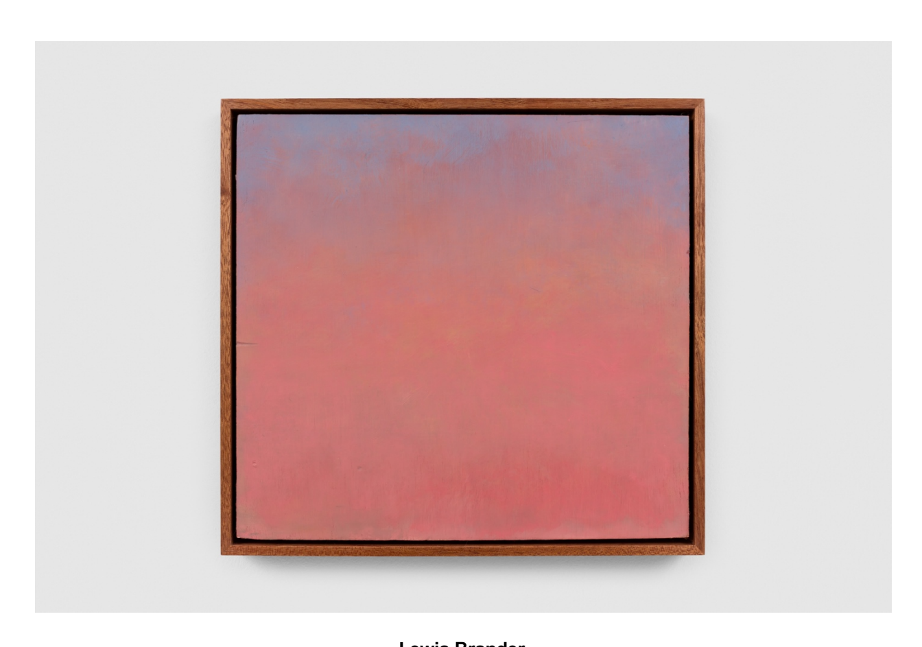
Lewis Brander Red over Purple (2025) Oil on wooden panel 12 1/4 x 12 3/4 inches (framed) $10,000