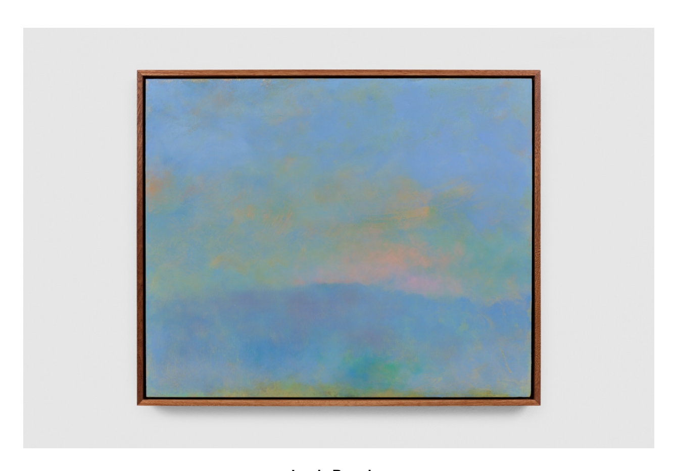
Lewis Brander Attican Grove (2025) Oil on wooden panel 16 x 19 ½ inches (framed) $13,000