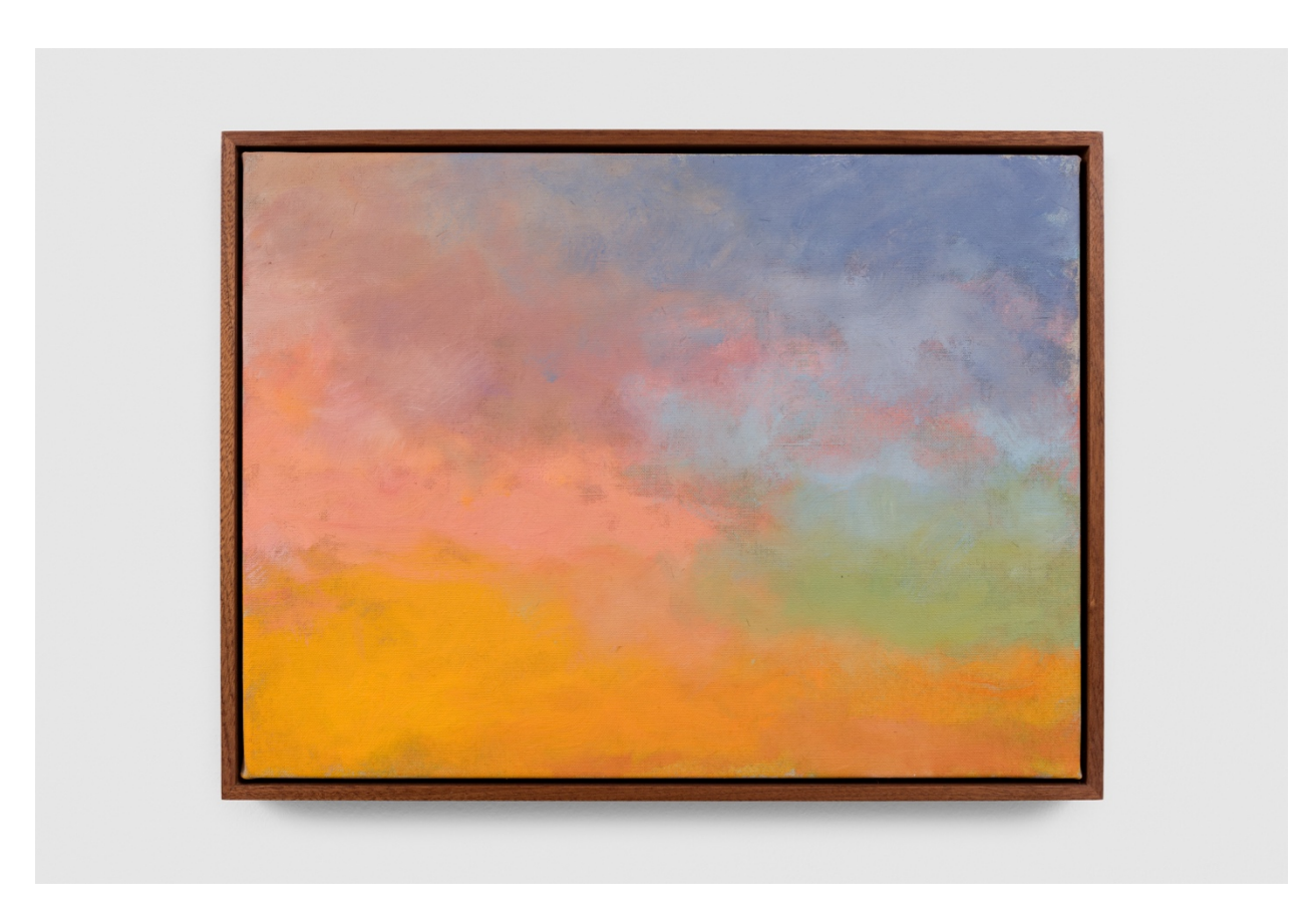
Lewis Brander East and West II (2025) Oil on linen 12 x 16 ¾ inches (framed) $11,000 (reserved)