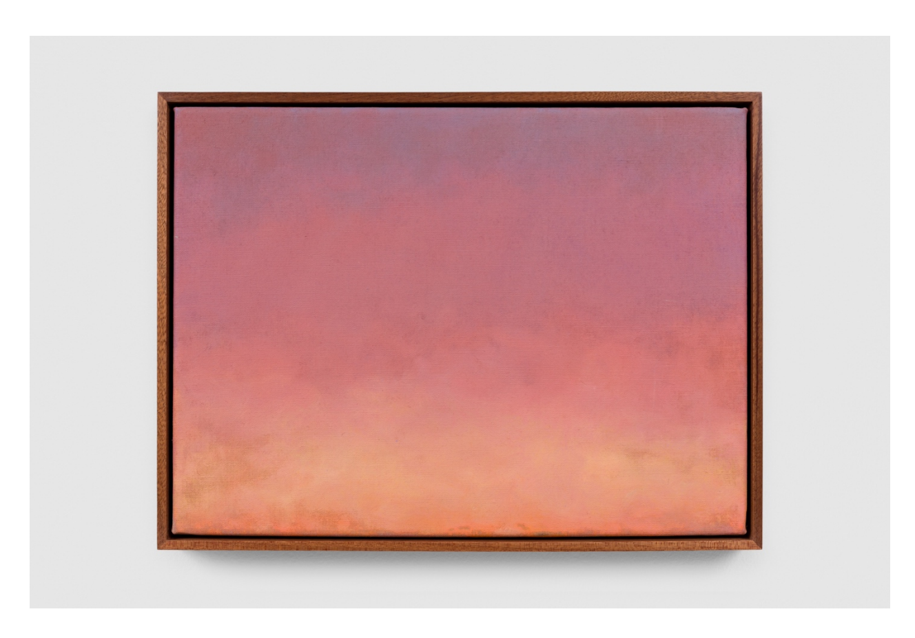
Lewis Brander Field VI (2025) Oil on linen 12 x 16 inches (framed) $11,000