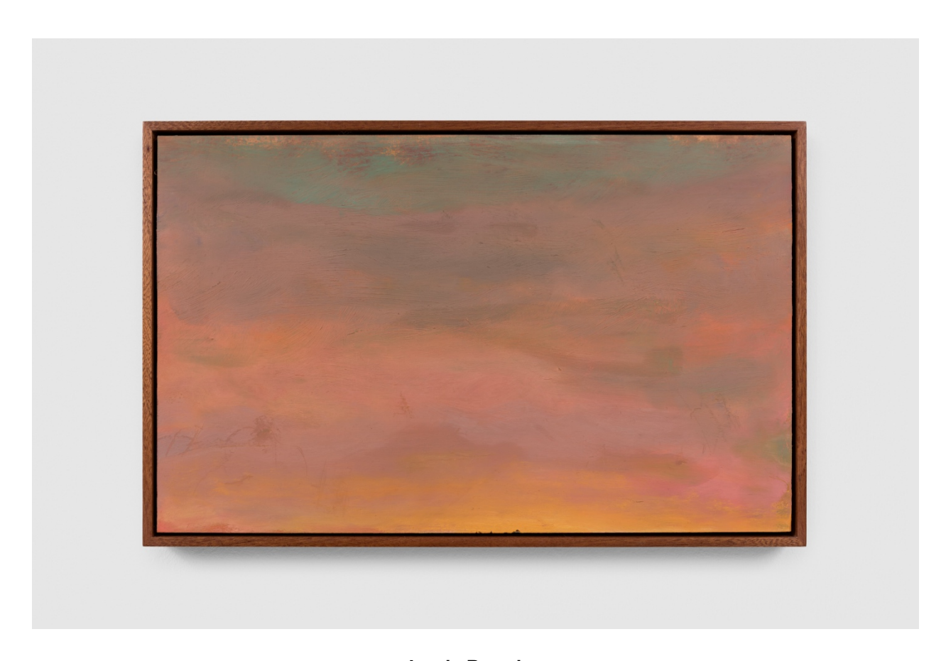
Lewis Brander Veridian (2025) Oil on wooden panel 12 x 19 ½ inches (framed) $11,500