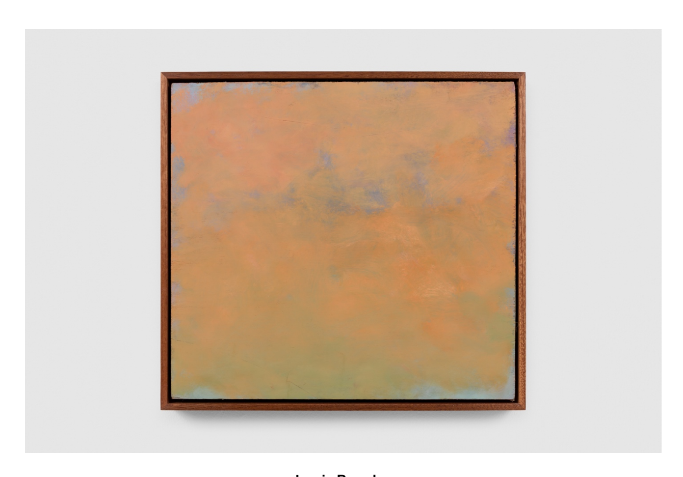
Lewis Brander Banks (2025) Oil on wooden panel 13 x 15 inches (framed) $11,000