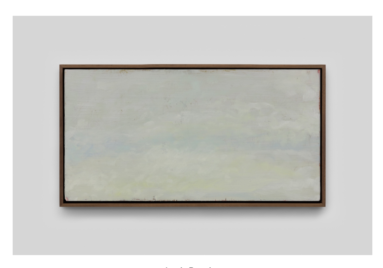
Lewis Brander London Sky (2023) Oil on wooden panel 10 x 20 inches framed $11,500