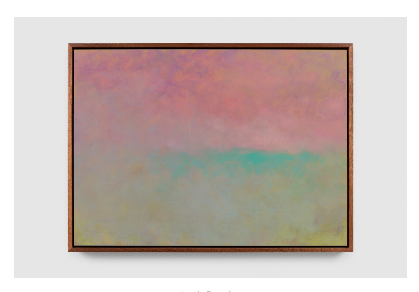
Lewis Brander Eastern II (2025) Oil on wooden panel 14 x 19 1/4 inches (framed) $12,500