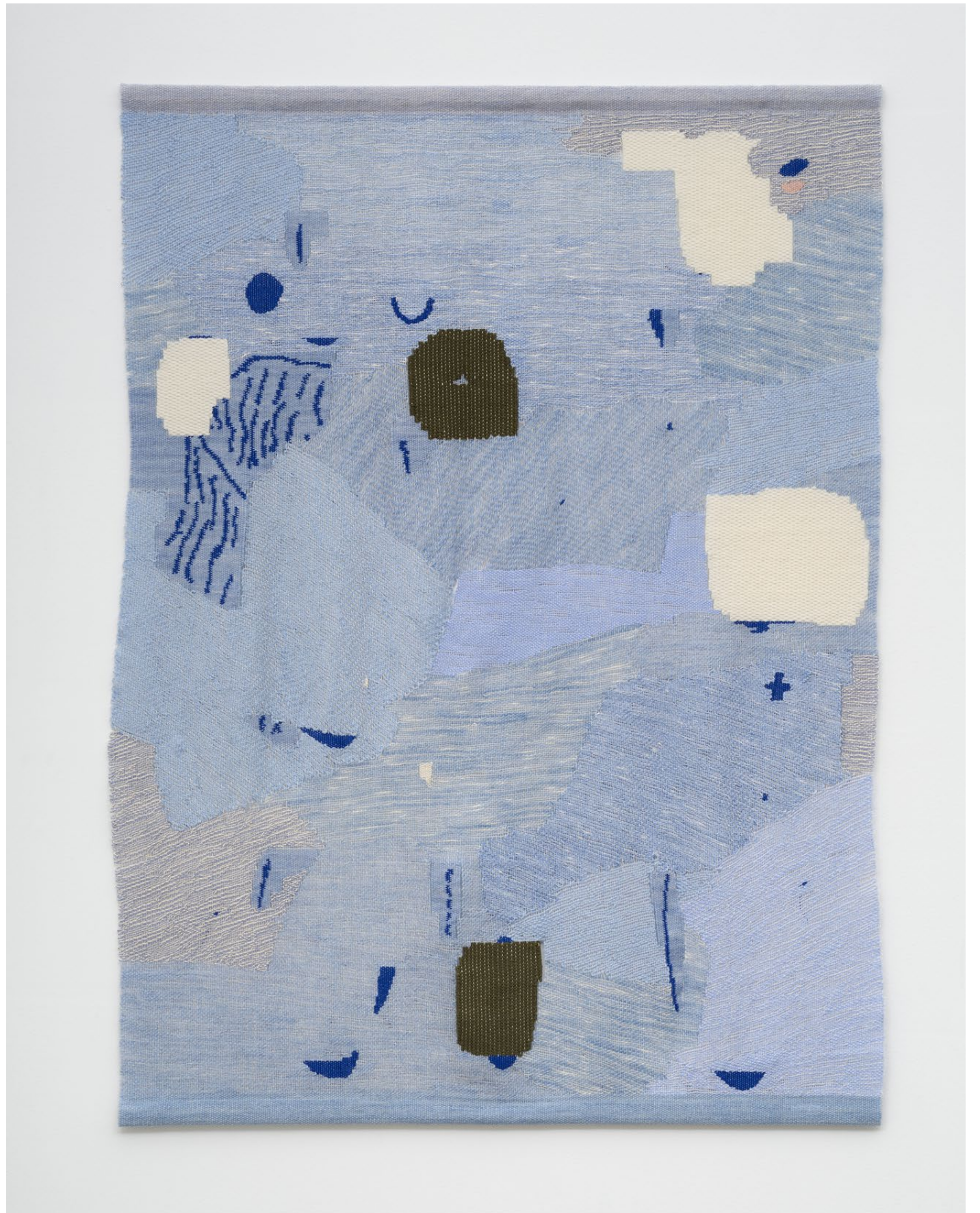
ARNA ÓTTARSDÓTTIR Reflections, 2026 wool, cotton and linen 162 x 122 cm 63 ¾ x 48 in (AO0103)