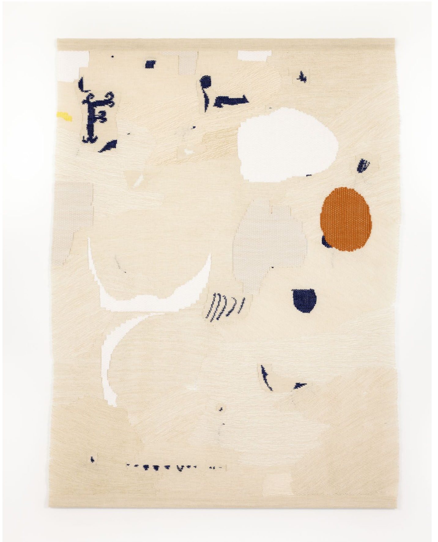
ARNA ÓTTARSDÓTTIR Possible Outcome, 2026 wool, cotton, linen 163 x 122 cm 64 ¼ x 48 in (AO0106)