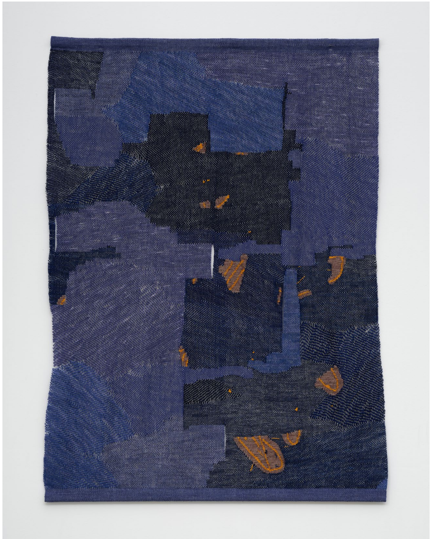
ARNA ÓTTARSDÓTTIR Reconstruction , 2026 wool, cotton and linen 160 x 120 cm 63 x 47 ¼ in (AO0101)