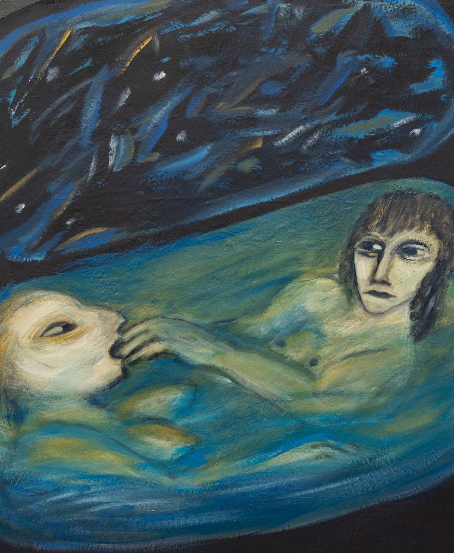
Con Bestie 1991 detail