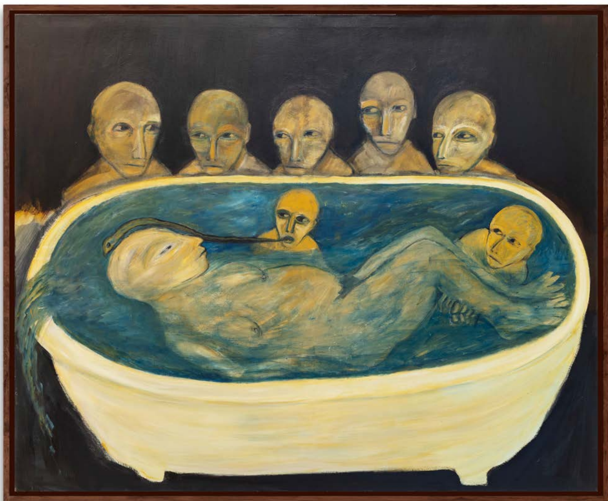
DIE WÄCHTER 1990/91 acrylic on canvas 160 x 195 cm unique