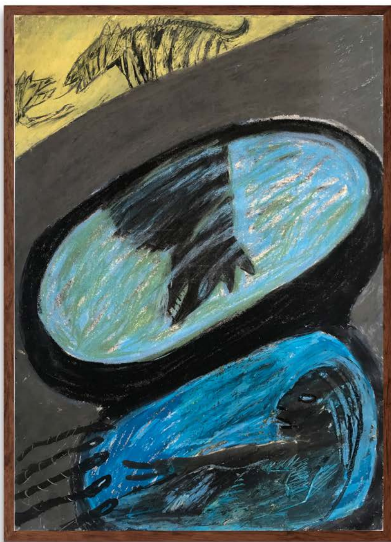
WANNENBILDER 1990/91 mixed media on paper 54 x 40 cm unique