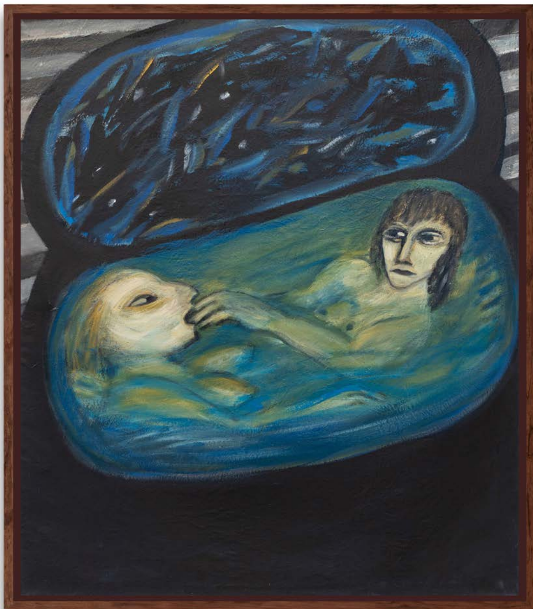
Con Bestie 1991 acrylic on canvas 110 x 95 cm unique