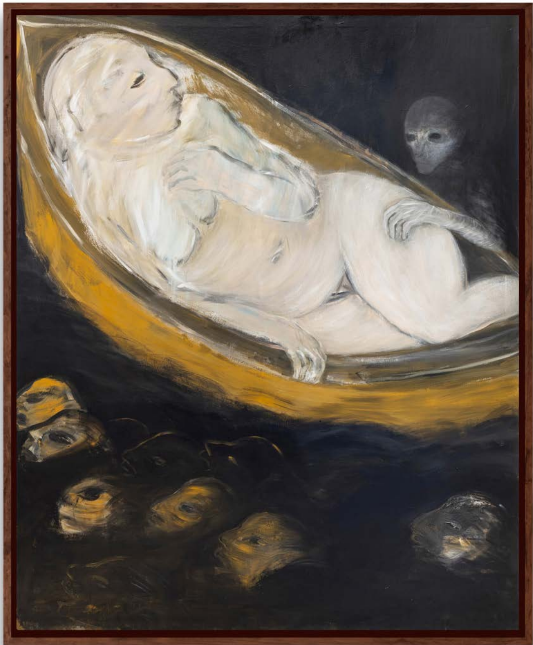
DAS BOOT 1987/88 acrylic on canvas 195 x 170 cm unique