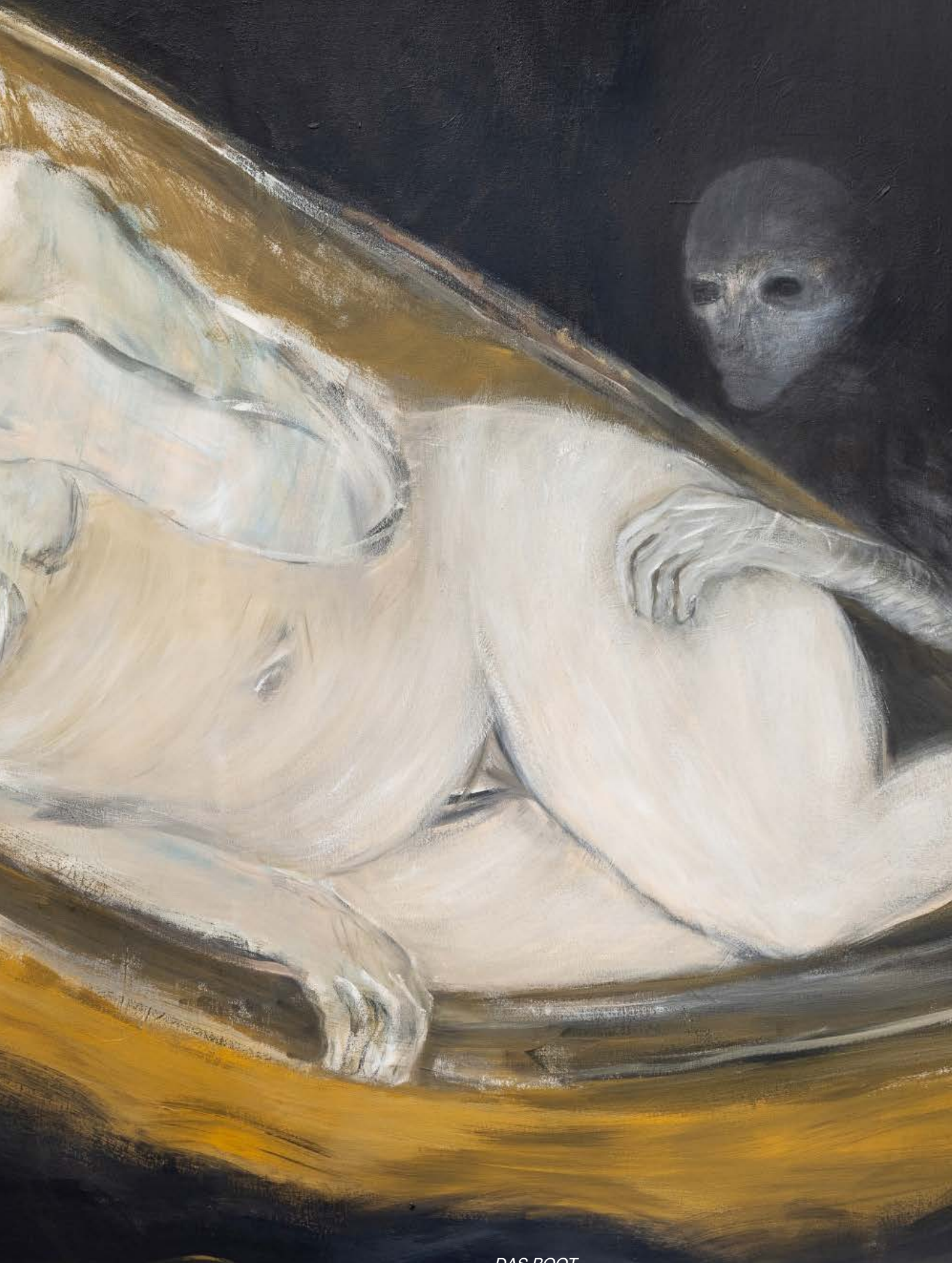
DAS BOOT 1987/88 detail