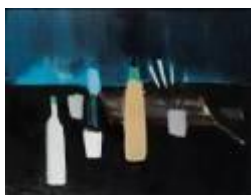
Nicolas de Staël La Table de l'Artiste , 1954 89 x 116 cm

Certain paintings are particularly worthy of note these last few years. For example: