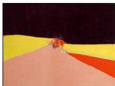
Nicolas de Staël Agrigente , 1954 60 x 81 cm