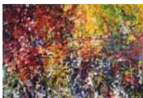
Jean-Paul Riopelle Hommage à Robert le Diable 1953, 200 x 282 cm