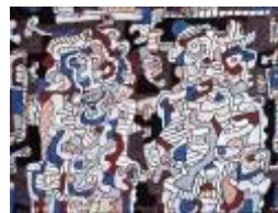
Jean Dubuffet Epoux en visite , 1964 200 x 150 cm