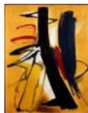
Hans Hartung T 1938-11 , 1938 102 x 80 cm