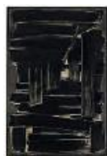
Pierre Soulages Peinture 195 x 130 cm , 1 er sept. 1957