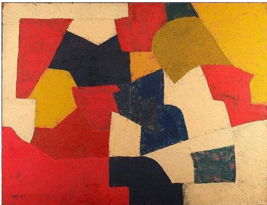
Serge POLIAKOFF (1900 - 1969) Composition abstraite, 1954 Signed and dated lower left Oil on canvas 89 x 116 cm

On the occasion of its participation in ART BASEL 2025 , which will be held from 19 to 22 June 2025 , Applicat-Prazan will be showing a selection of important paintings including works by Serge Poliakoff , Pierre Soulages , Nicolas de Staël and Zao Wou-ki .