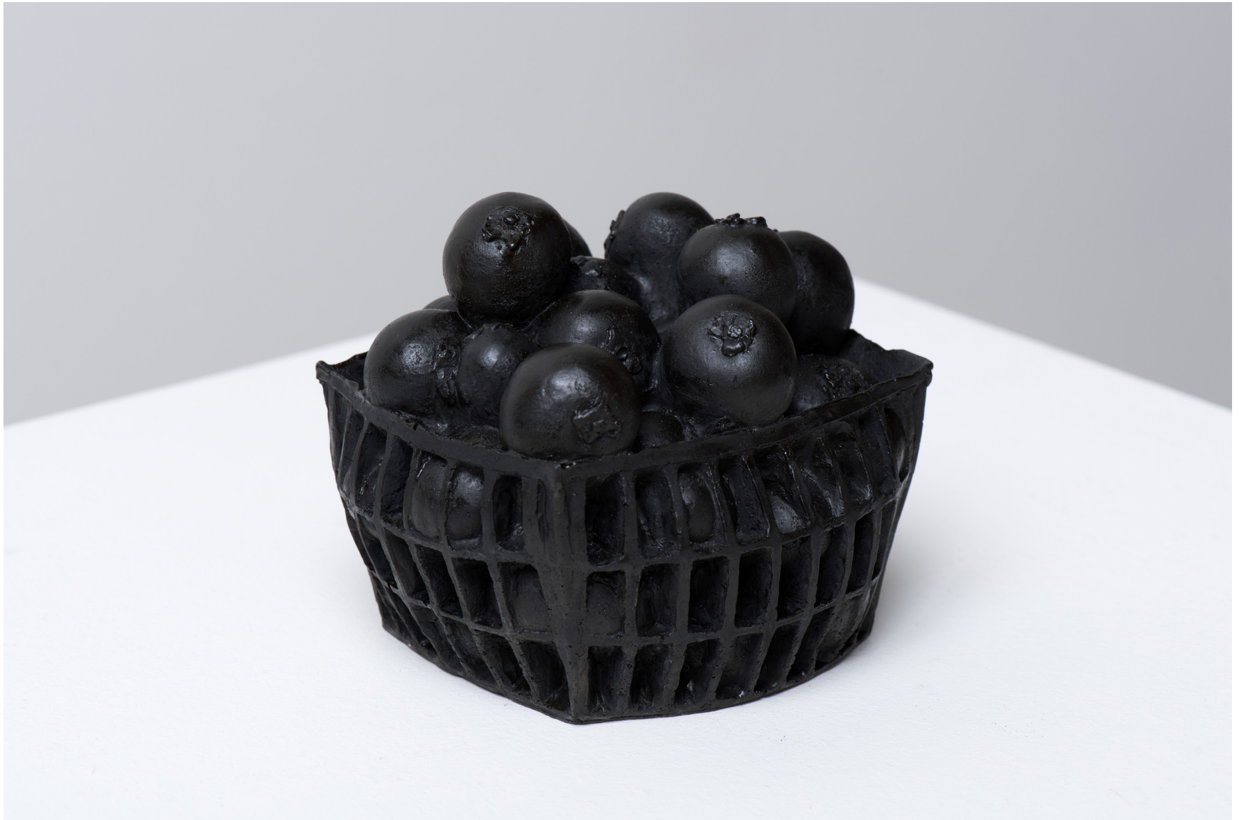
Weighted , 2018, Hydrocal and pigment, 5 x 5 x 5 1/2 inches, 12.7 x 12.7 x 14 cm, Edition 2 of 3, 1AP, ANMI-0047.2, $ 5,400.00 USD