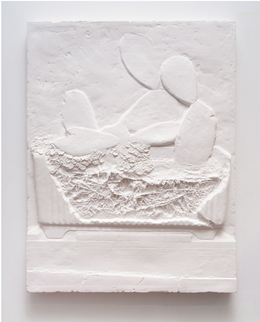
Val di Noto, 2026 Gypsum and fiberglass cloth 44 x 34 1/4 x 3 1/2 inches 111.8 x 87 x 8.9 cm Unique ANMI-0089 $ 32,000.00 USD