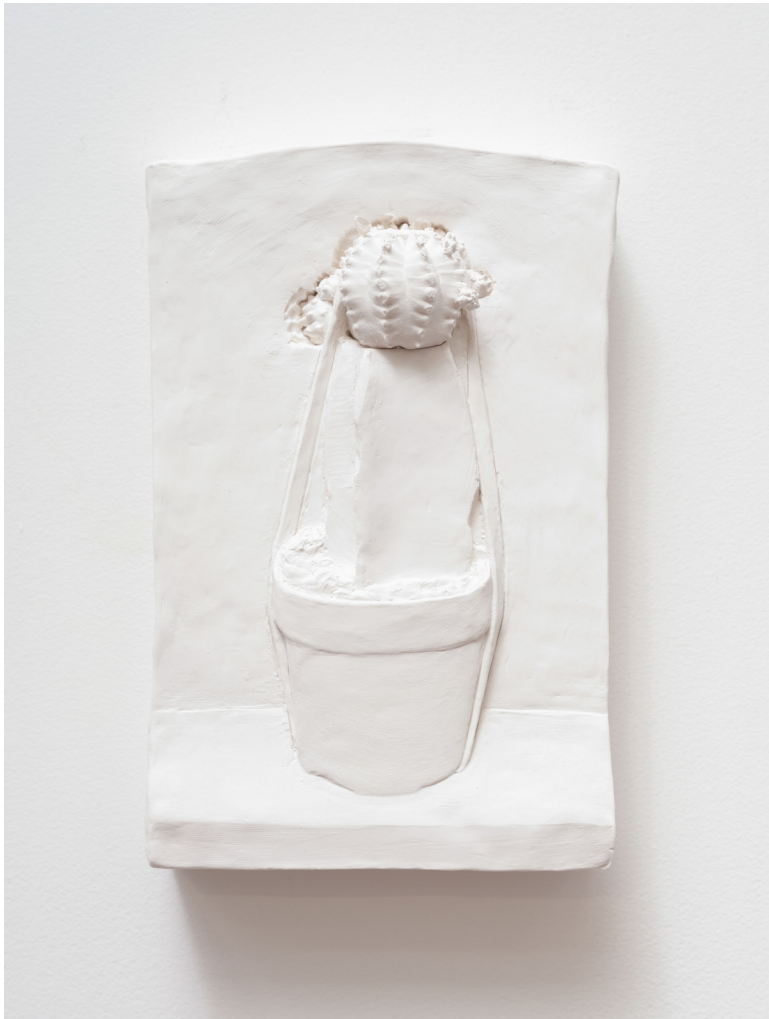
Grafted , 2026 Gypsum and fiberglass cloth 8 1/2 x 5 1/2 x 2 inches 21.6 x 14 x 5.1 cm Edition 1 of 3, 1AP ANMI-0091.1 $ 3,600.00 USD