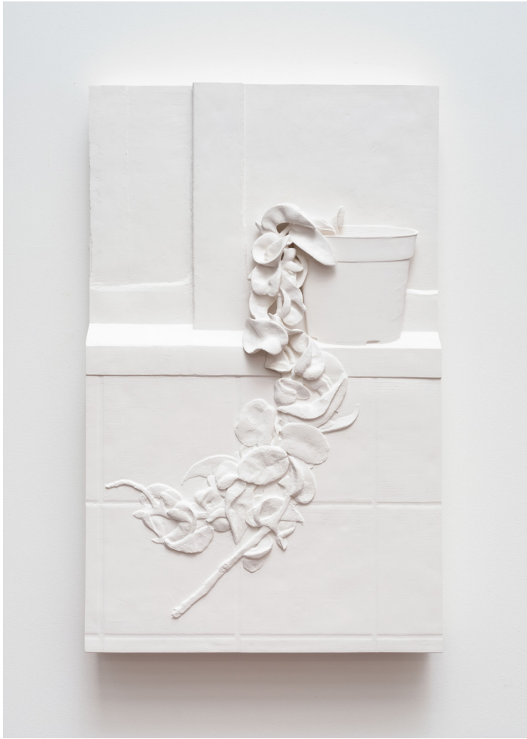
Hoya , 2026 Gypsum and fiberglass cloth 24 x 15 x 4 inches 61 x 38.1 x 10.2 cm Edition 1 of 3, 1AP ANMI-0090.1 $ 10,000.00 USD