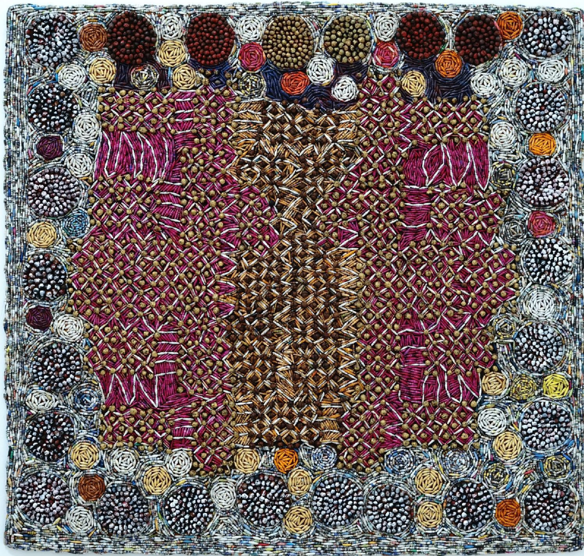
SANAA GATEJA The Queen arrives, 2023 Paper beads on barkcloth 123 x 130 cm