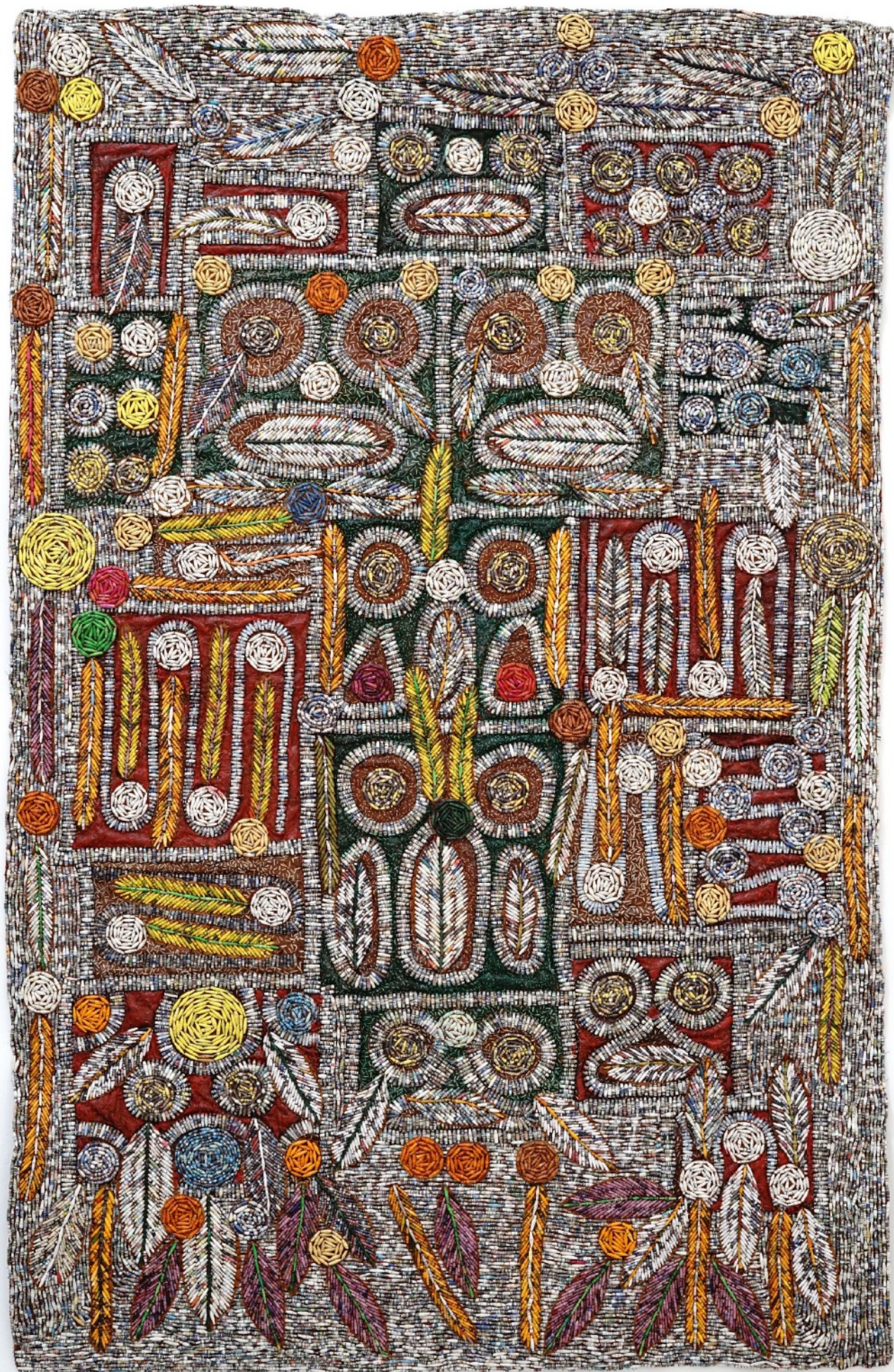
SANAA GATEJA Much to say, 2023 Paper beads on bark cloth 205 x 134 cm