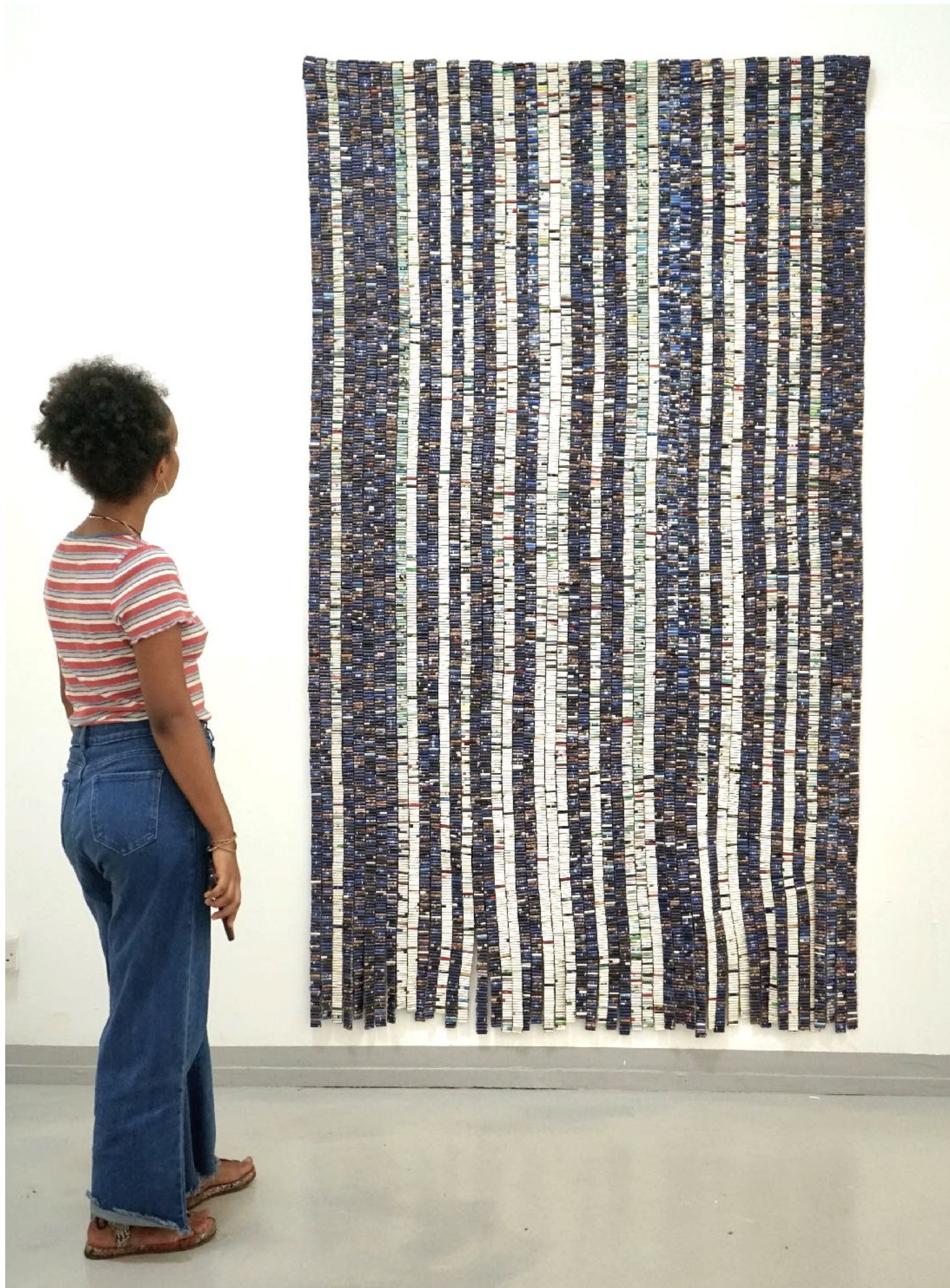
Changes III, Installation view