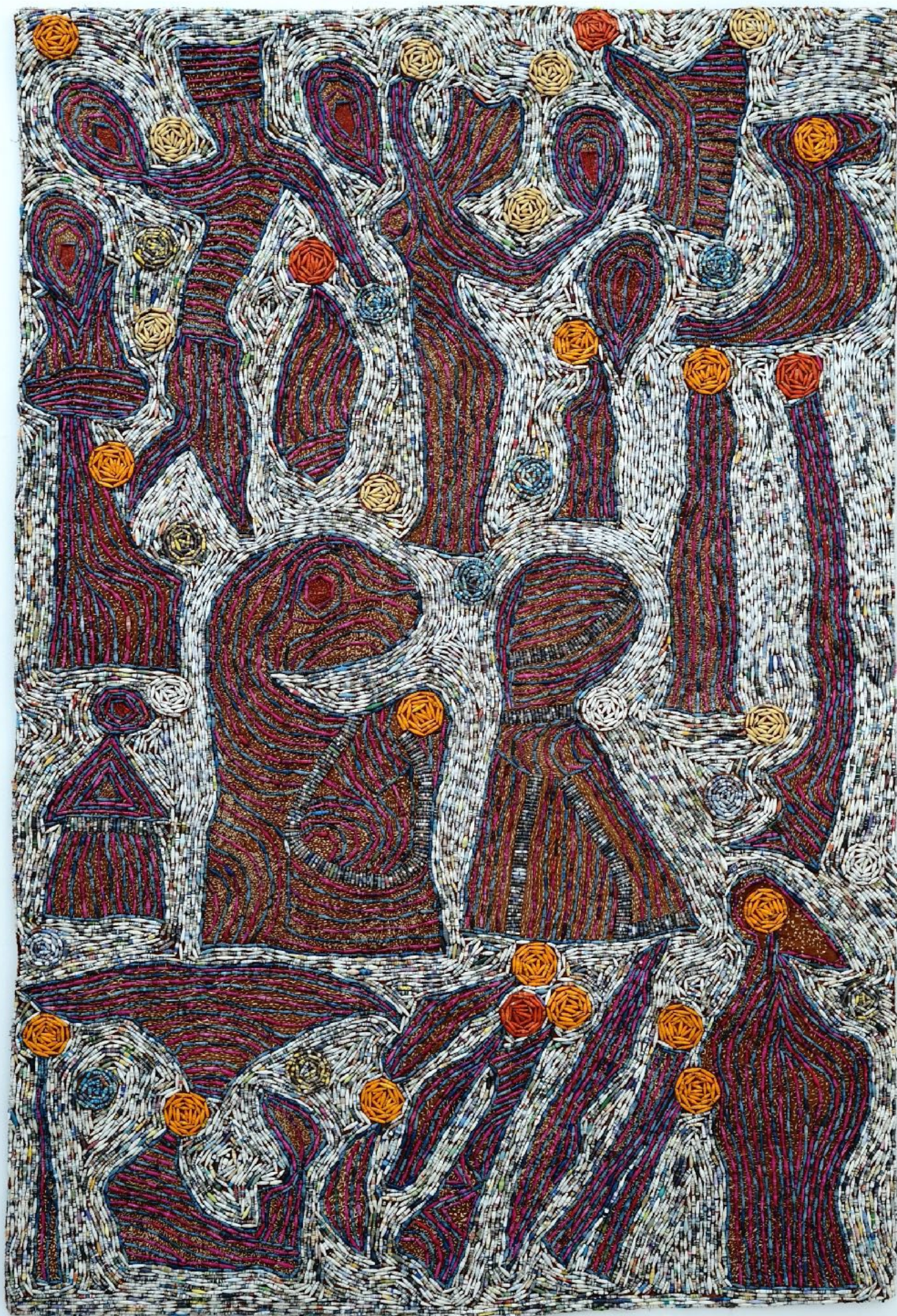
SANAA GATEJA Feeling good, 2023 Paper beads on bark cloth 185 x 127 cm