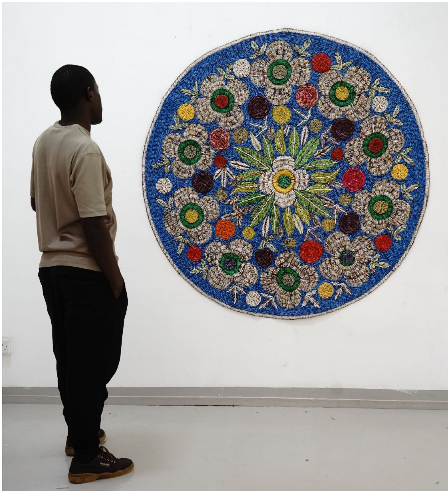
Afloat, Installation view