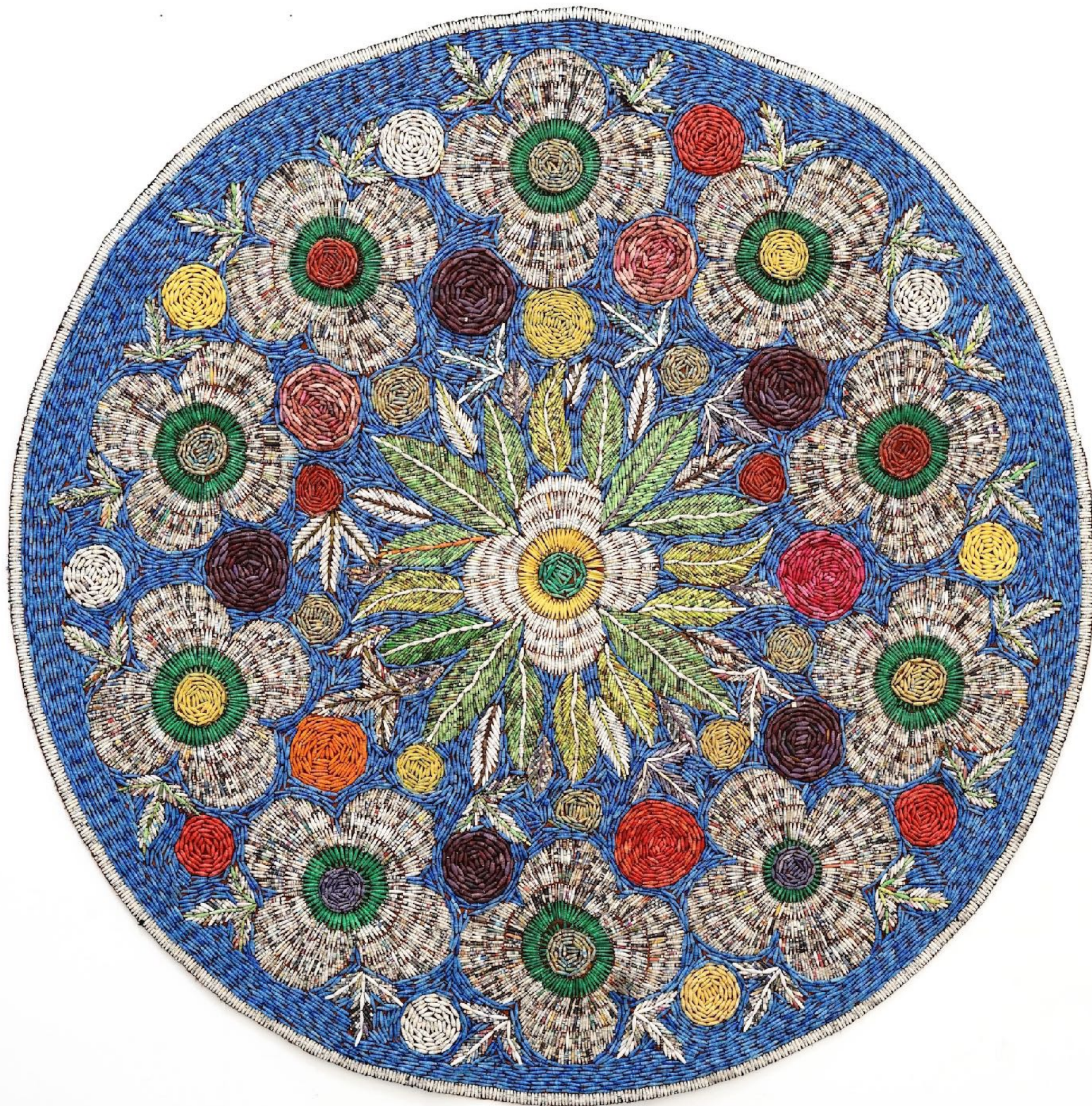
SANAA GATEJA Afloat, 2022 Paper beads on canvas 153 cm diameter