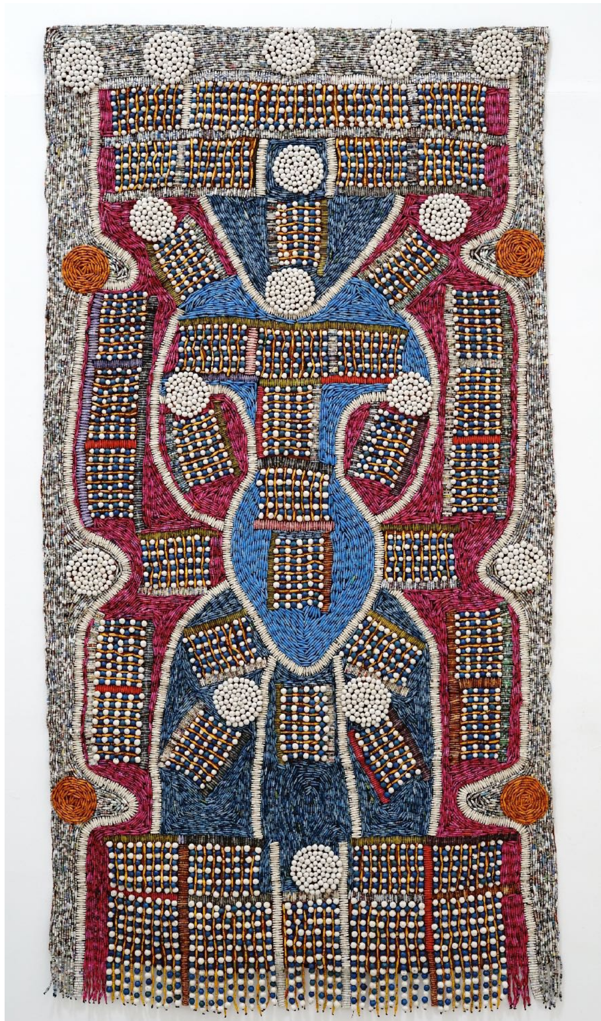
SANAA GATEJA Discovery, 2023 Paper beads on bark cloth 225 x 120 cm