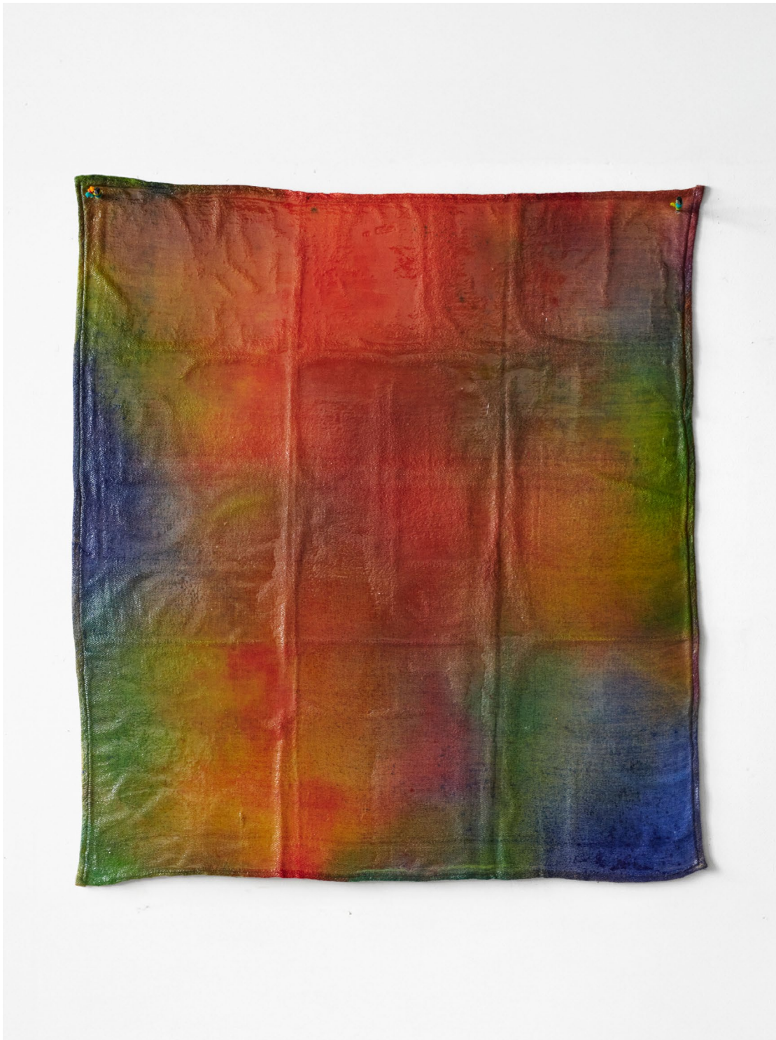
Rochelle Feinstein Static Prismatic II, 2025

Cotton drop cloth, acrylic, hand-dyed yarn on wrought iron nails and resin 41 x 46 in. $60,000