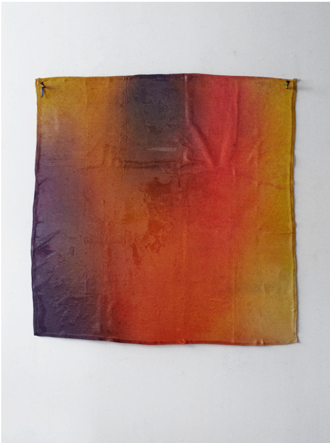
Rochelle Feinstein Static Prismatic III , 2025

Cotton drop cloth, acrylic, hand-dyed yarn on wrought iron nails and resin 45 x 46 in. $60,000