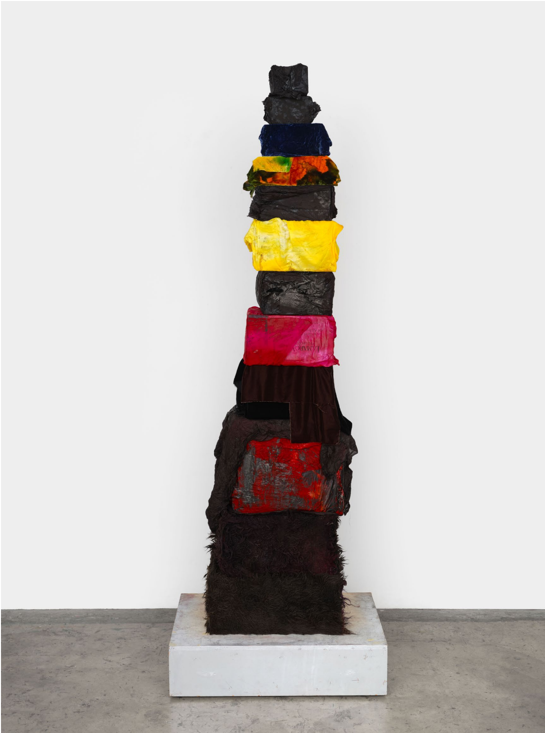
Anna Betbeze Untitled (stack) #9, 2025 Silk, velvet, wool, acid dyes, found cardboard boxes 96 x 16 x 22 in. $18,000