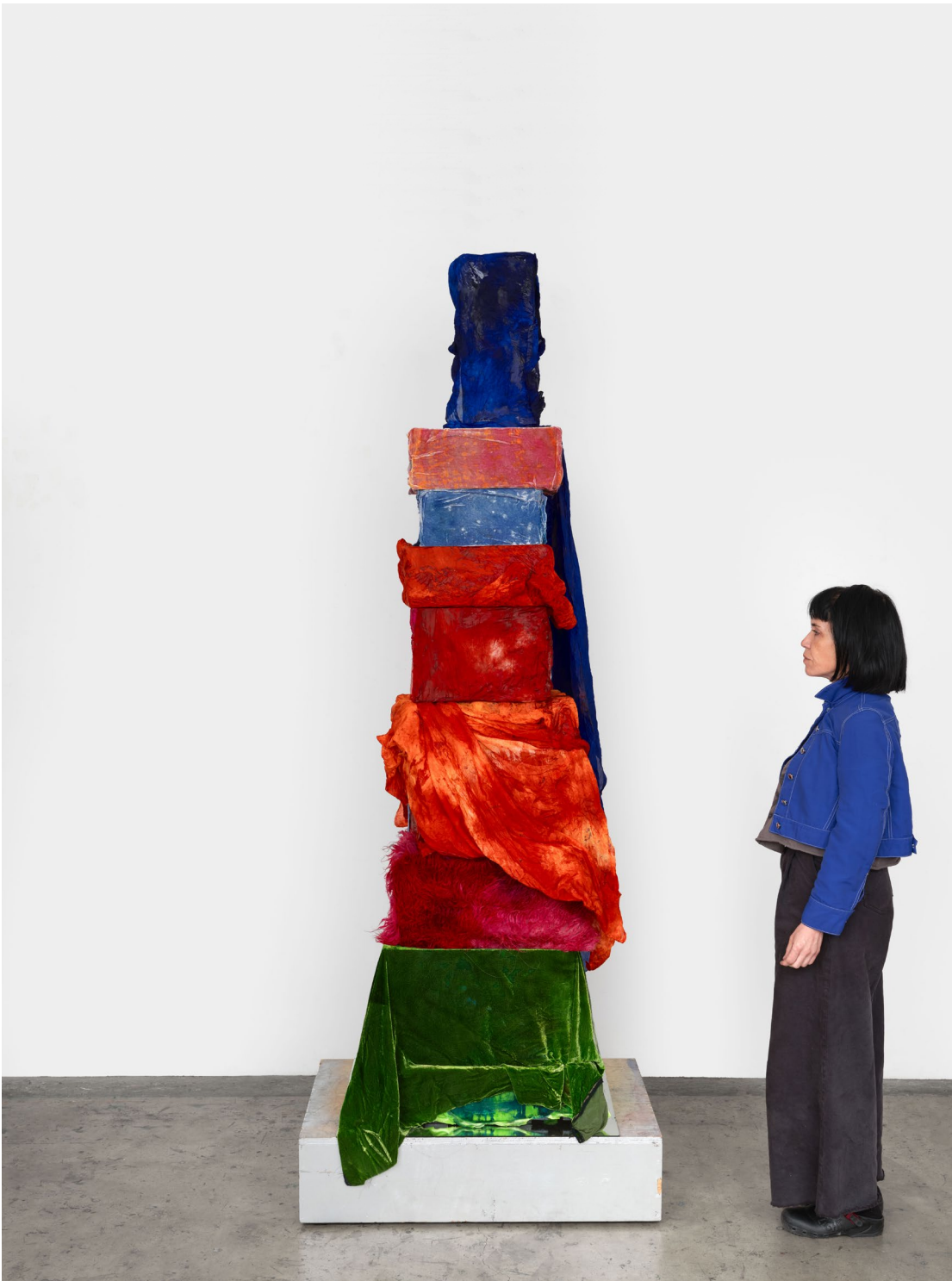
Anna Betbeze Untitled (stack) #8, 2025 Silk, velvet, acid dyes, found cardboard boxes 90 x 24 x 17 in. $16,000