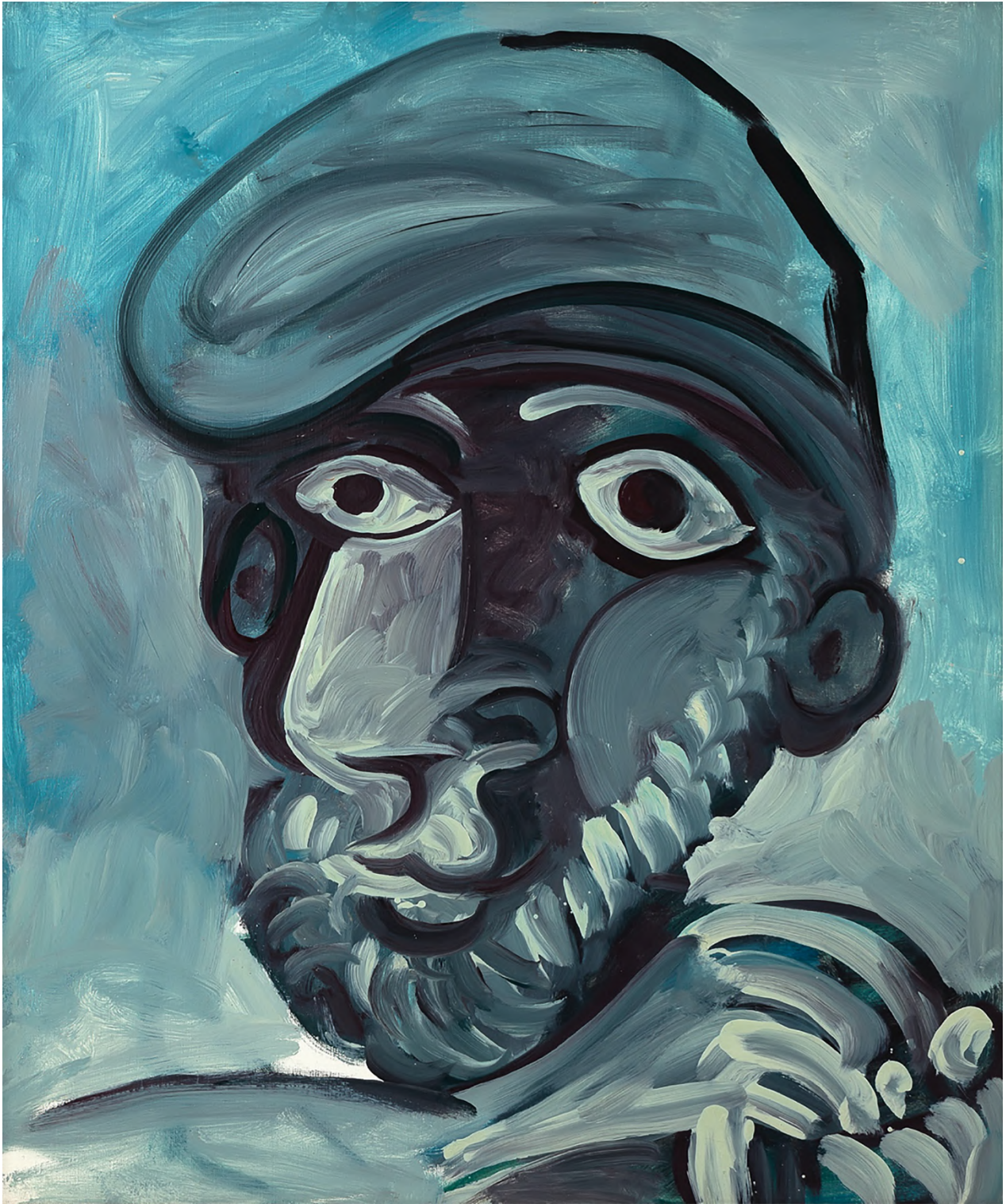
PABLO PICASSO (1881-1973) Tête d'homme au béret

Oil on canvas 81 x 65 cm. Painted on 9 July 1971