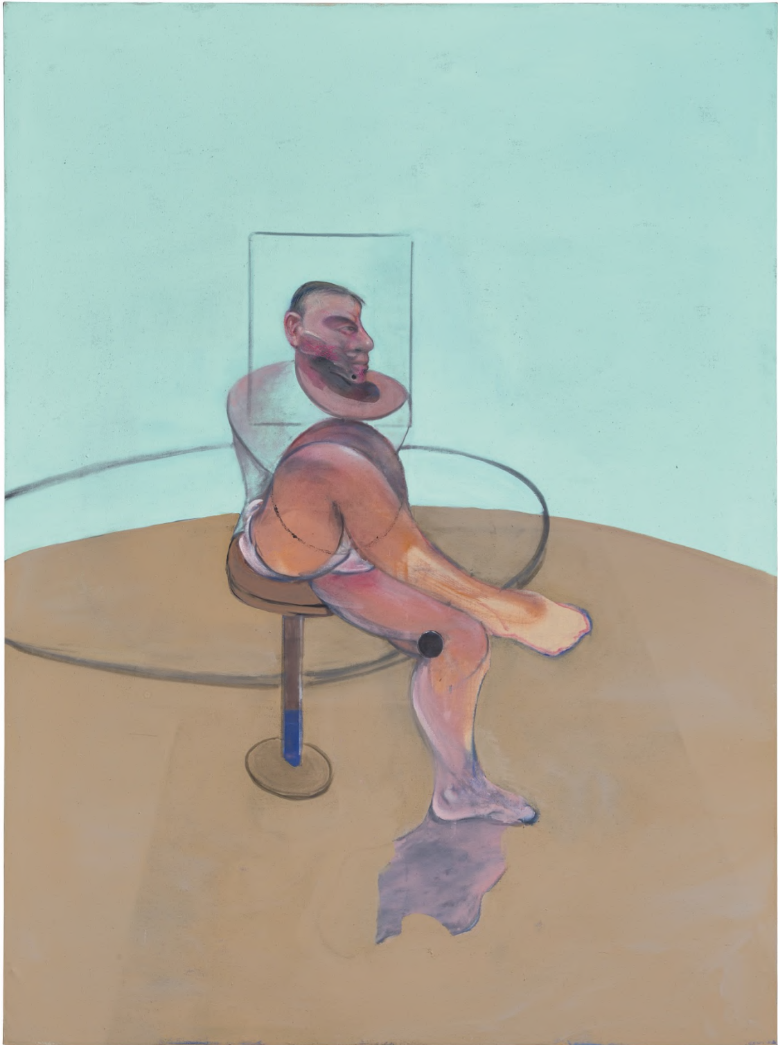
FRANCIS BACON (1909-1992) Painting 1990

Oil on canvas 198 x 147.5 cm. Painted in 1990