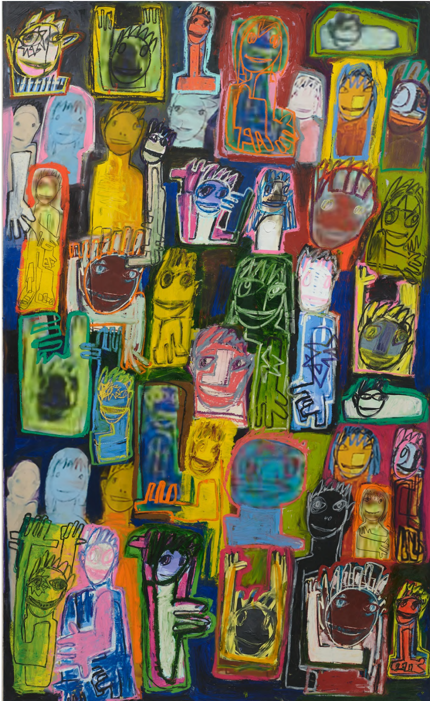
RICHARD PRINCE (1949-) Untitled

Collage, oil stick, acrylic, charcoal, gel medium and Inkjet on canvas 270.5 x 162.5 cm. Executed in 2018-19