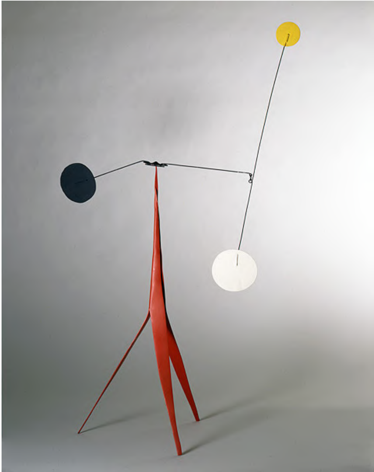
ALEXANDER CALDER (1898-1976) Frère (maquette)

Painted sheet metal and wire 104.14 x 60.96 x 33.02 cm. Executed circa 1973