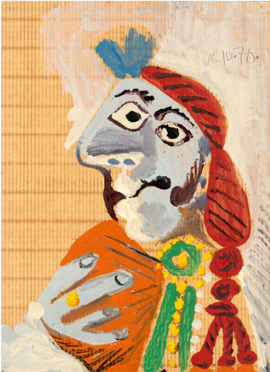
PABLO PICASSO (1881-1973) Torero

Oil on cardboard 88 x 64 cm. Executed in Mougins, 16 October 1970