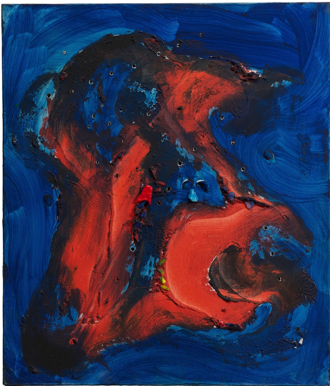
LUCIO FONTANA (1899-1968) Concetto spaziale

Oil, mixed media and glass on canvas 70 x 60 cm. Executed in 1956