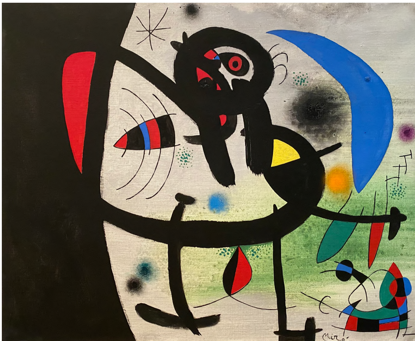
JOAN MIRÓ (1893-1983) Femme devant la lune

Oil on canvas 60 x 73 cm. Painted on 1 May 1971