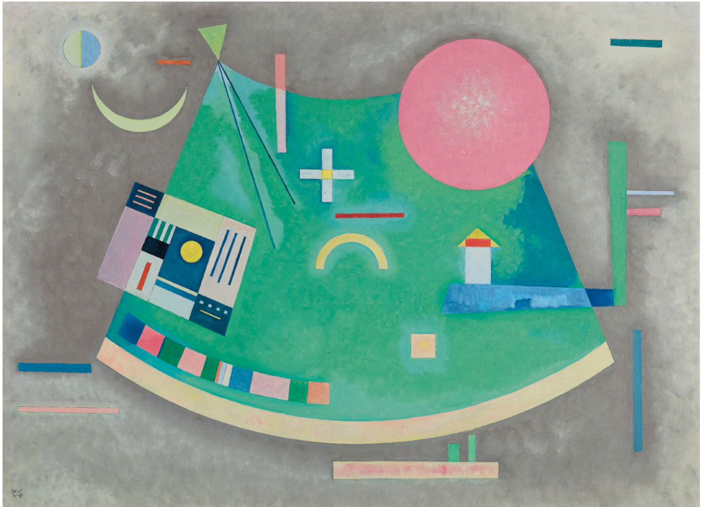
WASSILY KANDINSKY (1866-1944) Pfeil zum Kreis ( Arrow toward the circle )

Oil on canvas 80 x 110 cm. Painted in February 1930