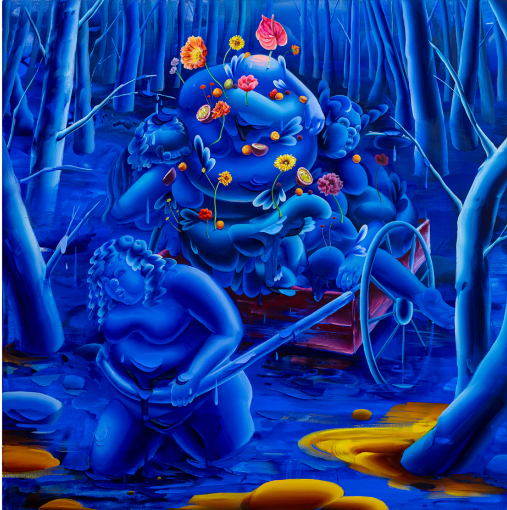
Hyegyeong Choi Toil of Cake Delivery , 2023 Acrylic on canvas 55h x 55w in 139.7h x 139.7w cm