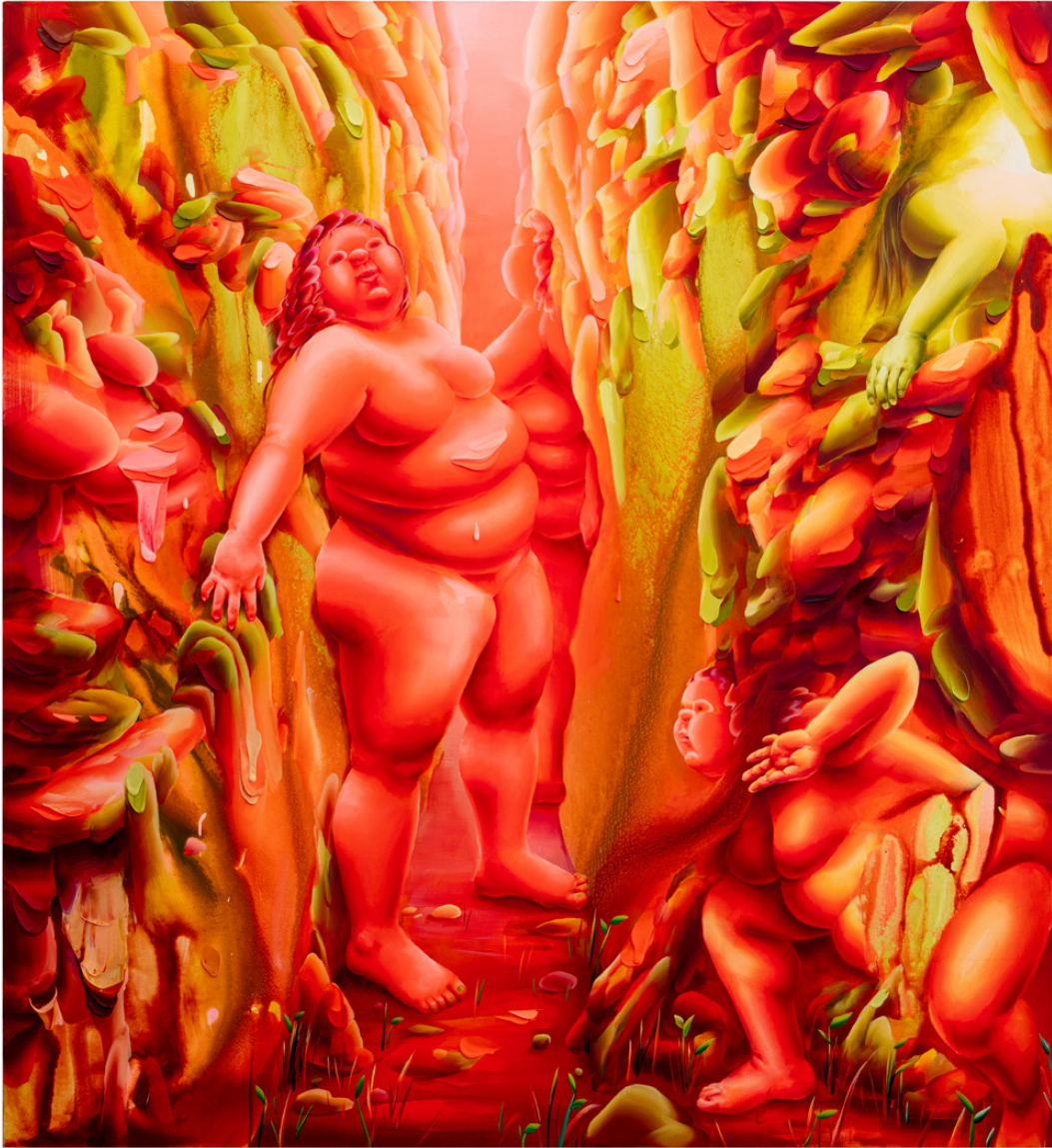
Hyegyeong Choi Crevice , 2023 Acrylic on canvas 72h x 66w in 182.8h x 167.6w cm