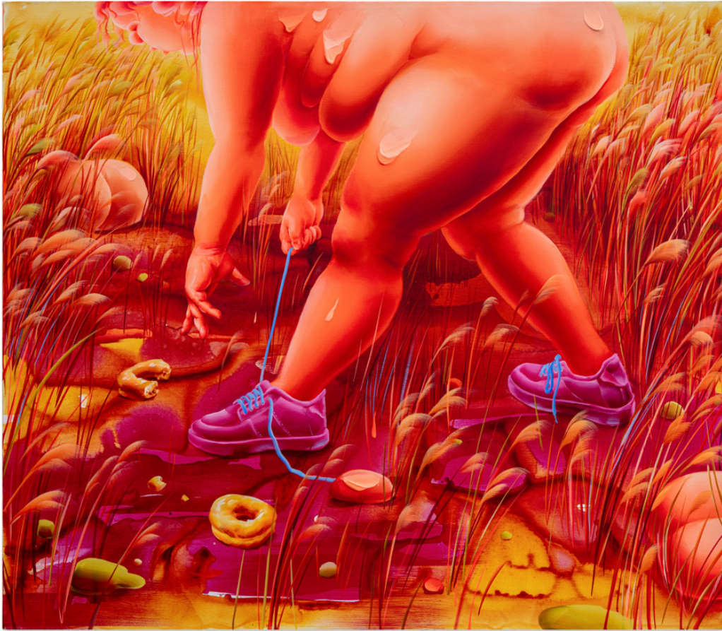
Hyegyeong Choi Priorities , 2023 Acrylic on canvas 40h x 46w in 101.6h x 116.8w cm $20,000