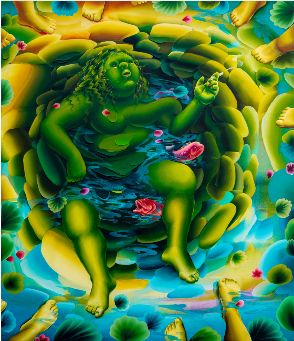
Hyegyeng Choi Public Bath , 2023 Acrylic on canvas 50h x 43w in 127h x 109.2w cm