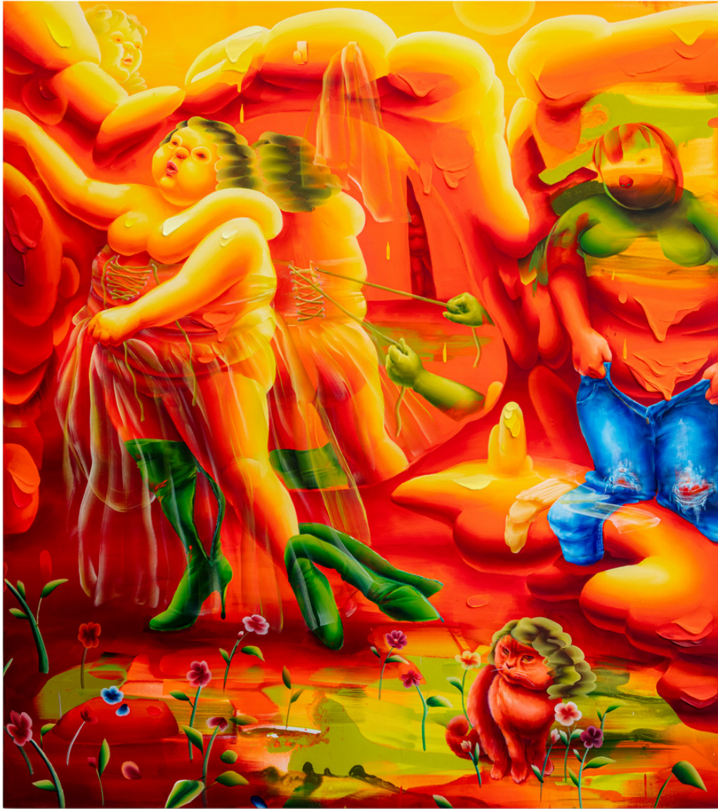
Hyegyeong Choi Struggling Fitting Room in Soho , 2023 Acrylic on canvas 72h x 64w in 182.8h x 162.6w cm