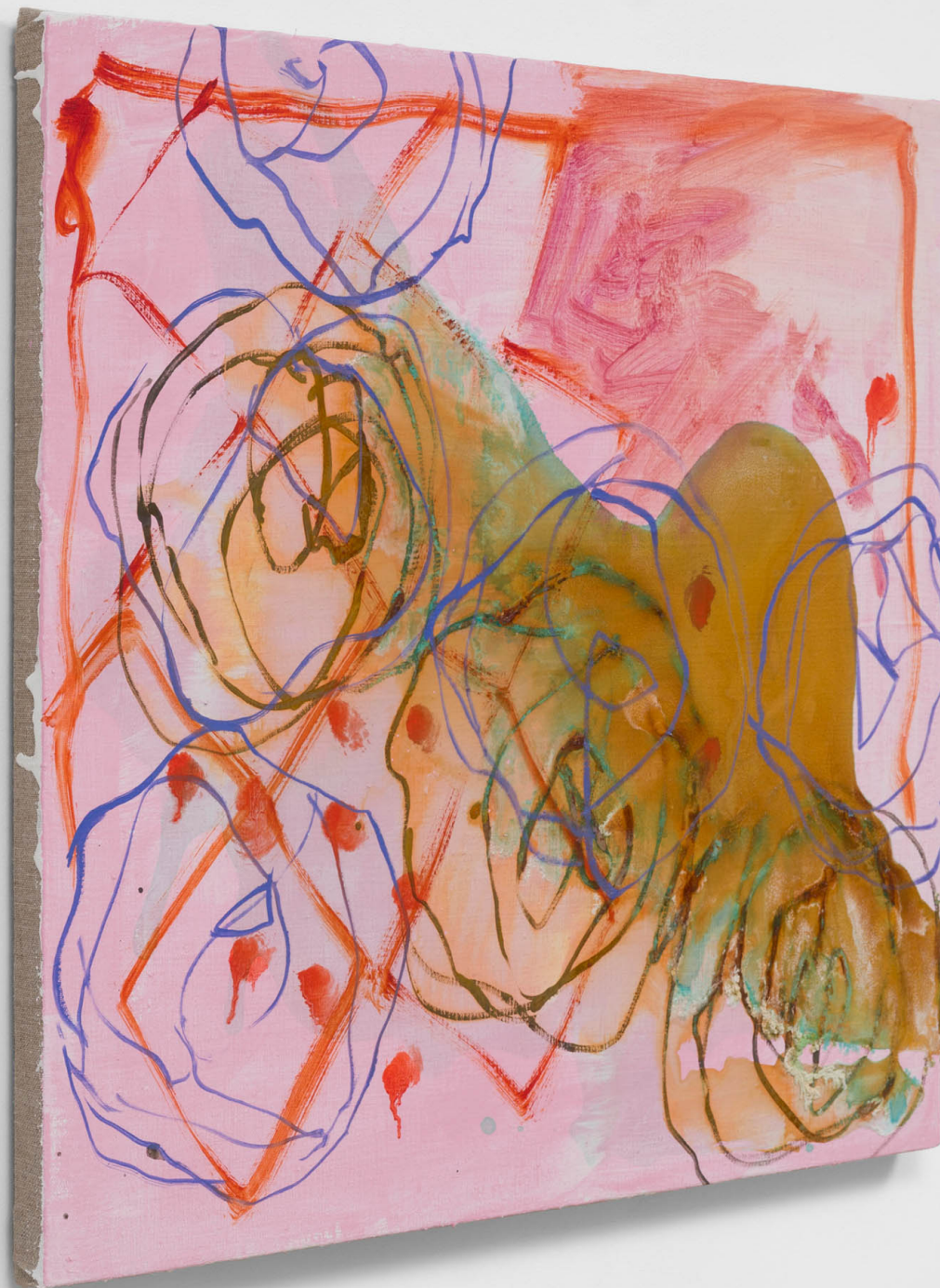
EMMA MCINTYRE Fingers bright with roses , 2023 Oil, flashe and iron oxide on linen 19 x 21 in / 48 x 53.3 cm

USD 22,000.00 exc. tax CS-01699-EM Unique