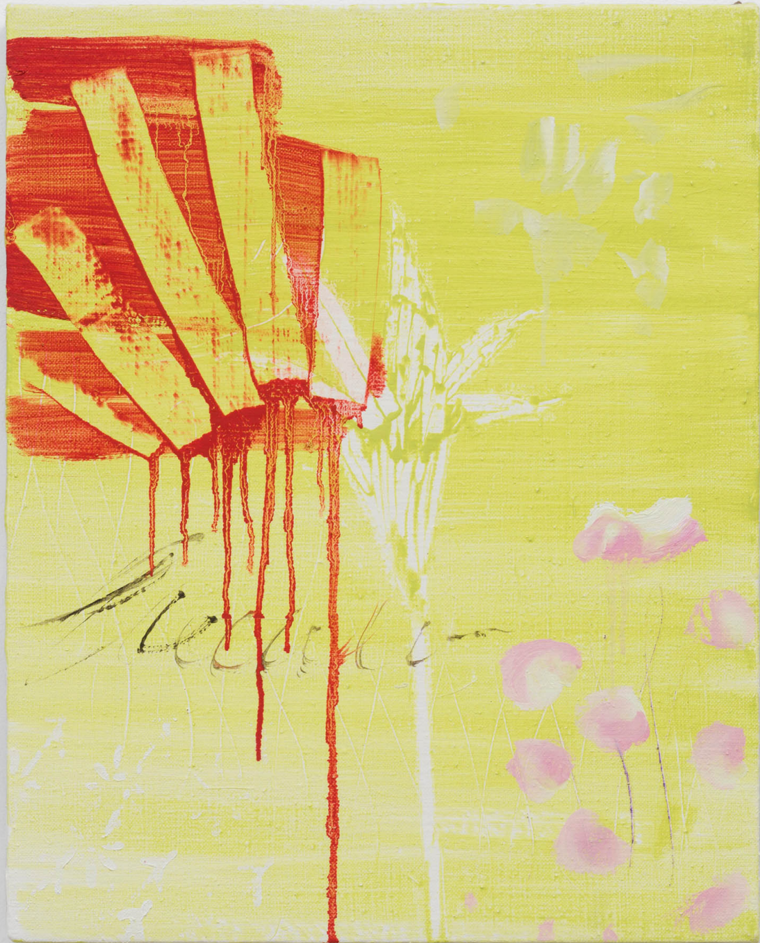
EMMA MCINTYRE Inscriptions , 2023 Oil on linen 15 x 12 in / 38.1 x 30.5 cm

USD 15,000.00 exc. tax CS-01679-EM Unique