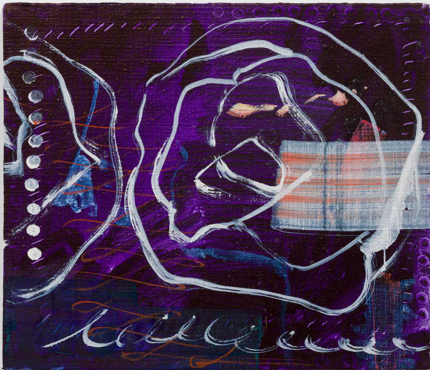
EMMA MCINTYRE Pearled , 2023 Oil on linen 12 x 14 in / 30.5 x 35.6 cm

USD 15,000.00 exc. tax CS-01698-EM Unique