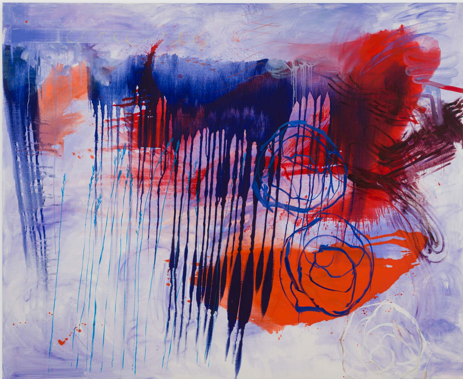
EMMA MCINTYRE Cloud-monger , 2023 Oil on linen 80 x 98 in / 203.2 x 248.9 cm

USD 75,000.00 exc. tax CS-01675-EM Unique