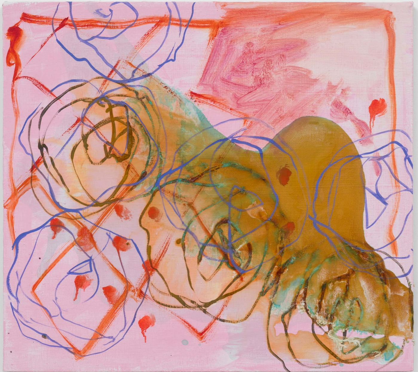
EMMA MCINTYRE Fingers bright with roses , 2023 Oil, flashe and iron oxide on linen 19 x 21 in / 48 x 53.3 cm

USD 22,000.00 exc. tax CS-01699-EM Unique