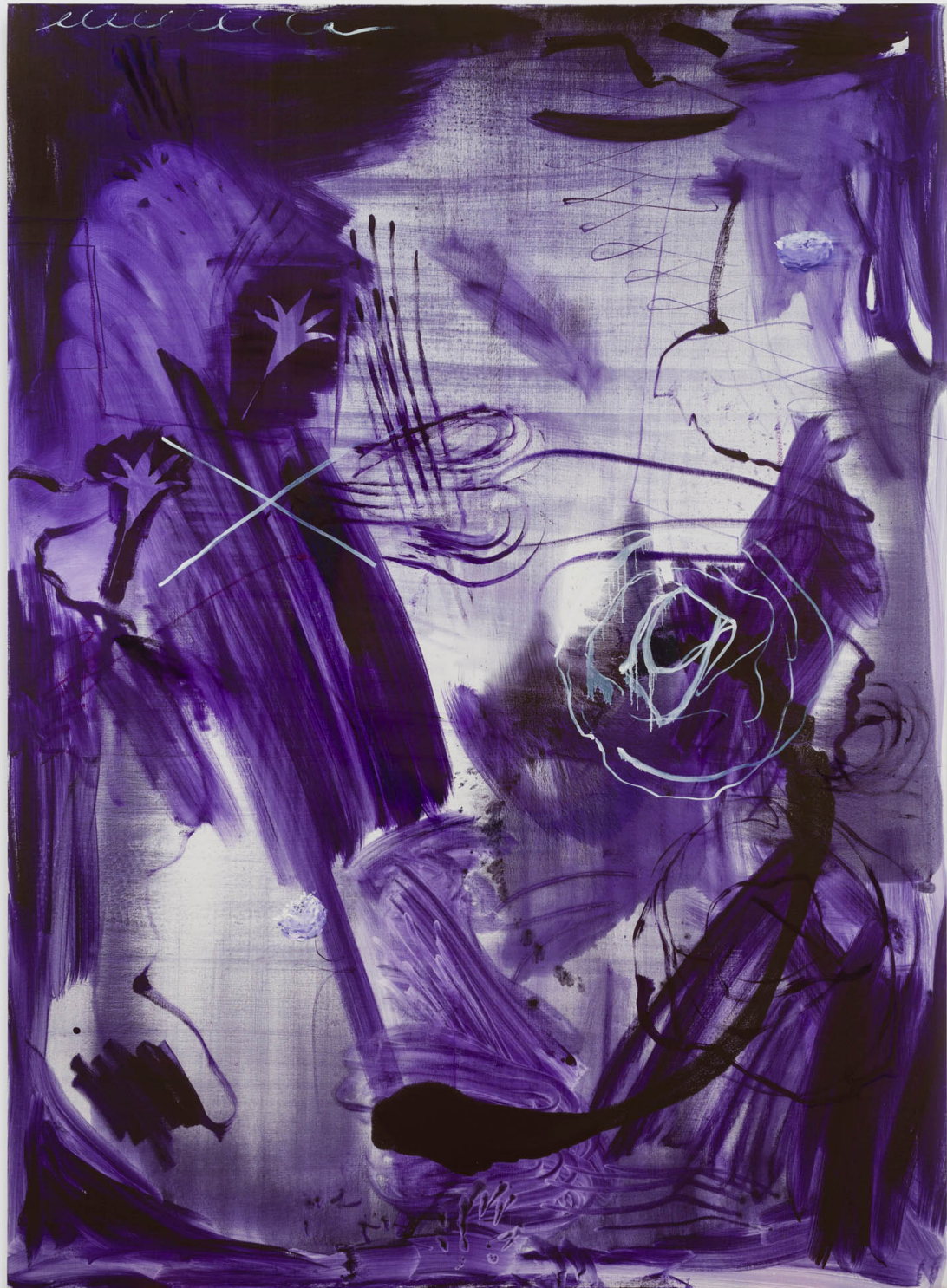
EMMA MCINTYRE Song to the Siren , 2023 Oil and oil stick on linen 86 x 63 in / 218 x 160 cm

USD 60,000.00 exc. tax CS-01676-EM Unique