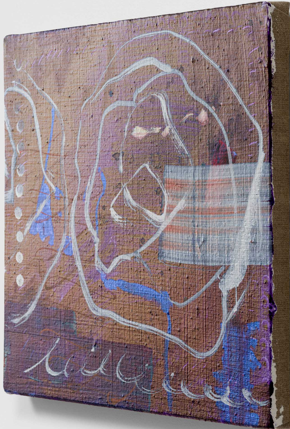
EMMA MCINTYRE Pearled , 2023 Oil on linen 12 x 14 in / 30.5 x 35.6 cm

USD 15,000.00 exc. tax CS-01699-EM Unique