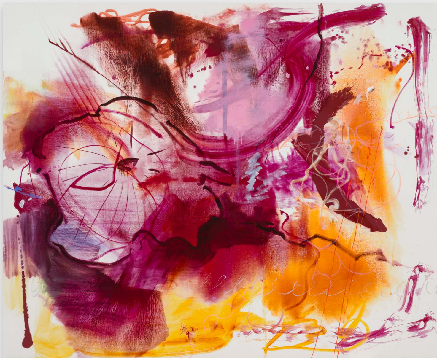
EMMA MCINTYRE A Thousand Latent Imaginations , 2023 Oil on linen 80 x 98 in / 203.2 x 248.9 cm

USD 75,000.00 exc. tax CS-01678-EM Unique