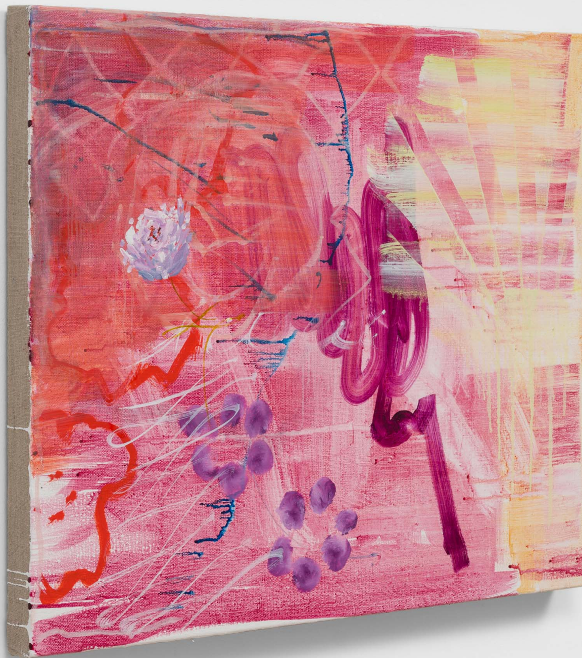
EMMA MCINTYRE Ut pictura poesis is her name , 2023 Oil and resin on linen 22 x 26 in / 50.8 x 66 cm

USD 27,000.00 exc. tax CS-01680-EM Unique