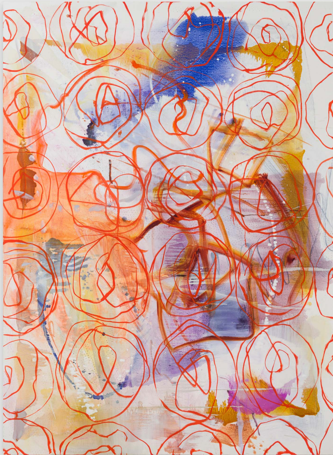
EMMA MCINTYRE Marble eyes , 2023 Oil and ink on linen 86 x 63 in / 218 x 160 cm

USD 60,000.00 exc. tax CS-01677-EM Unique