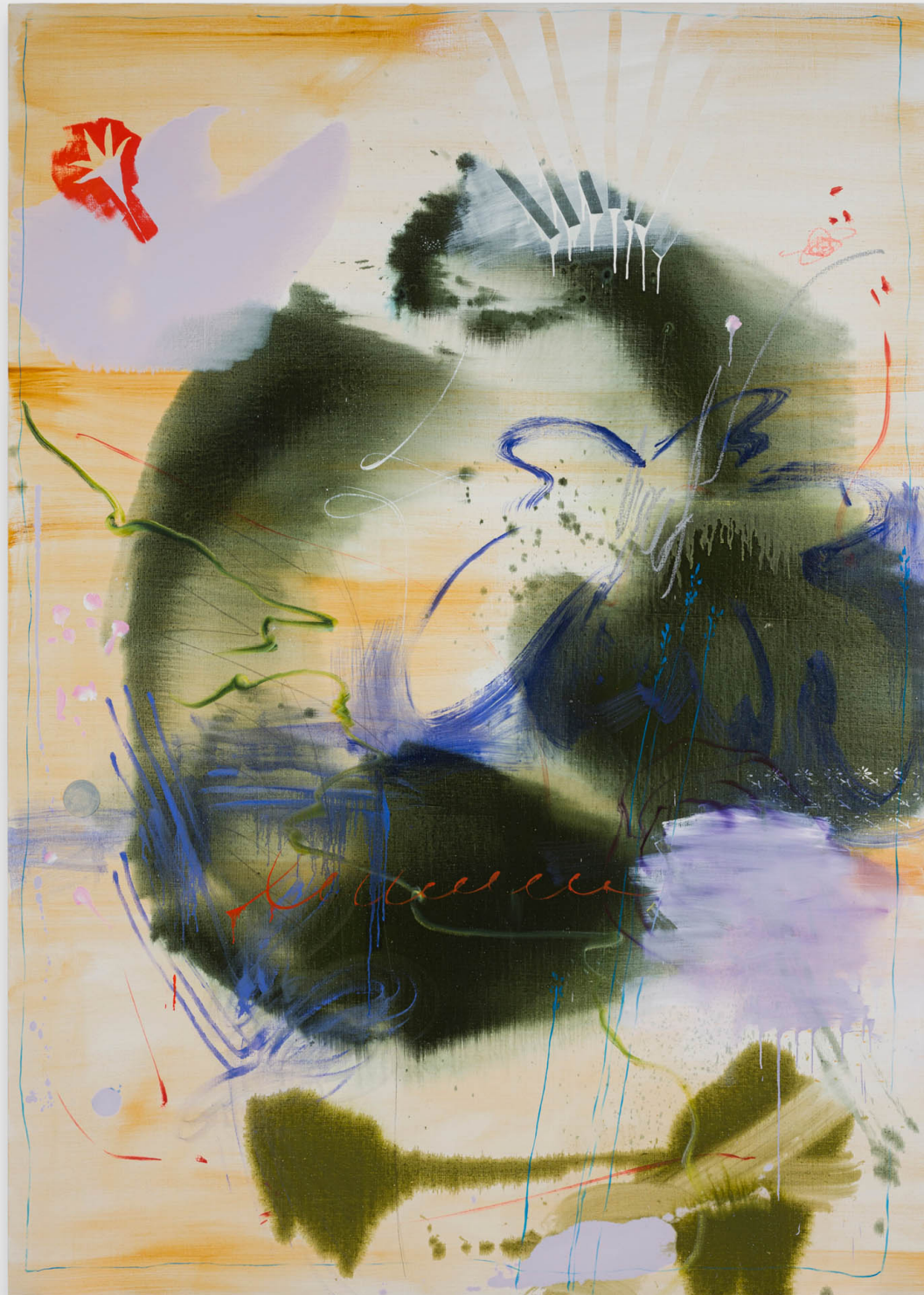
EMMA MCINTYRE Ariel's song , 2023 Oil, oil stick and graphite on linen 98 x 70 in / 228.6 x 177.8 cm

USD 75,000.00 exc. tax CS-01674-EM Unique