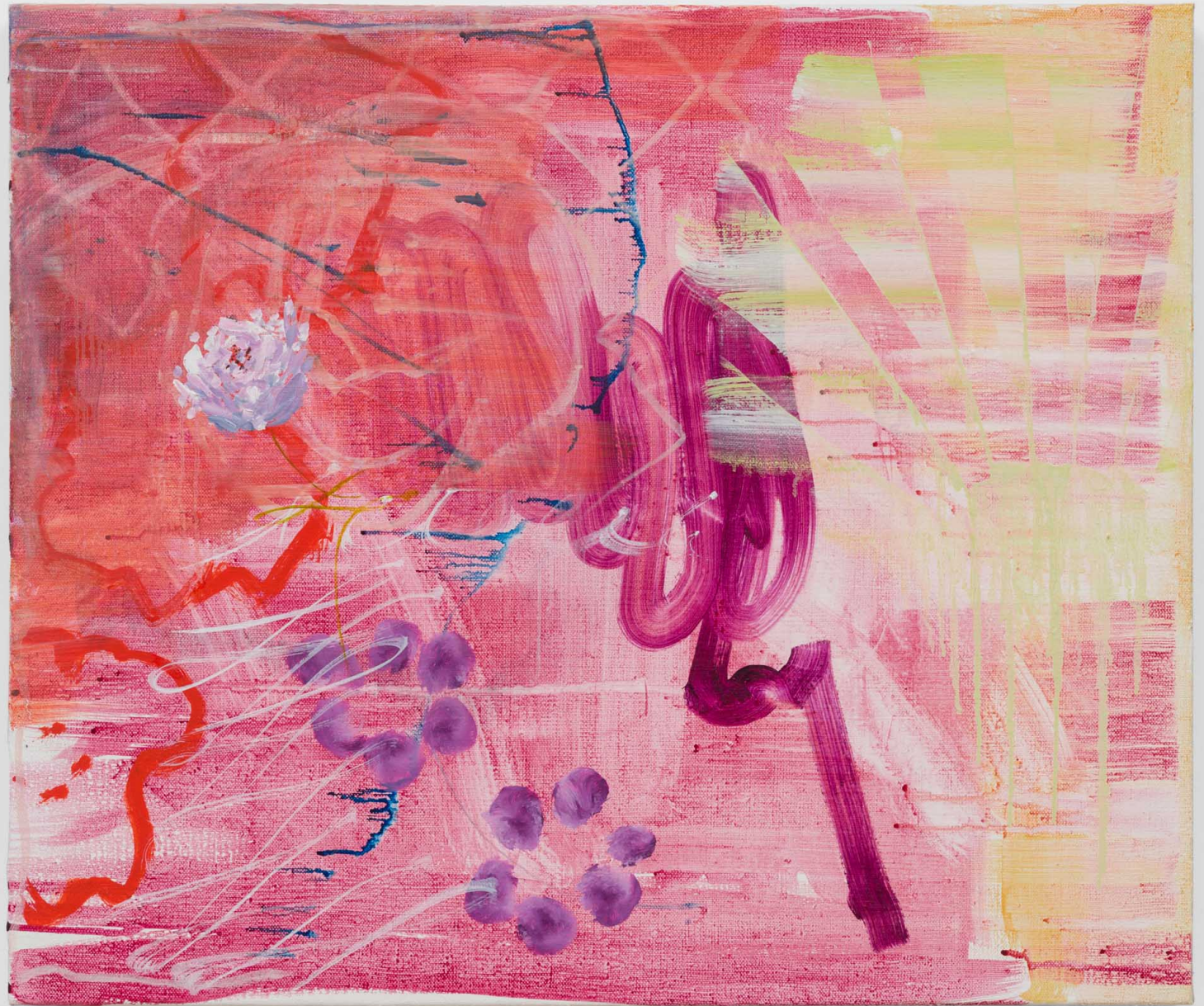
EMMA MCINTYRE Ut pictura poesis is her name , 2023 Oil and resin on linen 22 x 26 in / 50.8 x 66 cm

USD 27,000.00 exc. tax CS-01680-EM Unique