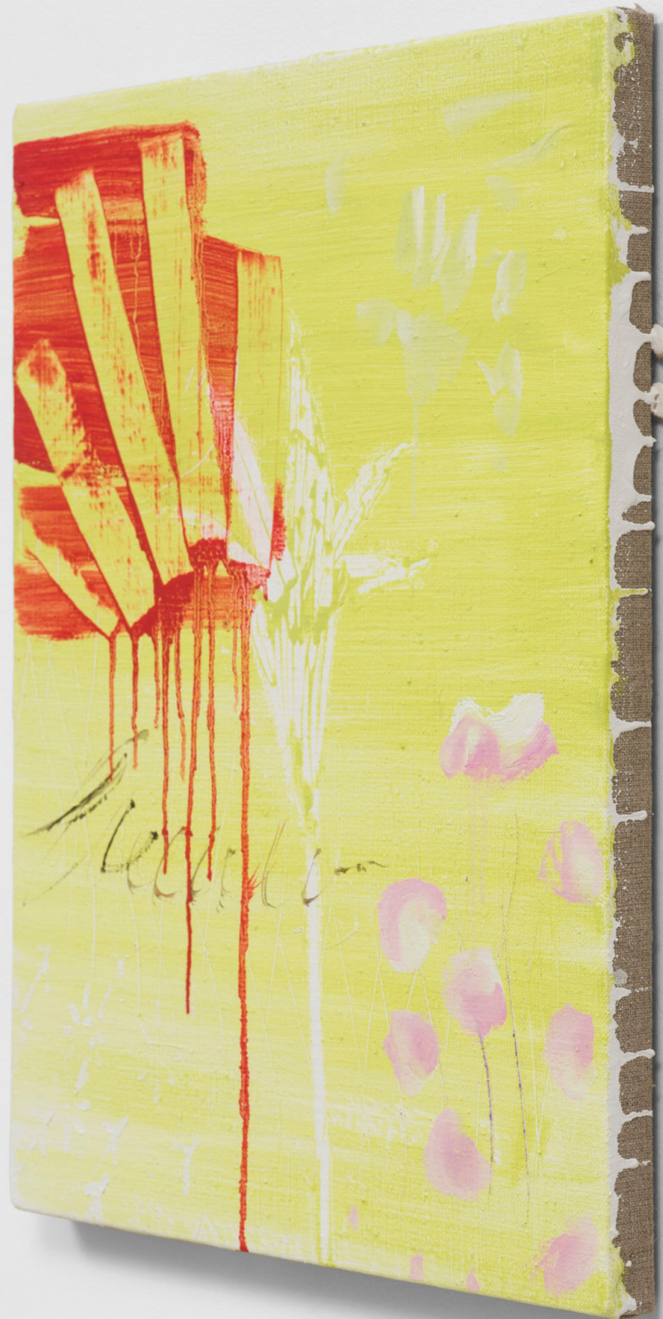
EMMA MCINTYRE Inscriptions , 2023 Oil on linen 15 x 12 in / 38.1 x 30.5 cm

USD 15,000.00 exc. tax CS-01679-EM Unique