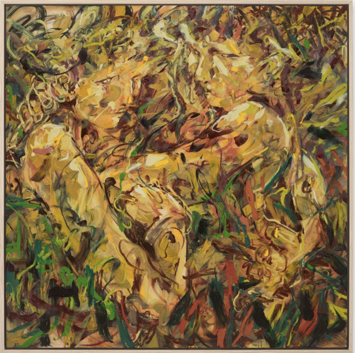
Julia Jo Double Take , 2025 Oil, oil pastel, and oil stick on linen 80 x 80 inches (203.2 x 203.2 cm) Framed: 81 1/2 x 81 1/2 inches (207.01 x 207.01 cm)