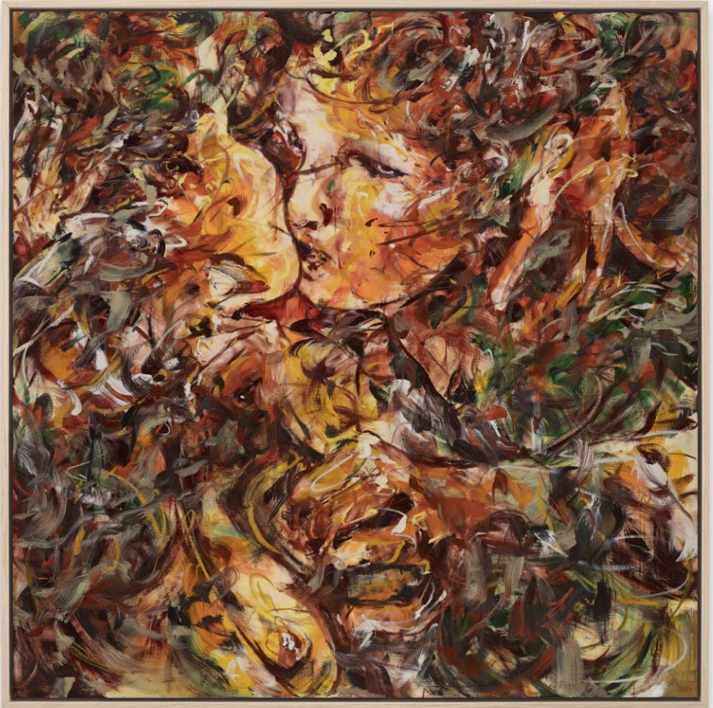
Julia Jo Catching Fire , 2025 Oil, oil pastel, and oil stick on linen 70 x 70 inches (177.8 x 177.8 cm) Framed: 71 1/2 x 71 1/2 inches (181.6 x 181.6 cm)