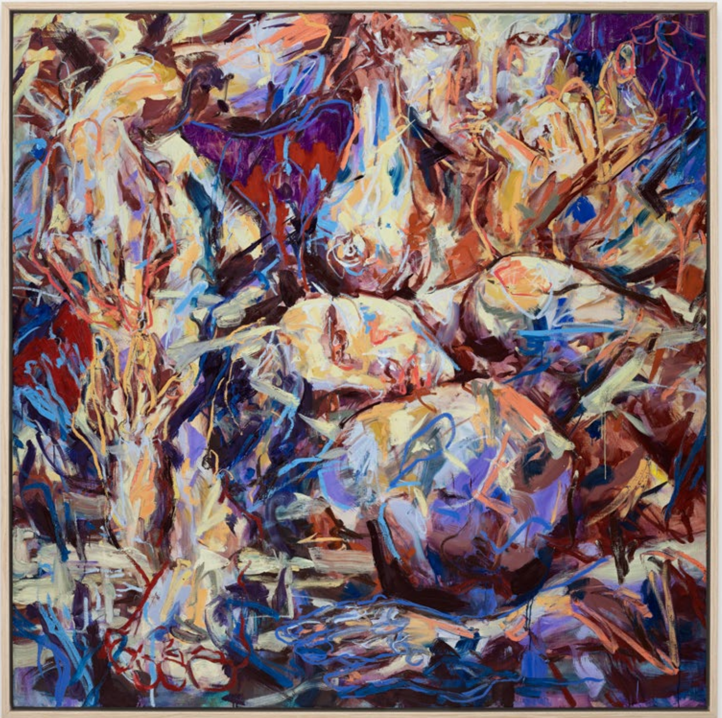
Julia Jo Down on One Knee , 2025 Oil, oil pastel, and oil stick on linen 80 x 80 inches (203.2 x 203.2 cm) Framed: 81.5 x 81.5 inches (207.01 x 207.01 cm)