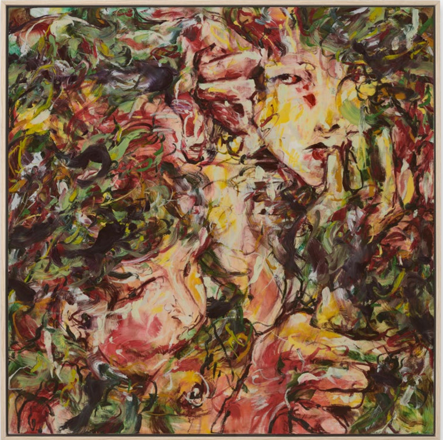
Julia Jo Honor Bound , 2025 Oil, oil pastel, and oil stick on linen 60 x 60 inches (152.4 x 152.4 cm) Framed: 61 1/2 x 61 1/2 inches (156.21 x 156.21 cm) $35,000.000