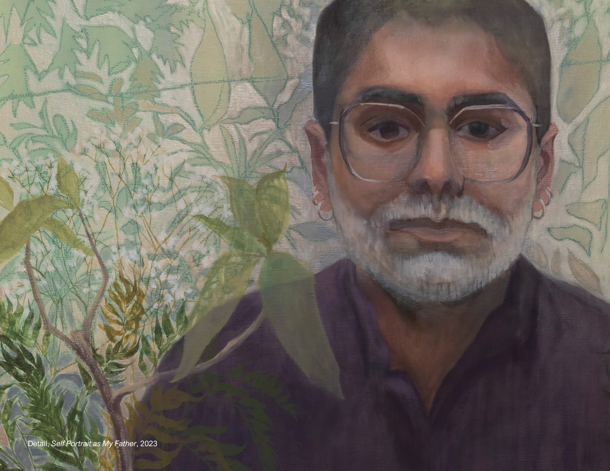
Detail, Self Portrait as My Father , 2023