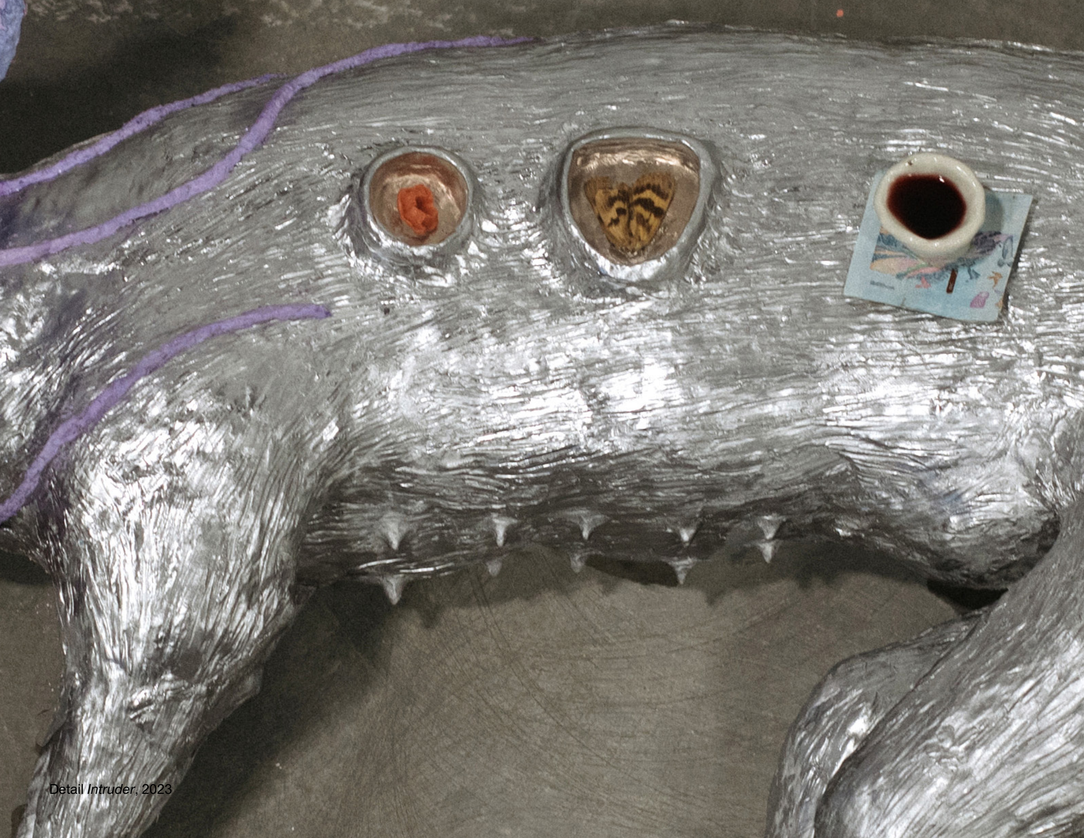
Detail Intruder , 2023