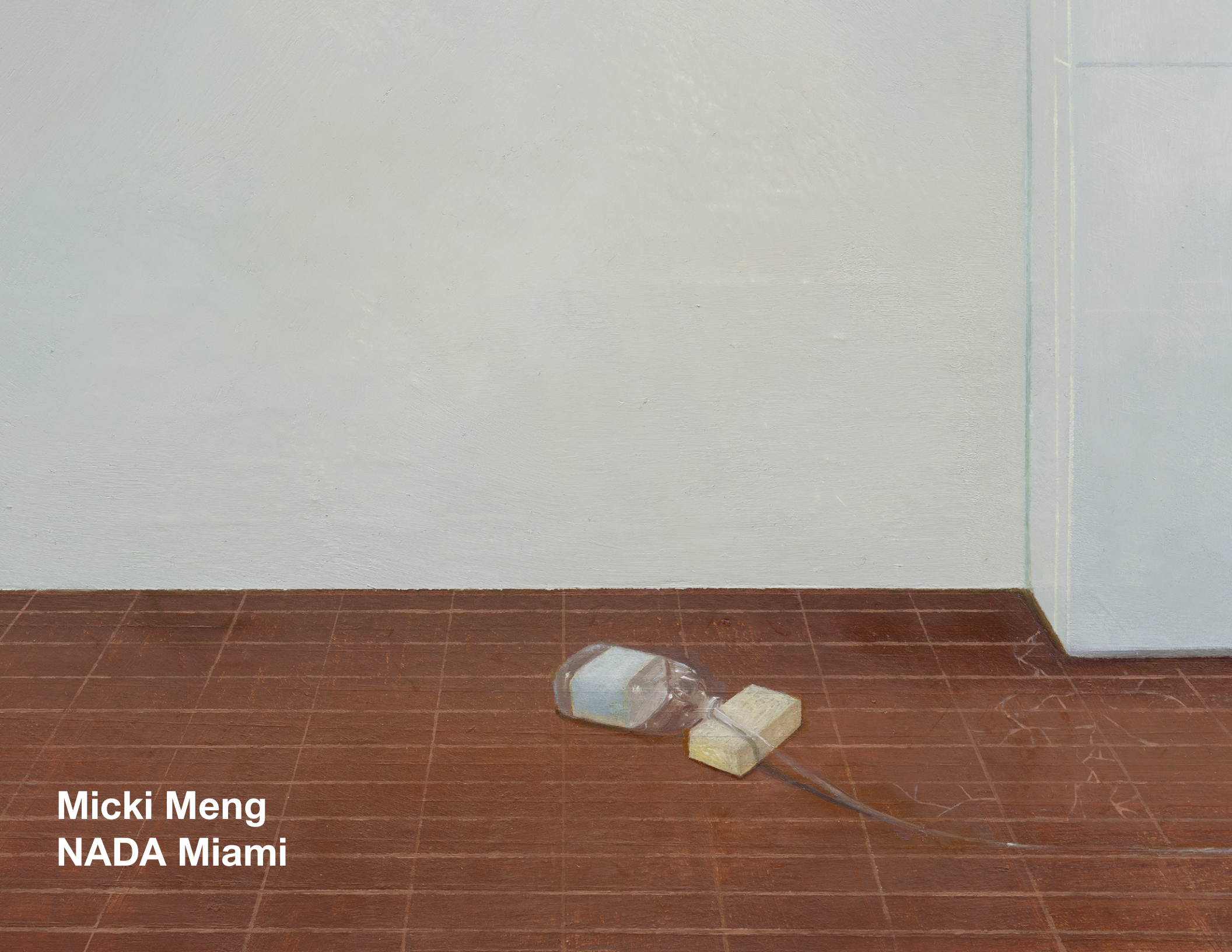
Micki Meng NADA Miami