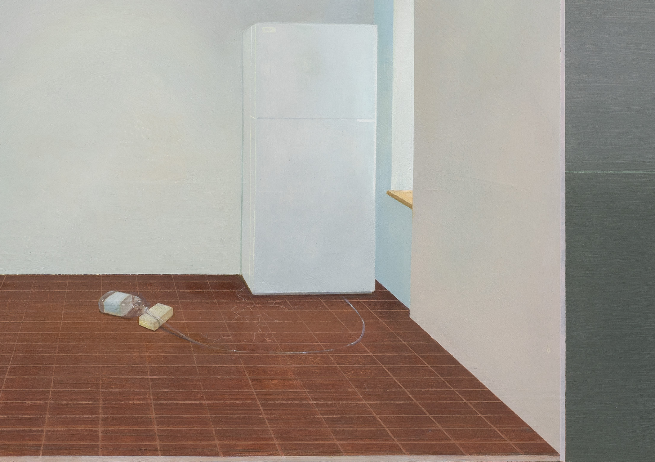
Detail, Water Damage , 2023