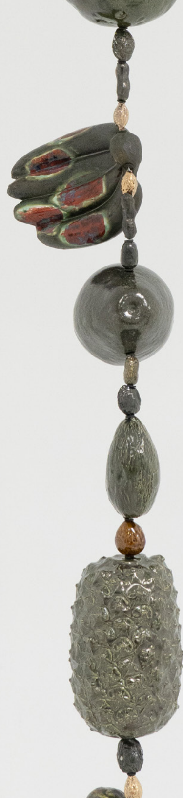
Detail, Fruit Strand 3 , 2022