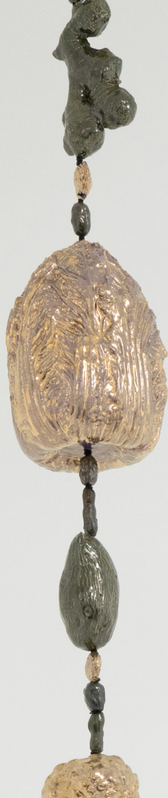
Detail, Fruit Strand 1 , 2022