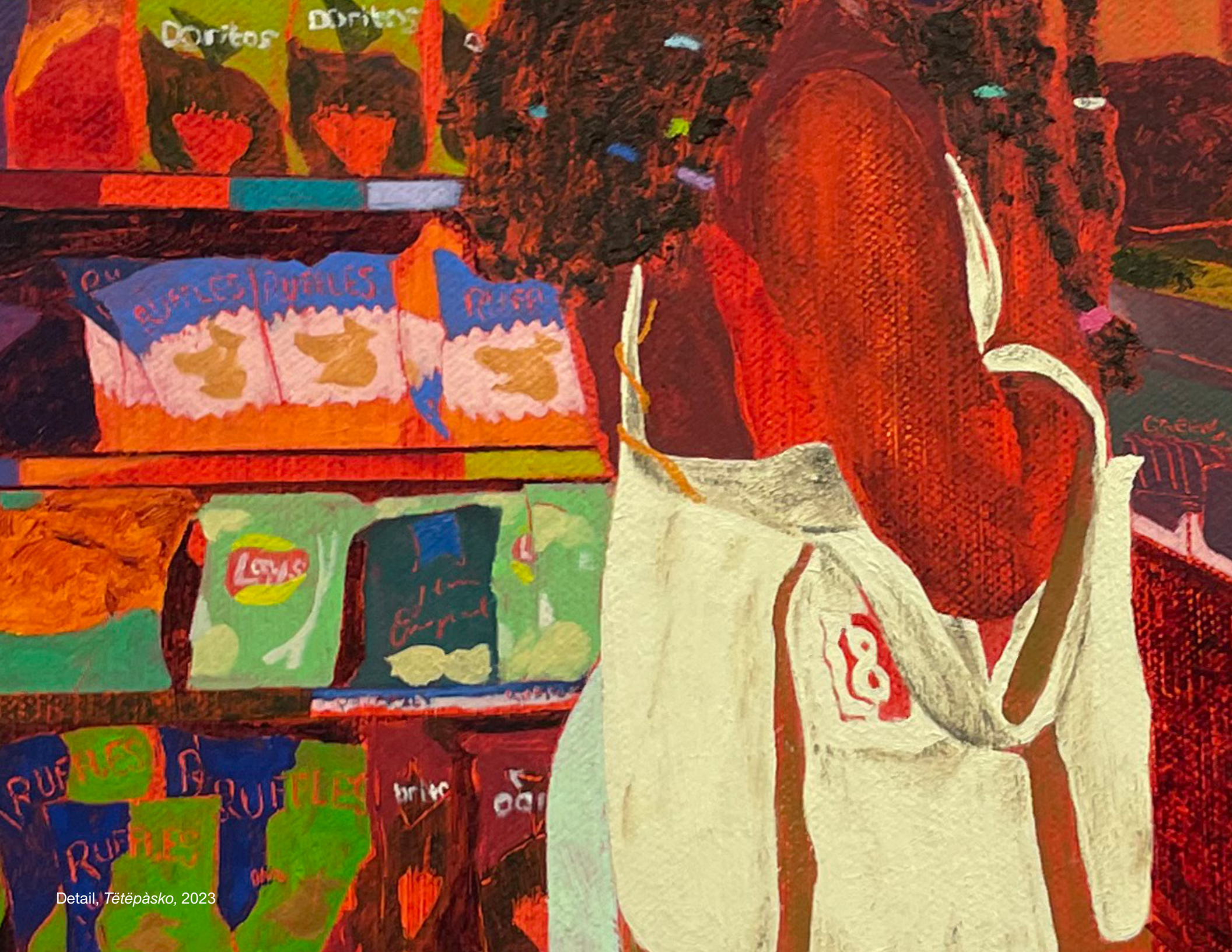
Detail, Tētēpāsko, 2023