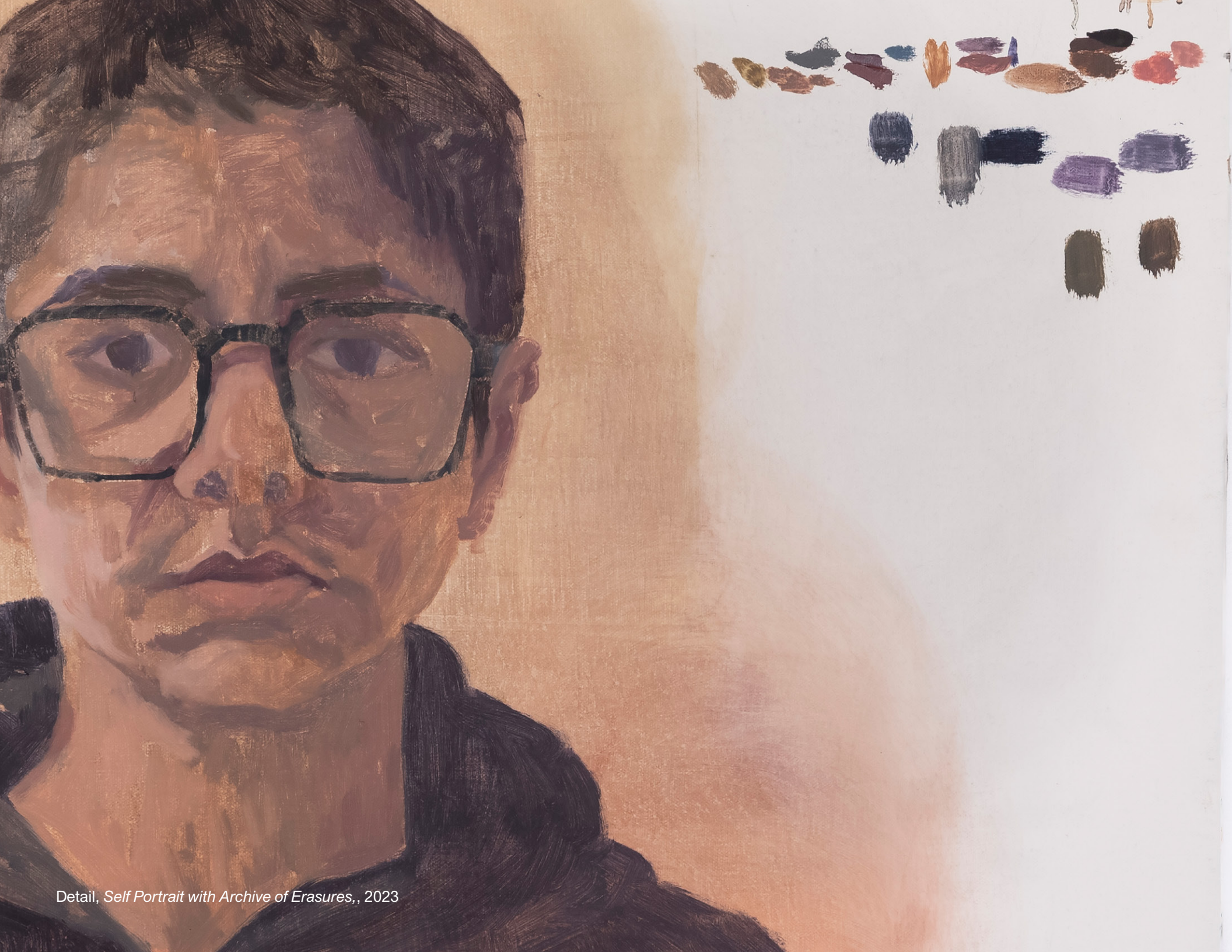
Detail, Self Portrait with Archive of Erasures , 2023