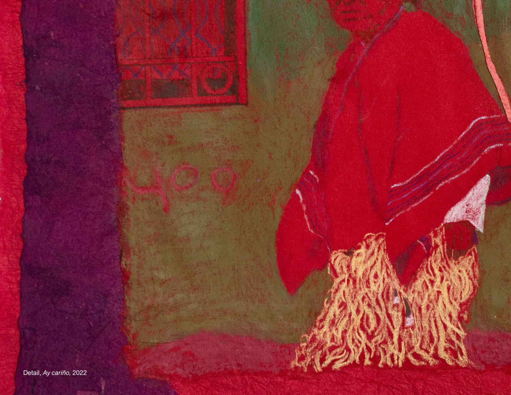
Detail, Ay cariño , 2022