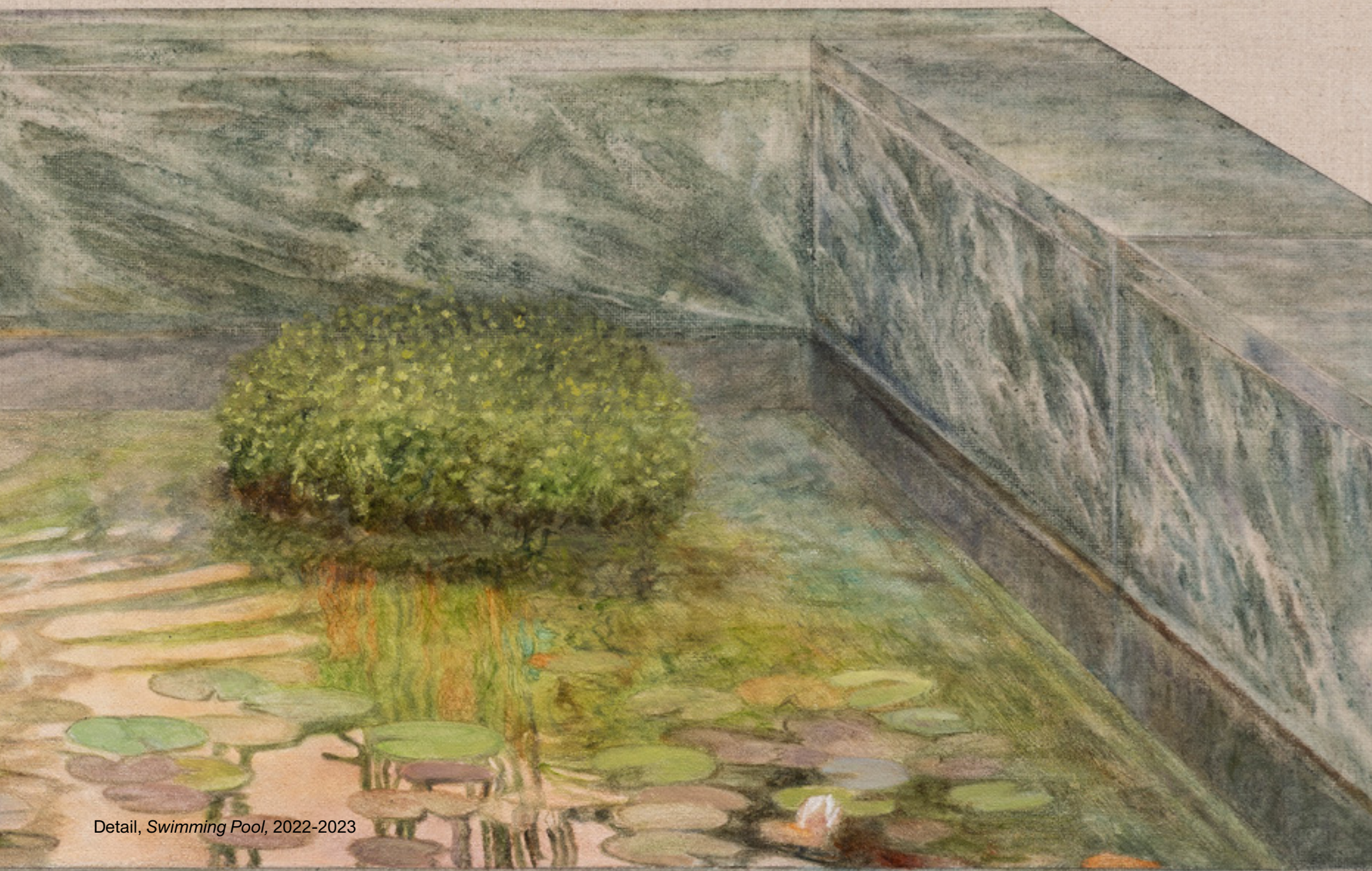
Detail, Swimming Pool , 2022-2023