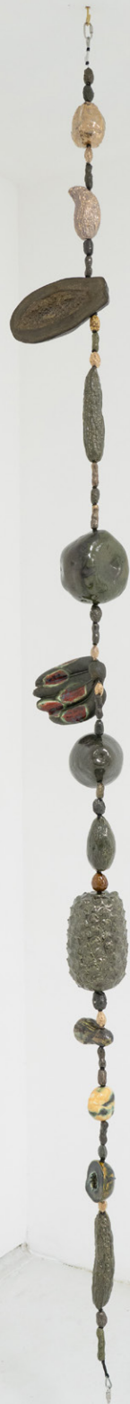
Cathy Lu Fruit Strand 3, 2022 Porcelain 0 in | 25.4 x 203.2 cm $ 12,000