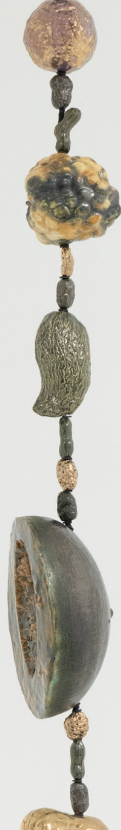
Detail, Fruit Strand 2 , 2022