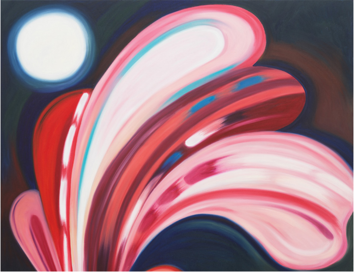
Hayal Pozanti, The Gate to All Mysteries (detail), 2025. Oil stick on linen, 80 × 60 in. (203.2 × 152.4 cm) © Hayal Pozanti