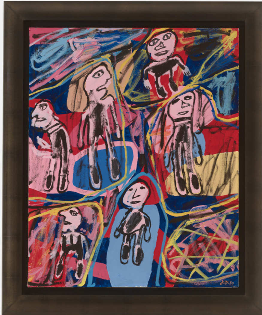
Jean Dubuffet Zône habitée , 1980 Signed (lower right) and dated (verso) Acrylic on canvas 39 \frac{3}{8} x 31 \frac{7}{8} in. (100 x 81 cm) T0014949