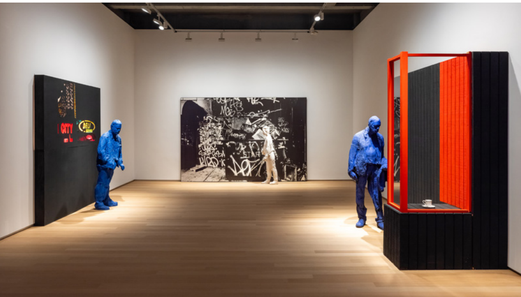
Exhibition view - Nocturnal Fragments , TEMPLON, New York, 2023

Since 1962, when the artist was discovered at a group Pop art collective exhibition, George Segal's sculptures have achieved international acclaim. Among his numerous solo exhibitions were major retrospectives in 1978 at Walker Art Center, Minneapolis, MN, at San Francisco Museum of Modern Art, CA, at Whitney Museum of American Art, New York, NY, USA, in 1997 at the Musée des Beaux-Arts de Montréal, in 1998 at the Hirshhorn Museum and Sculpture Garden, Washington, D.C, in 2002 at Utsunomiya Museum of Art, Utsunomya, Japan and at the Hermitage State Museum in St Petersburg in Russia. Galerie Templon presented George Segal's works for the first time in 1979 in Paris, as part of the group exhibition La peinture américaine . George Segal's work features in the most prestigious international collections, such as the MoMA, New York, the Moderna Museet, Stockholm, the Musée d'art moderne de la Ville de Paris, France, the Kunsthaus Zurich, Germany or Israel Museum. Two of his works are currently included in the internationally touring exhibition, Reshaped Reality: 50 Years of Hyperrealistic Sculpture .