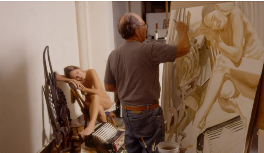
Philip Pearlstein in his studio, New York, 1980's

His work features in over 70 public American collections, including at the Museum of Modern Art, New York, Metropolitan Museum of Art, New York, and National Gallery of Art, Washington, as well as at Tate Britain (London), Berlin Nationalgalerie, Museum Ludwig (Cologne) and the Berardo Collection Museum (Lisbon). He passed away in New York City, in December 2022.