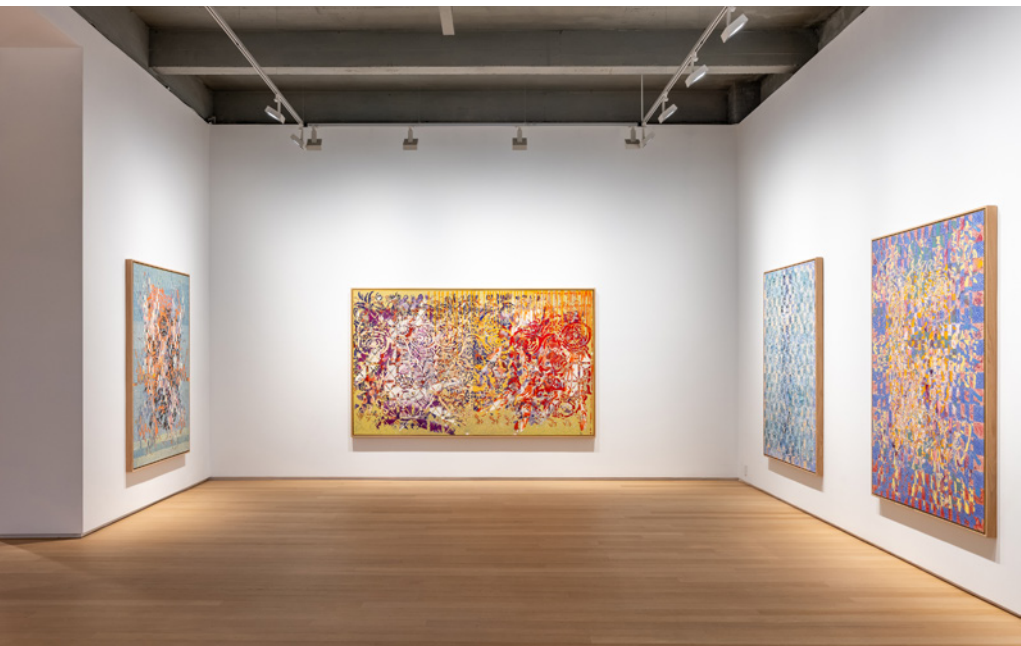
Exhibition view - Recorda , TEMPLON, New York, 2025