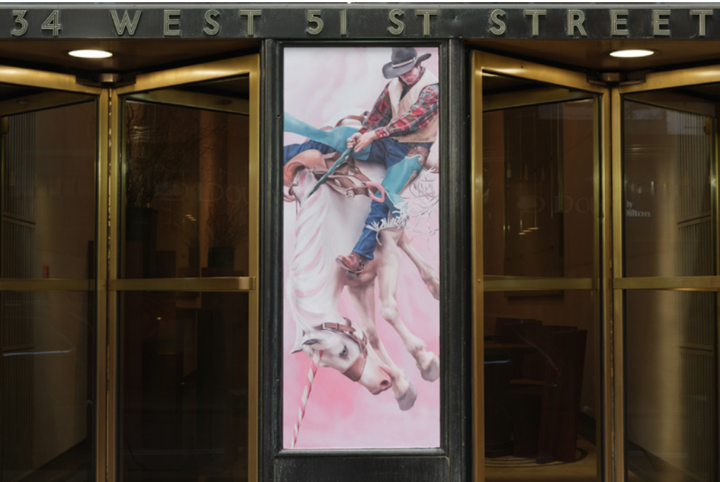
Exhibition view - Art in Focus, Rockefeller Center, New York, 2025

Showcasing a new body of work, his current exhibition Between Instinct and Reason continues to reflect on pop culture and a new American mythology, introducing the mermaid as a new player. The show will be on display at TEMPLON New York through June 2025. Concurrently, through May 31st, 2025, large scale murals of his artwork are on display throughout the Rockefeller Center, New York, as part of the Art in Focus public installation project.