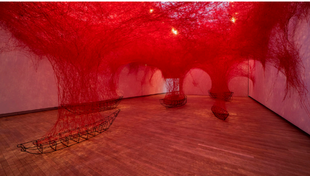
Exhibition view - A Tide of Emotions , Grand Palais, Paris, 2024