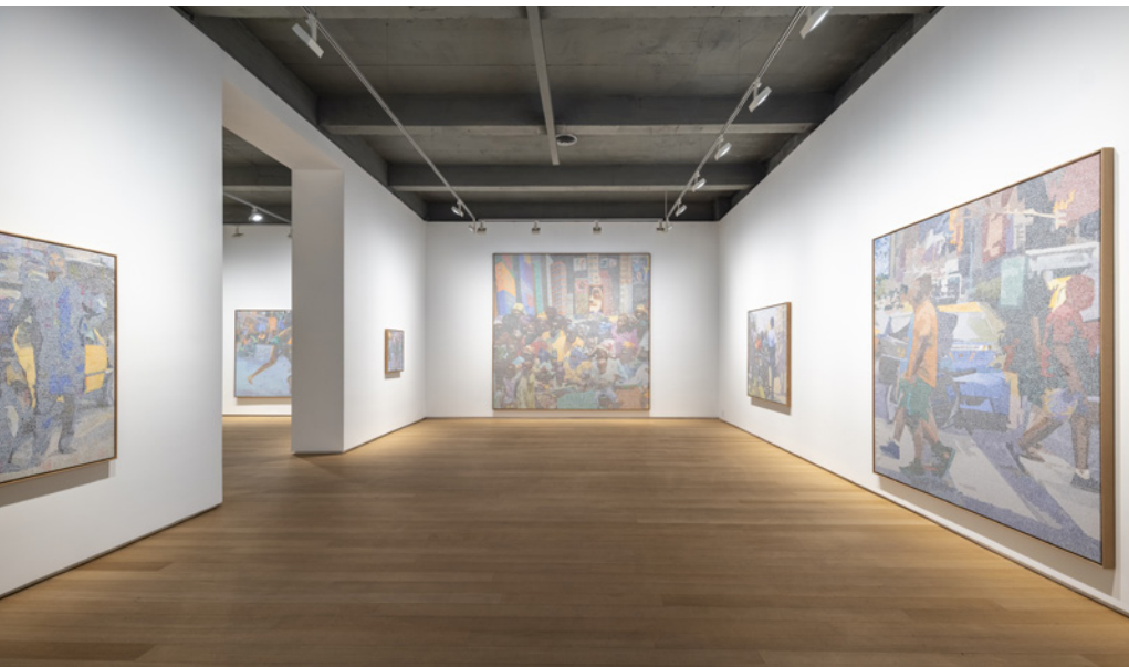
Exhibition view - Jokkoo , TEMPLON, Paris, 2023