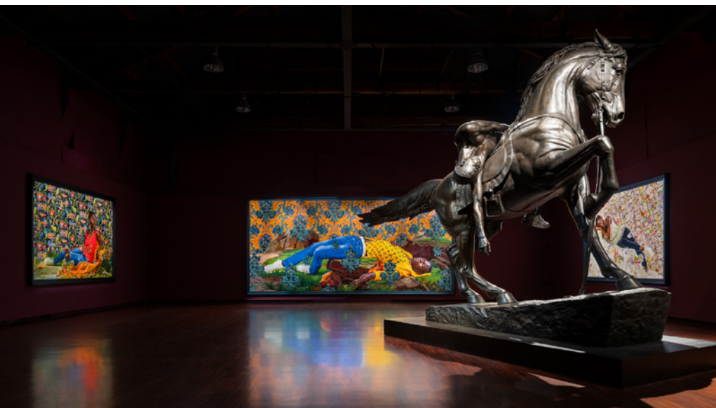
Exhibition view - An Archeology of Silence , Fondation Cini, Venice, 2022

His project, "Kehinde Wiley: An Archeology of Silence," was part of the Collateral Events at the 59th International Art Exhibition, La Biennale di Venezia, in 2022. This traveling exhibition was shown at the Musée d'Orsay, Paris (2022); the De Young Museum, San Francisco (2023) and the The Museum of Fine Arts, Houston (2024). His project "Maze of Power" was shown in 2023 at the Musée du Quai Branly in Paris, then at the Museum of Black Civilizations in Dakar in 2024 and will be presented at the Mohammed VI Museum of Modern and Contemporary Art in Rabat in March 2025.