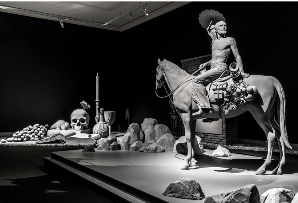
Exhibition view - Nocturnal Journey , The Royal Museum of Fine Arts Antwerp, Antwerp, 2025

From November to December 2024, Templon New York hosted a project on an unprecedented scale. "Whispered Tales" was the gallery's first exhibition of work by Belgian artist Hans Op de Beek, an immersive ensemble that occupied the 500 square meters of the gallery's New York space. Until August 17, 2025, The KMSKA is dedicating a solo show entitled "Nocturnal Journey" to Hans Op de Beek in Antwerp. The artist invites the visitor to take a journey through time and space, in body and mind, in an environment that carries the silence, the meditative but also the darkness and latent derailment of the night.