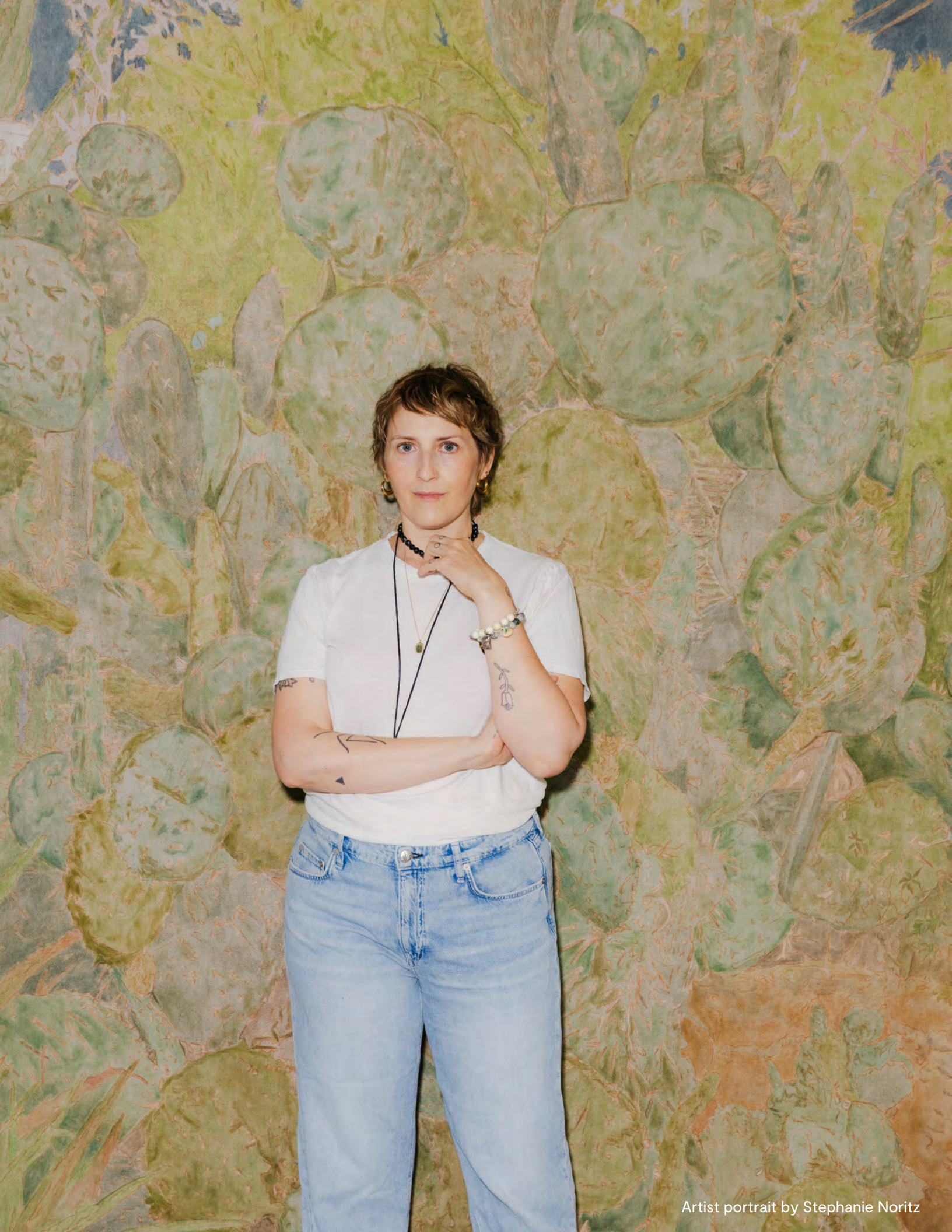
Artist portrait