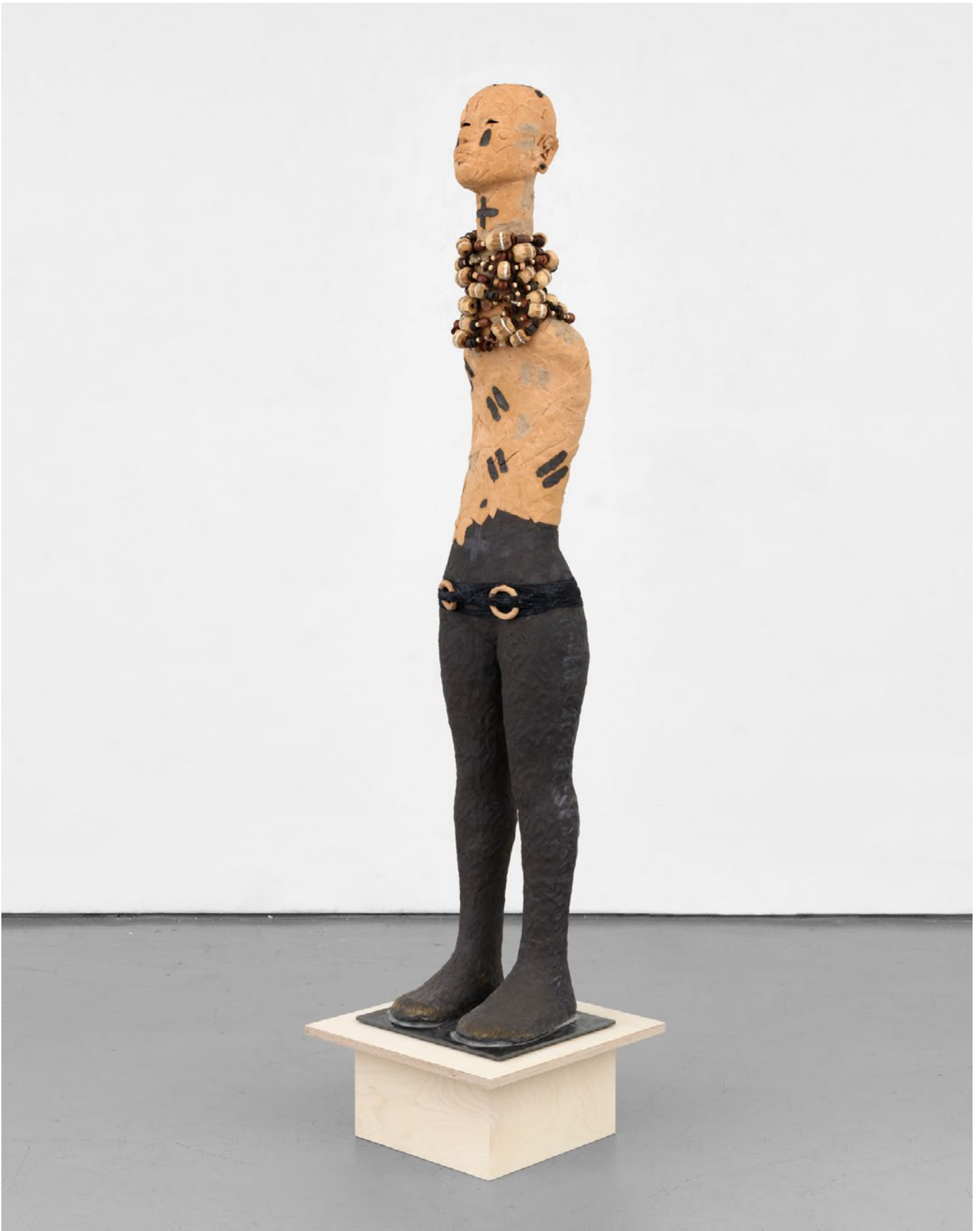
Rose B. Simpson | Maker | 2023 | Ceramic, glaze, steel, grout, beads (wood, ceramic, citrine), pumice concrete, twine 65 1/2 x 14 x 12 inches (artwork) | 8 x 18 x 18 inches (pedestal) | #RBS23.001