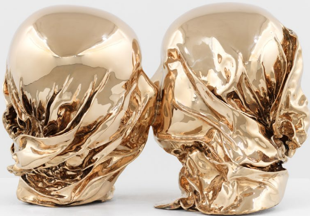
Hank Willis Thomas | Everything we see hides another thing | 2022 Polished bronze | 11 x 17 x 9 1/2 inches | Edition of 3, with 2AP | #HWT22.041