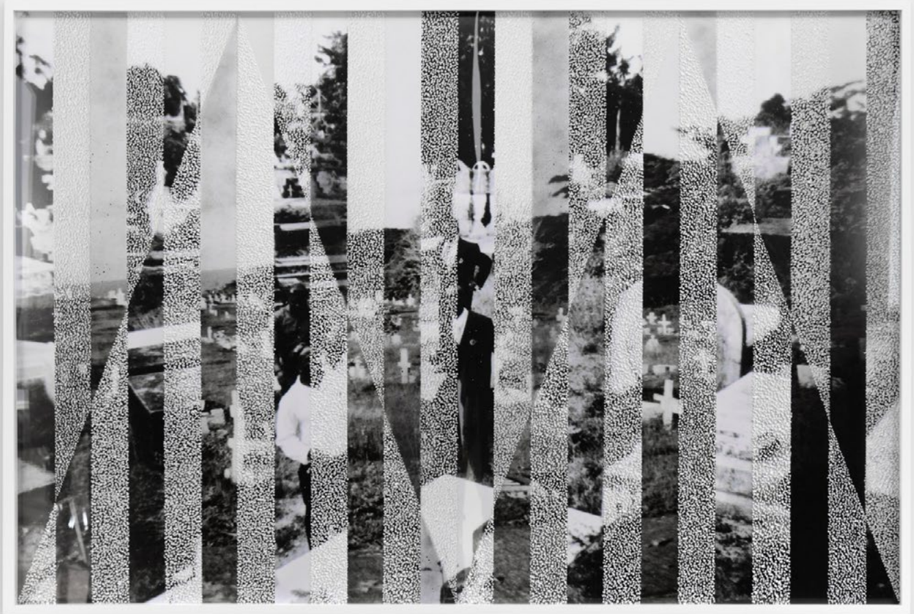
Paul Anthony Smith | The Violence of His Embrace of Things American is Embarrassing | 2018 Unique picotage on inkjet print, pencil and spray paint, mounted on museum board | 41 x 60 3/4 x 2 inches (framed) | #PAS18.019