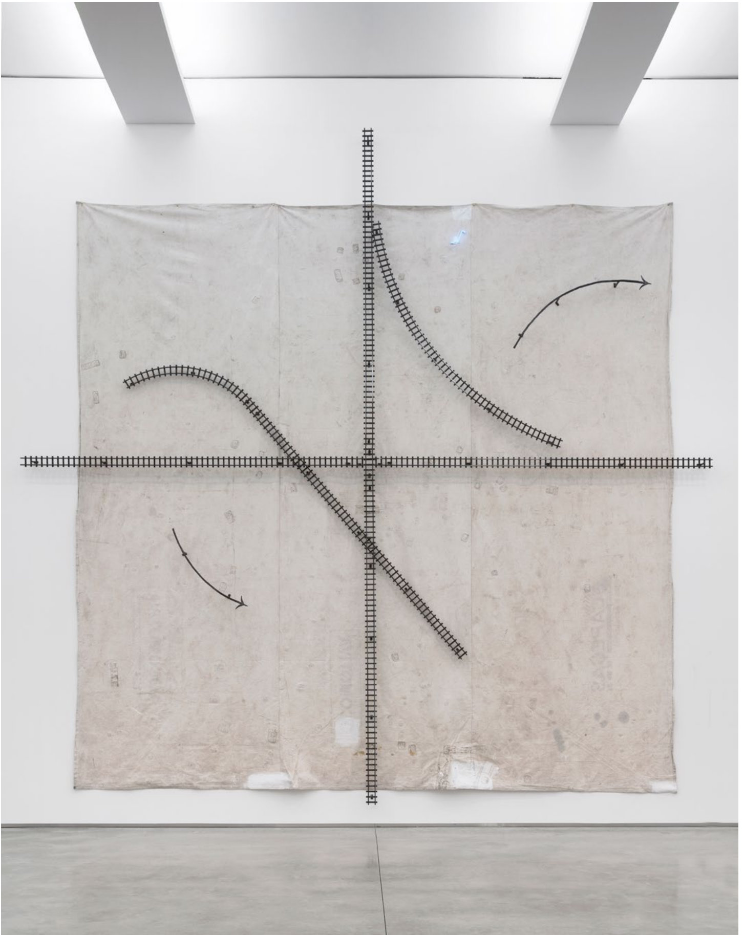
Radcliffe Bailey | Upwards | 2018 | Tarp, steel railroad tracks, and neon | 240 x 240 x 7 inches | #RB18.003