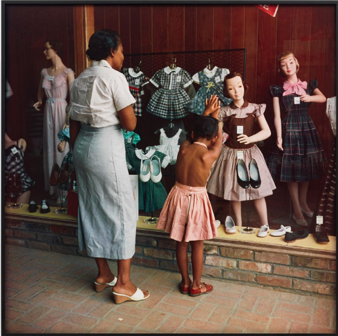
Gordon Parks | Untitled, Mobile, Alabama | 1956 Archival pigment print | 45 3/4 x 46 1/4 x 1 1/2 (framed) | Edition of 7, with 2APs | #GP56.026