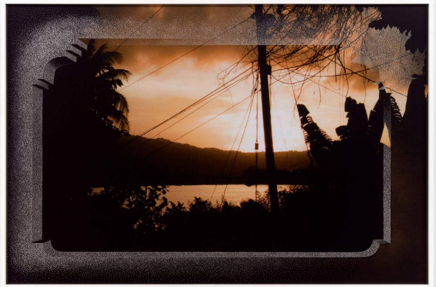
Paul Anthony Smith | Eye Fi di Tropics #1 | 2021 Picotage on inkjet print mounted on Dibond | 40 7/8 x 60 7/8 x 1 3/4 inches (framed) | #PAS21.022