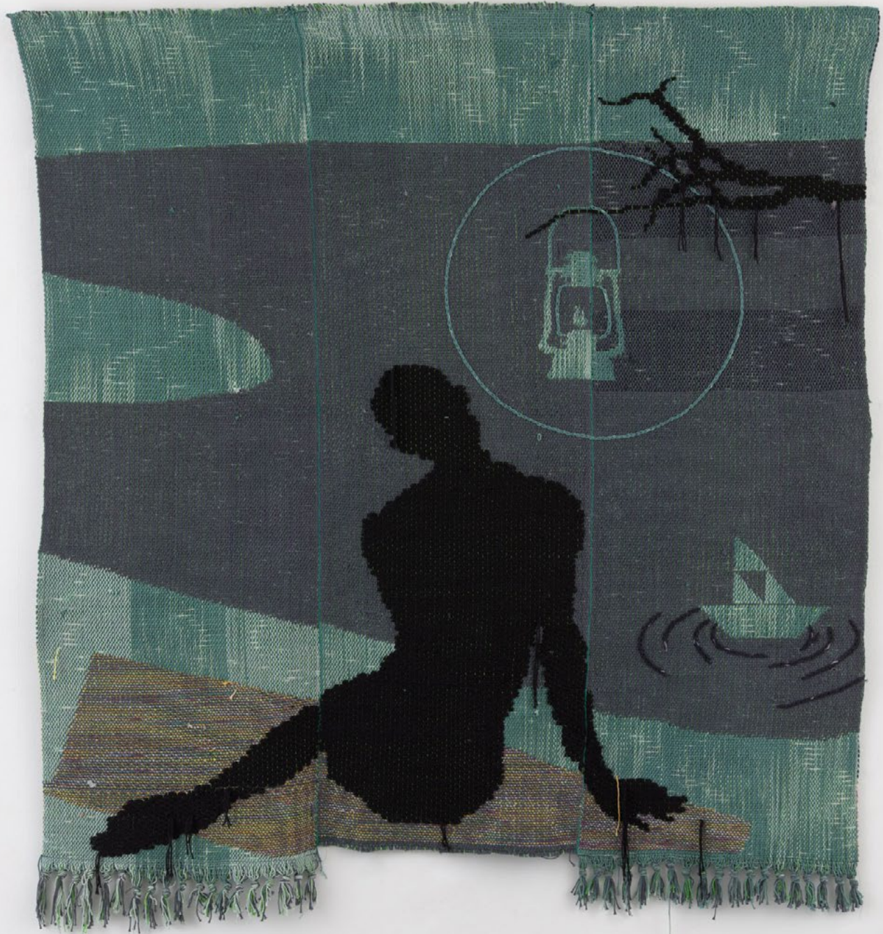
Diedrick Brackens | balanced and sleepless | 2023 | Cotton and acrylic yarn | 79 x 82 inches | #DIB23.006