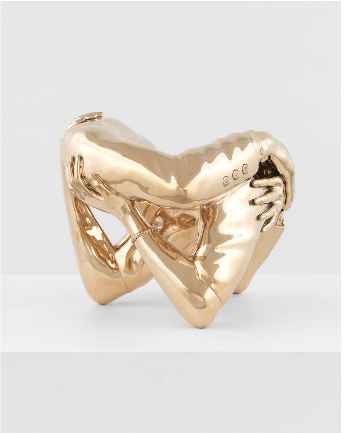
Hank Willis Thomas | The Embrace | 2023 | Bronze | 7 1/2 x 10 x 10 inches | Edition of 50, with 10AP | #HWT23.008