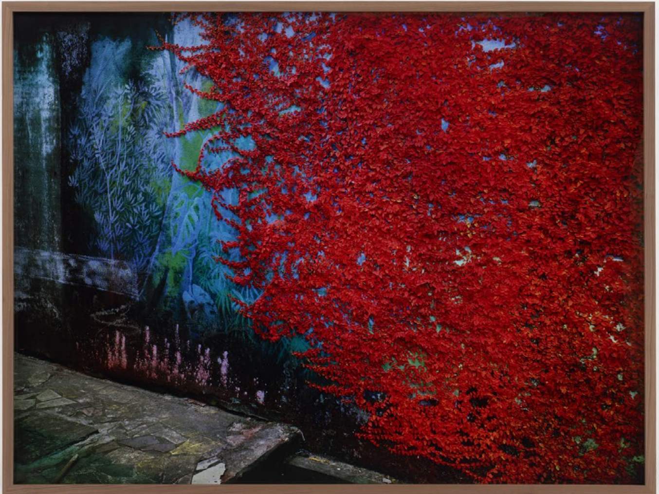
Richard Mosse | Creeper, Belém do Pará | 2023 C-print | 30 7/8 x 40 7/8 x 1 1/2 inches (framed) | Edition of 5, with 2AP | #RIM23.001