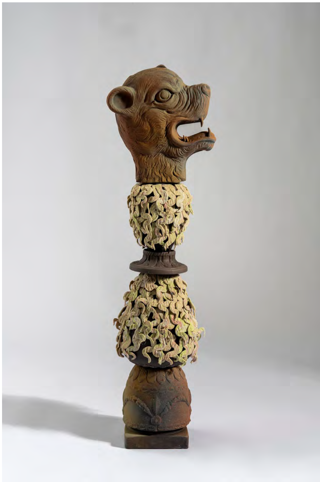
Ti avrei rubato