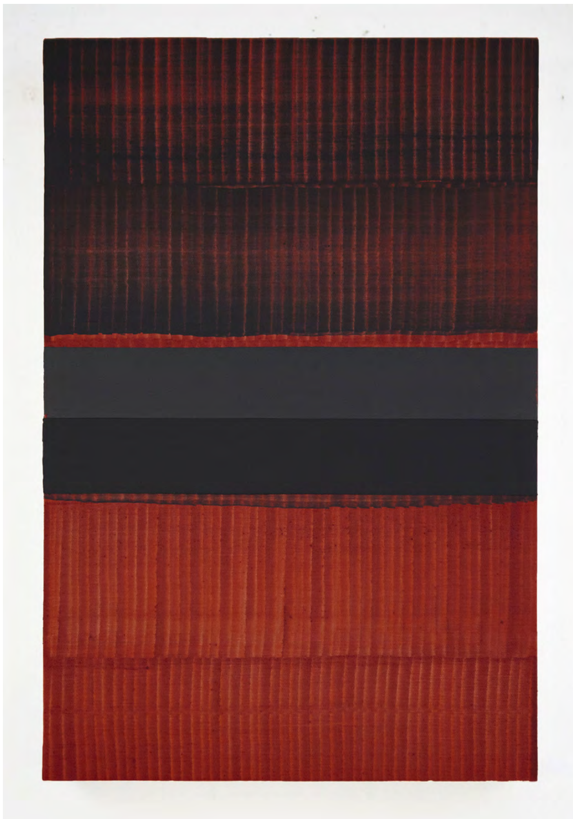
Horizonte abisal 3