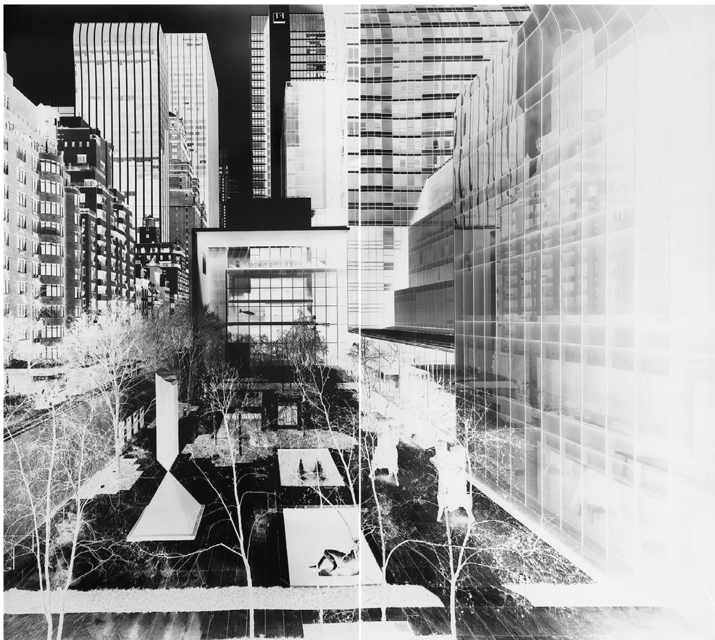
The Museum of Modern Art, I: April 14