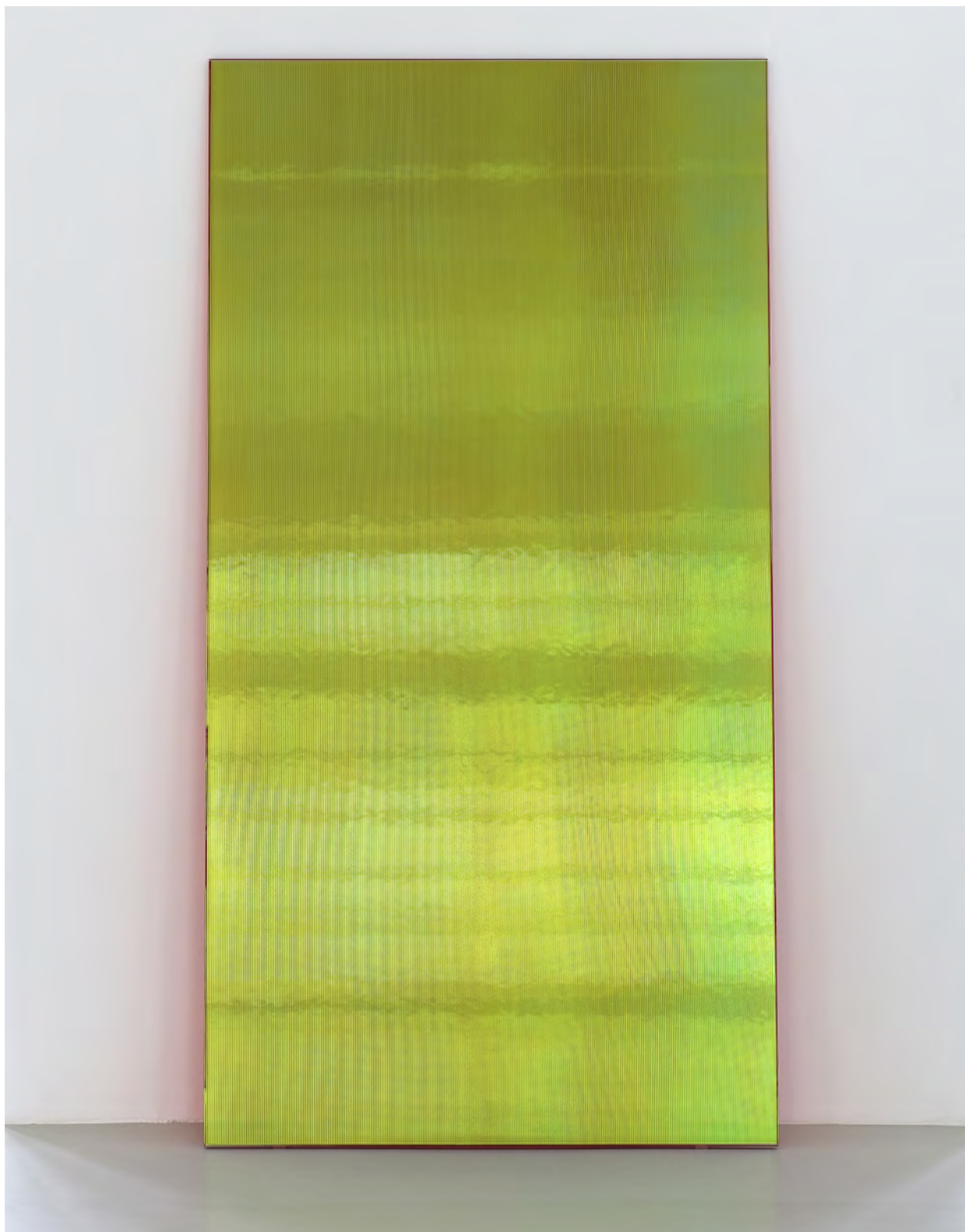
Pinky Sunset R

2019 dichroic laminated glass consisting of ribbed glass, float glass and gelatin filters 200 x 100 x 1,4 cm edition of 1, 1 A.P. and 1 E.C., ed. 1