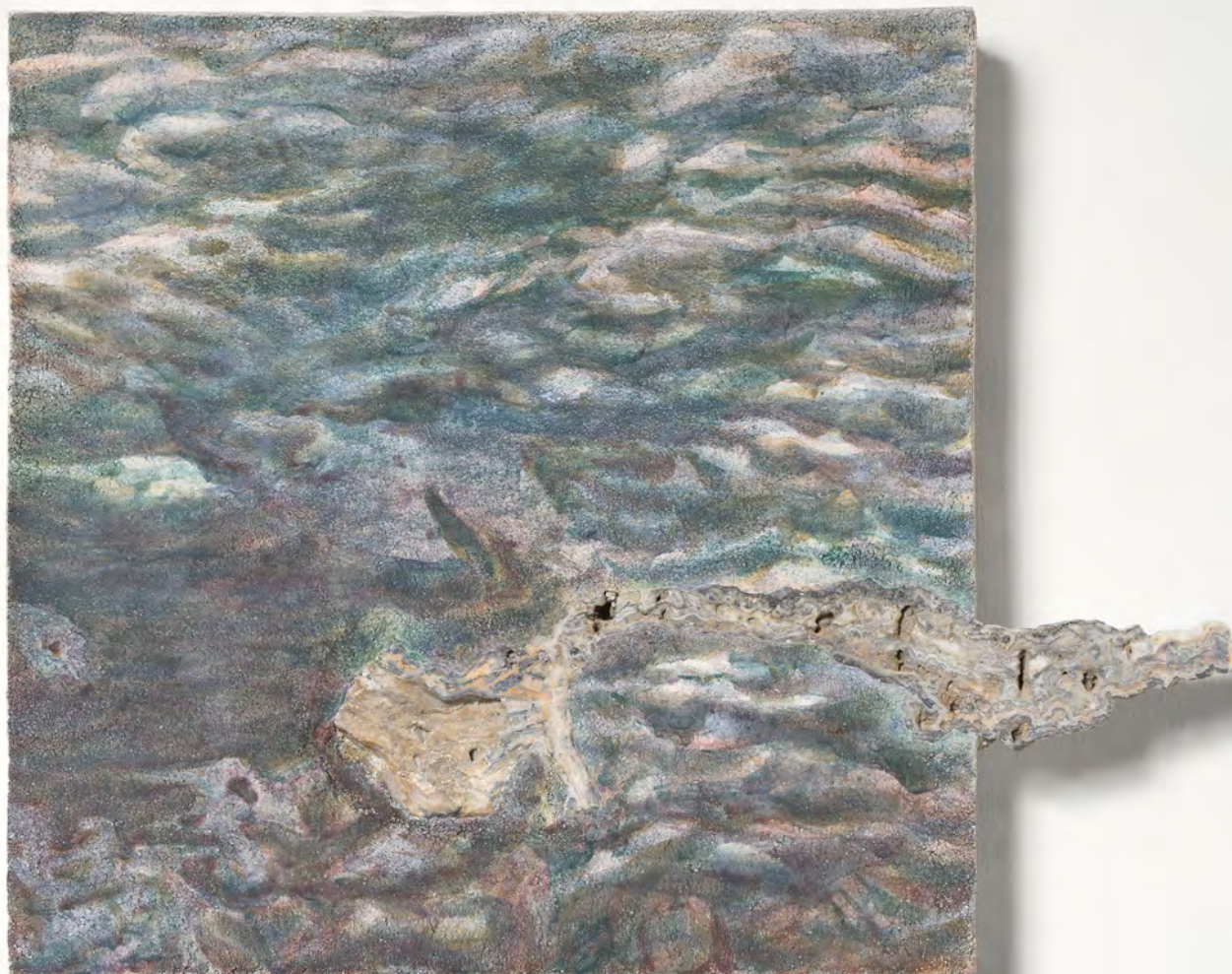
Surface to Air XI iii (Tartaruga/Morning, Afternoon)