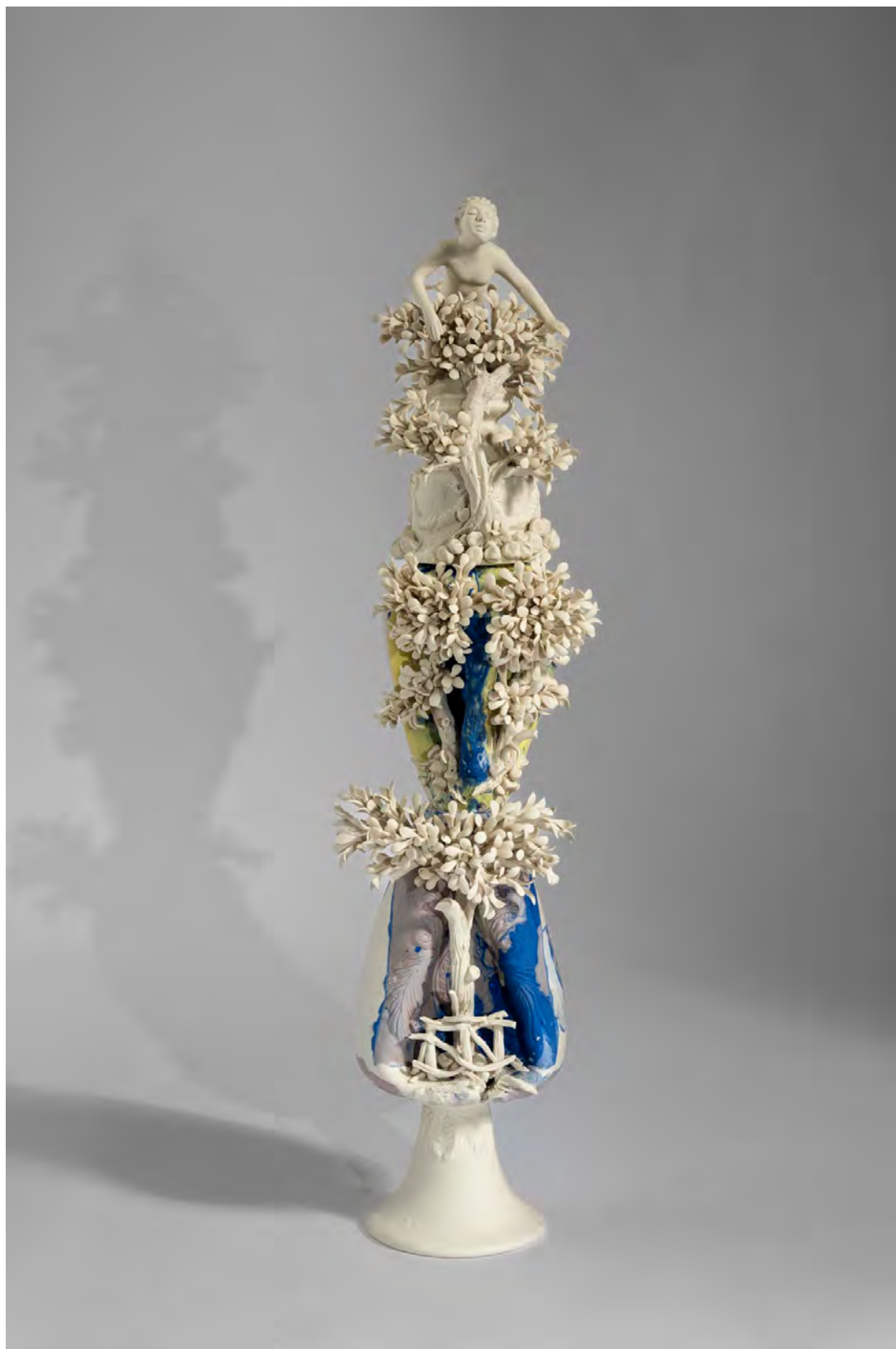
Ti avrei rubato