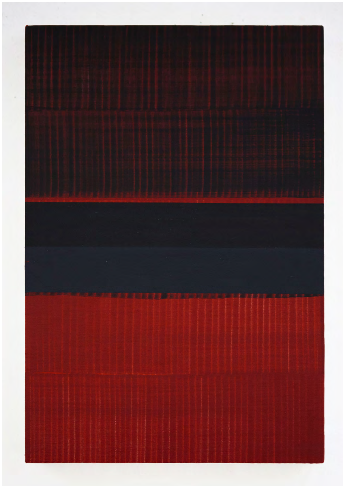
Horizonte abisal 1