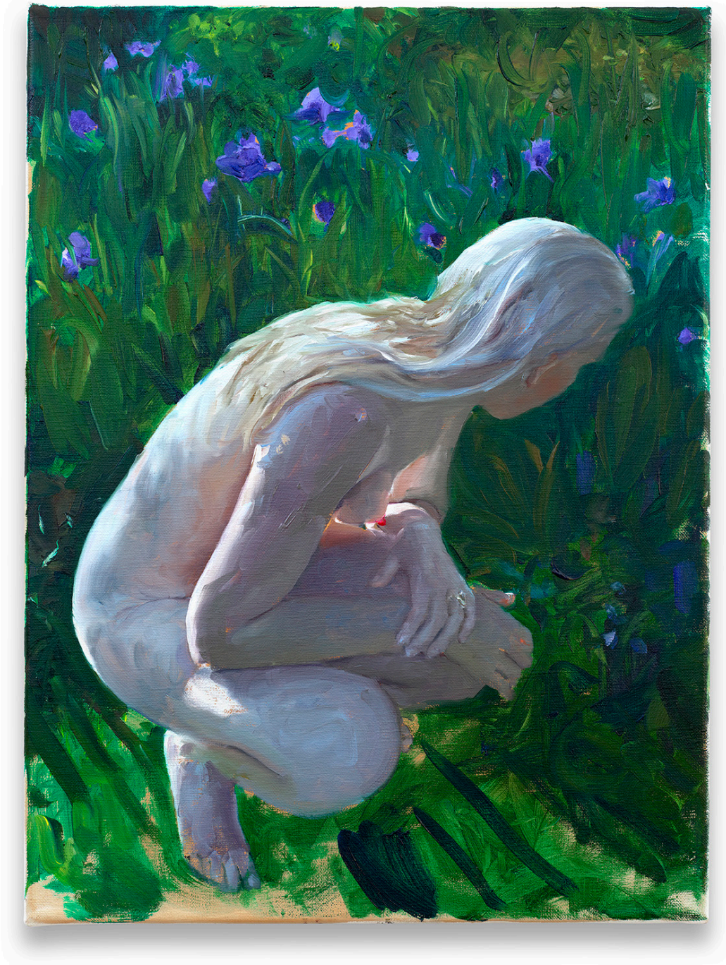
Into the irises, 2026 Oil on linen 16 × 12 inches (40.6 × 30.5 cm) JGR-5844 Sold