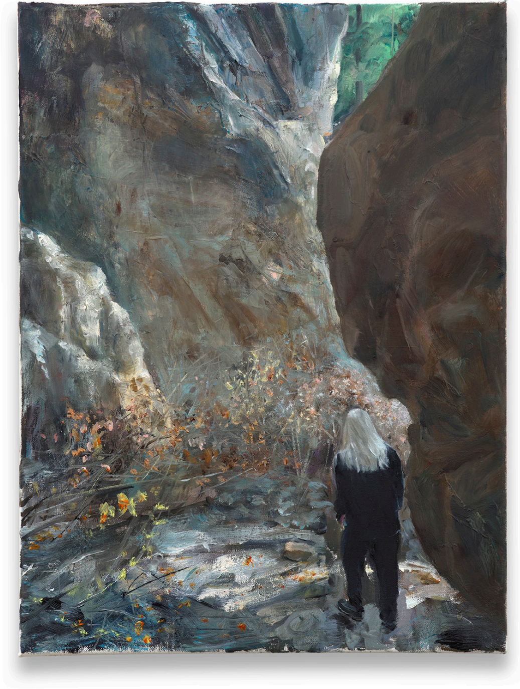
In the shadow of a heavy formation, 2026 Oil on linen 16 × 12 inches (40.6 × 30.5 cm) JGR-5851 80,000 USD