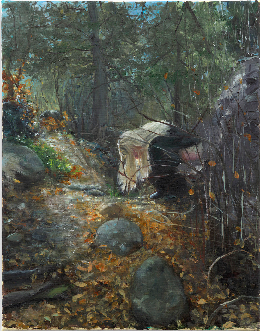
Onto damp decay, 2026 Oil on linen 14 × 11 inches (35.6 × 27.9 cm) JGR-5852 80,000 USD