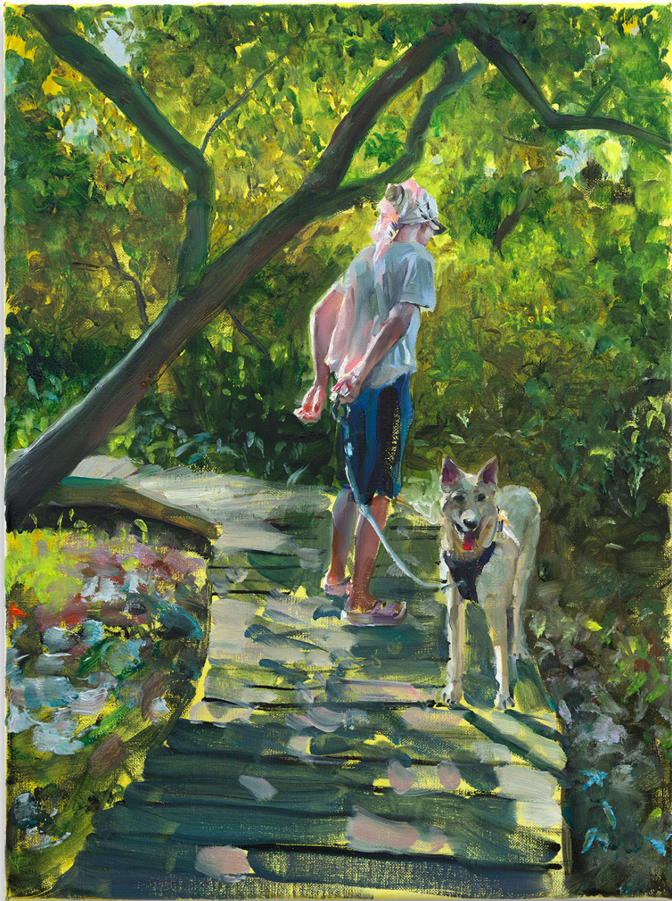
Through the Sunken Forest, 2026 Oil on linen 16 × 12 inches (40.6 × 30.5 cm) JGR-5850 Sold