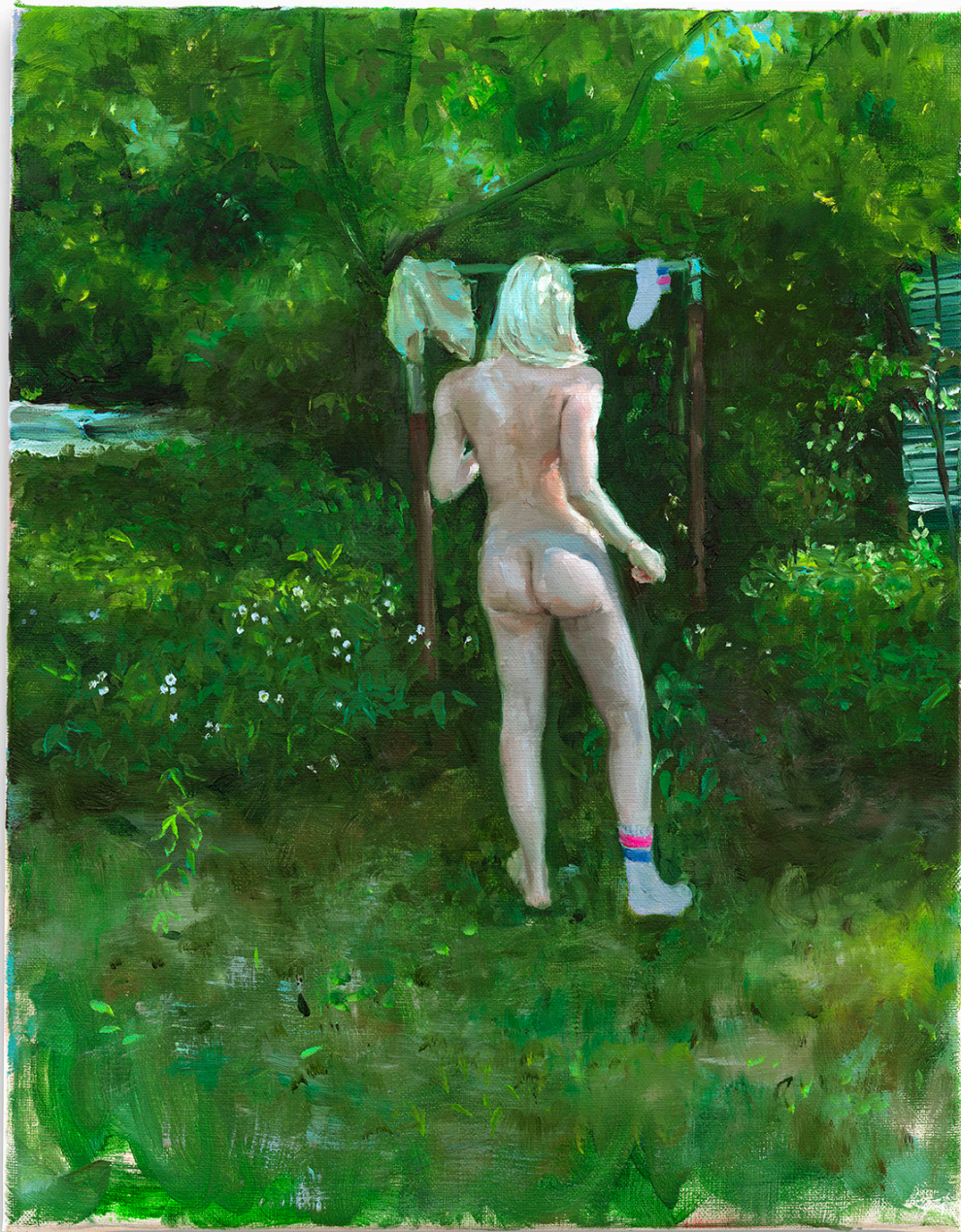
In wet socks, 2026 Oil on linen 14 × 11 inches (35.6 × 27.9 cm) JGR-5847 80,000 USD