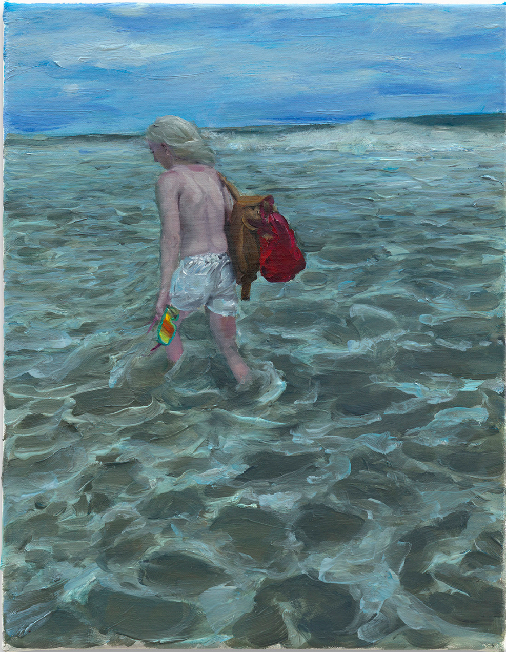
From Cherry Grove to The Pines, 2026 Oil on linen 14 × 11 inches (35.6 × 27.9 cm) JGR-5848 Sold