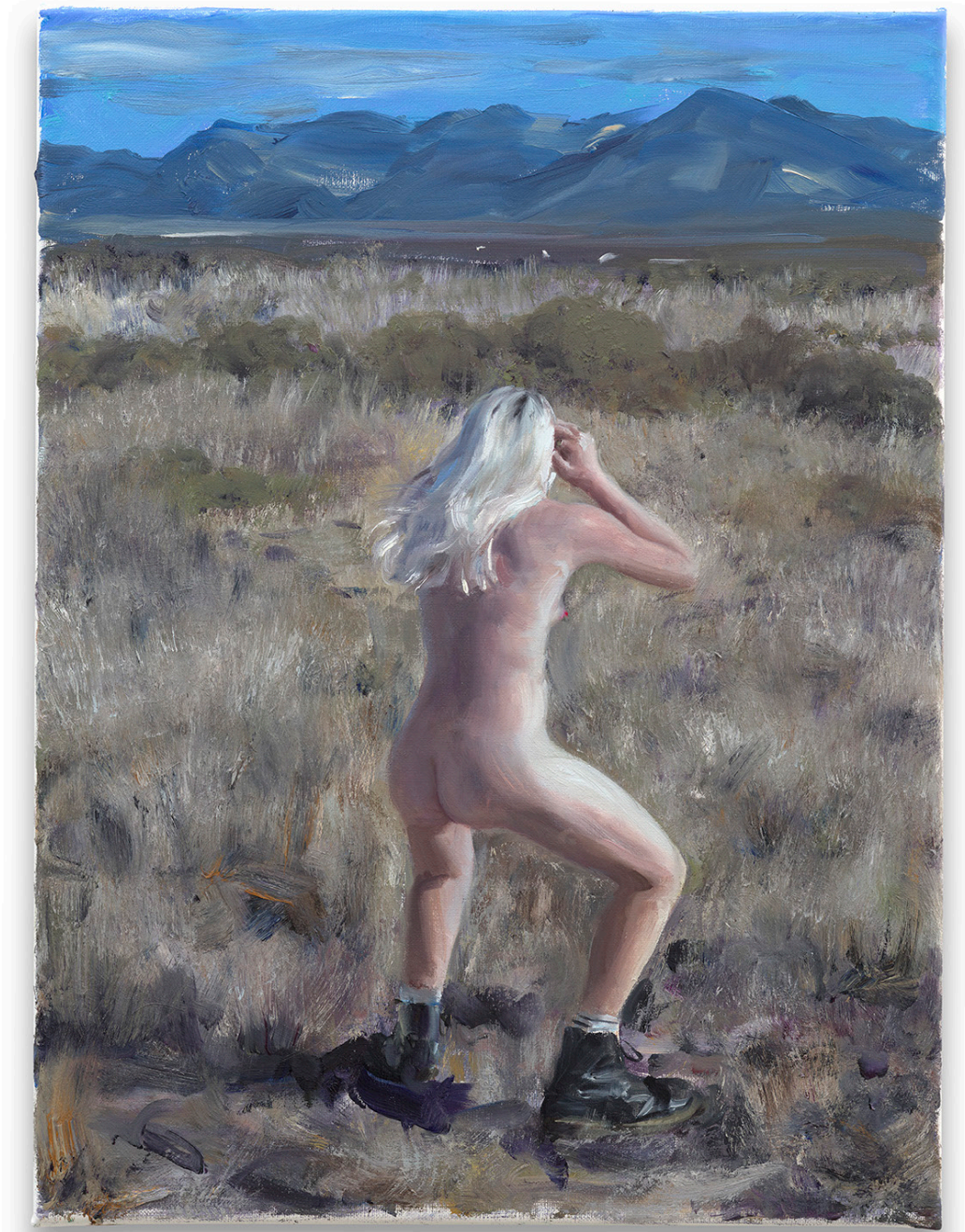
Towards the holy mountain, 2026 Oil on linen 16 × 12 inches (40.6 × 30.5 cm) JGR-5845 80,000 USD