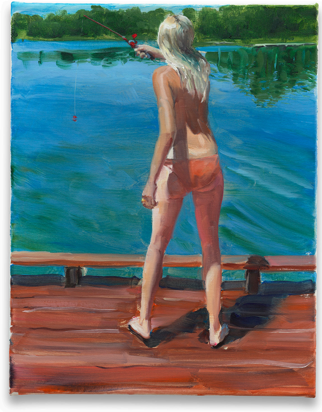
In pursuit of a Crossville fish, 2026 Oil on linen 14 × 11 inches (35.6 × 27.9 cm) JGR-5846 Sold