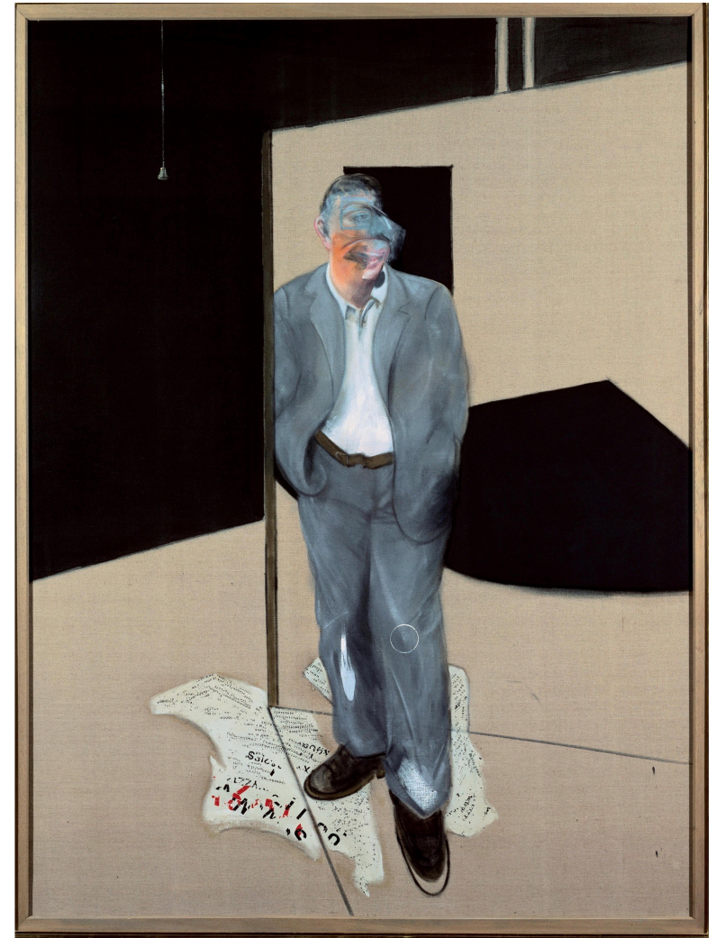
FRANCIS BACON (1909 – 1992) Study of a Man Talking , 1981 Oil and dry transfer lettering on canvas 78 x 58 in. (198 x 147.5 cm.)